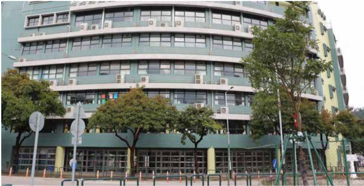
Macau Anglican College

In January, several parents from the Macau Anglican College refused to bring their children to school following the discovery of asbestos, which can cause serious chronic respiratory disease, in the vicinity.