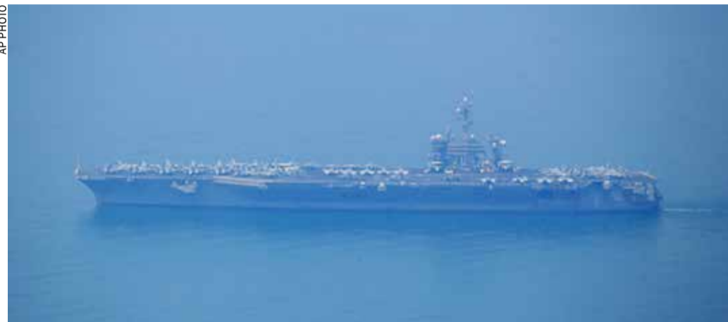
USS Carl Vinson sails in Danang Bay yesterday

FOR the first time since the Vietnam War, a U.S. Navy aircraft carrier is paying a visit to a Vietnamese port, seeking to bolster both countries' efforts to stem expansionism by China in the South China Sea.