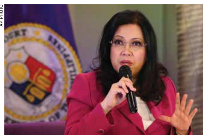
Supreme Court Chief Justice Maria Lourdes Sereno