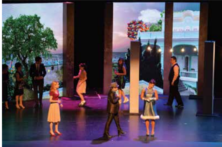
A satire show staged by Doci Papiçam di Macau

In the paper, titled “Contact languages around the world and their levels of endangerment”, author Nala H. Lee of the National University of Singapore assessed 96 contact languages through a “Language Endangerment Index” that is based on four factors: intergenerational transmission, absolute number of speakers, speaker number trends, and domains of use. Each factor is rated on a scale of 0 (safe) to 5 (critically endangered).