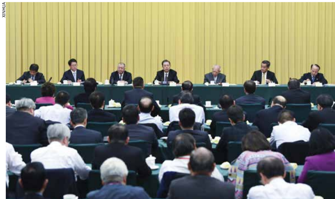
Zhao Leji, member of the Standing Committee of the Political Bureau of the Communist Party of China (CPC) Central Committee, joins a panel discussion with political advisors from HK and Macau. Edmund Ho (center, left) is among them