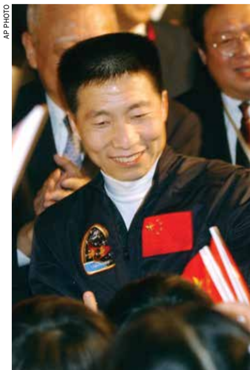
China's first astronaut Yang Liwei

C HINA will begin recruiting civilian astronauts for its military-backed space program and plans to increase the number of crewed missions to around two a year, a top official with the country's space program said.