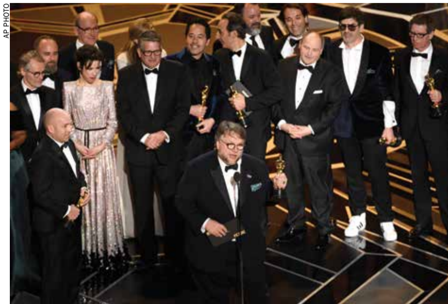
Guillermo del Toro with the cast and crew of "The Shape of Water"