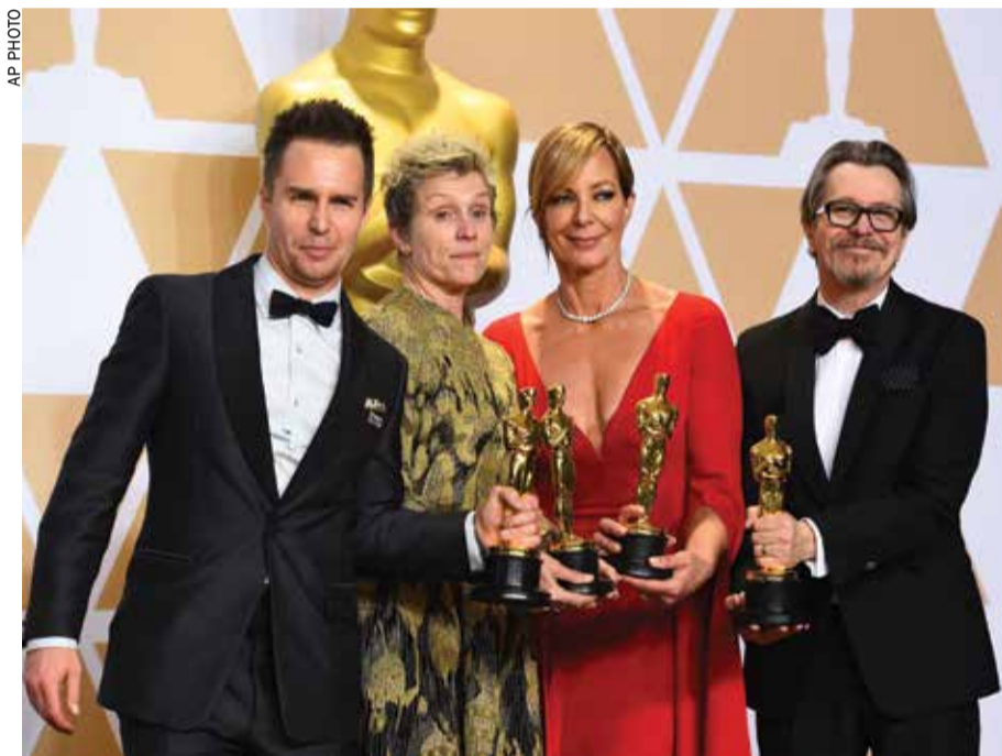
From left: Sam Rockwell (Best Actor in a Supporting Role), Frances McDormand (Best Actress), Allison Janney (Best Actress in a Supporting Role) and Gary Oldman (Best Actor)