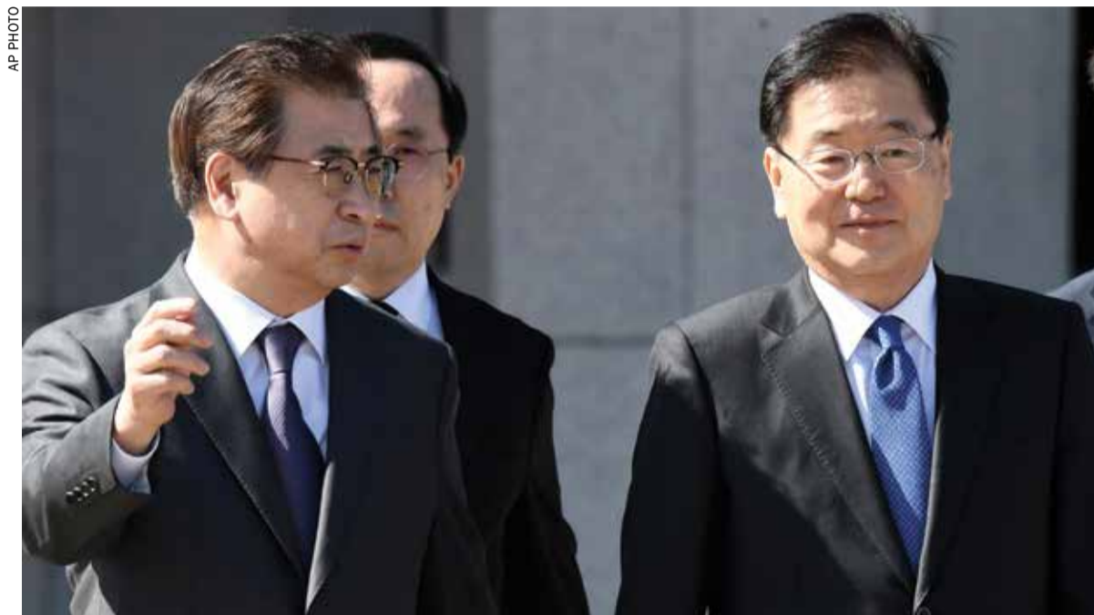
South Korea's national security director Chung Eui-yong (right) and National Intelligence Service Chief Suh Hoon talk before boarding an aircraft to Pyongyang yesterday

willingness to disarm during the visit by the South Koreans, there is speculation that it and Washington could set up their own talks on the North's nuclear weapons. But North Korea has repeatedly said it won't put its nuclear program up for negotiation, while the United States has made clear that it doesn't want empty talks and that all options, including military measures, are on the table. Previous warming ties between the Koreans have come to no-