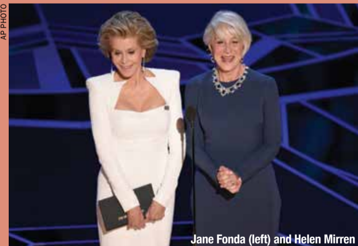
Jane Fonda (left) and Helen Mirren

Meryl Streep always seems to be in the middle of the discussion at the Oscars, whether onstage or not. The actress, nominated yet again for "The Post," didn't win, but people referred to her constantly. Kimmel quipped in a speech that she didn't get nominated for a stretch in the '90s, but "that's only because she was in prison." Tiffany Haddish curtsied to Streep on the red carpet, then gushed about her onstage. And Jodie Foster and Jennifer Lawrence practically did a comedy routine about the venerated actress. Foster explained that she was on crutches because Streep "I, Tonya'd me." Lawrence commiserated that Streep had tripped her once.