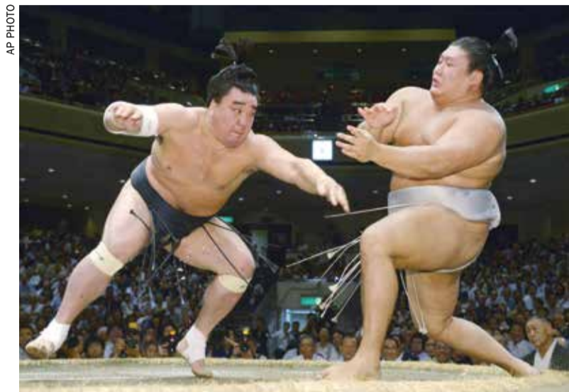
Mongolian Harumafuji (left) pushes opponent Takanoiwa during a bout last year

Takanoiwa, who fractured his skull in an altercation with former Grand Champion Harumafuji in a restaurant last October, is hoping to make a comeback at the Osaka event.