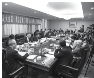
A plenary meeting of deputies from Macau yesterday in Beijing

Chan Meng Kam suggested that China should amend the regulation of the Greater Bay Area