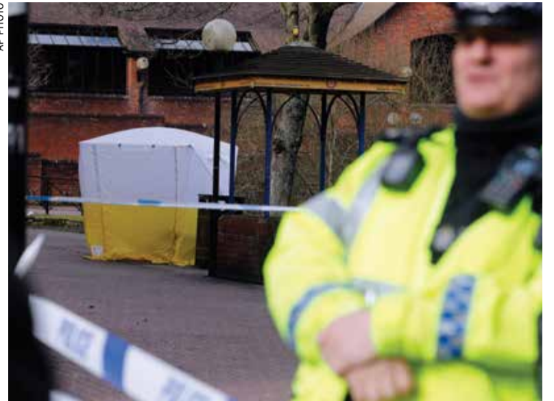
A Police officer secures the area as a police tent covers the spot in Salisbury where former Russian spy double agent Sergei Skripal and his companion were found critically ill