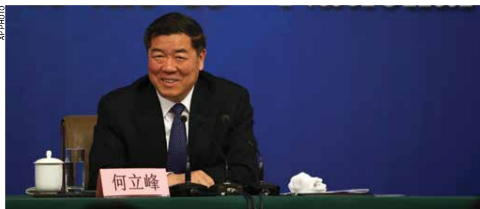
He Lifeng, chairman of the National Development and Reform Commission

"The government still set a growth target for 2018 despite the rhetoric about