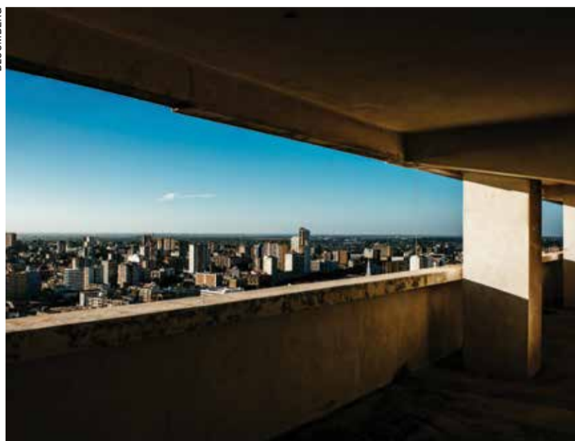
Residential and commercial buildings stand on the city skyline seen from the top of a skyscraper in Maputo

posal on the need to adapt it to United Nations (UN) conventions, as well as the 40 recommendations of the Financial Action Task Force (FATF), said