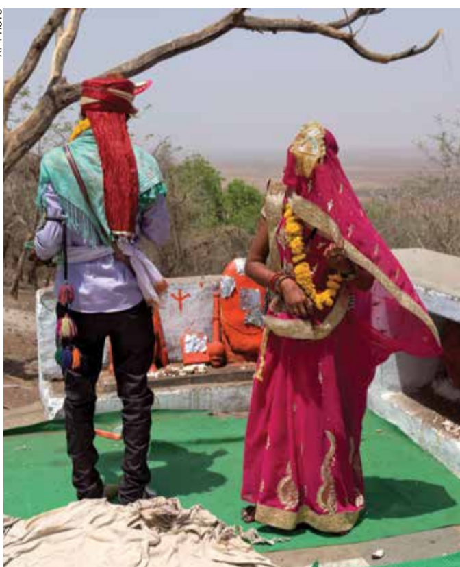
A child bride, who is only fourteen years old (right) performs rituals with the groom after getting married at a Hindu temple, in India

In India, the legal age for marriage is 18 for women and 21 for men. Parents responsible for underage marriages can be imprisoned and government programs aim to encourage girls to stay in school, but the prac-