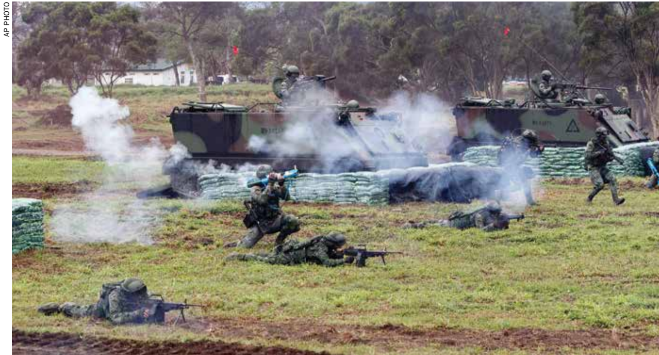
Taiwanese soldiers move during a military exercises to show its determination to defend itself from Chinese threats, in eastern Taiwan, in January