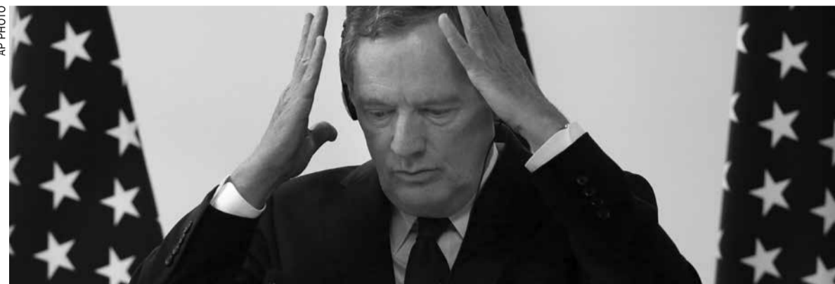
U.S. Trade Representative Robert Lighthizer adjusts his headset during a press conference regarding the seventh round of NAFTA renegotiations in Mexico City

Trump spoke shortly after a spokeswoman for Ryan, a Trump ally, said the GOP leader was "extremely worried" that the proposed tariffs would set off a trade war and urged the White House "to not advance with this plan."