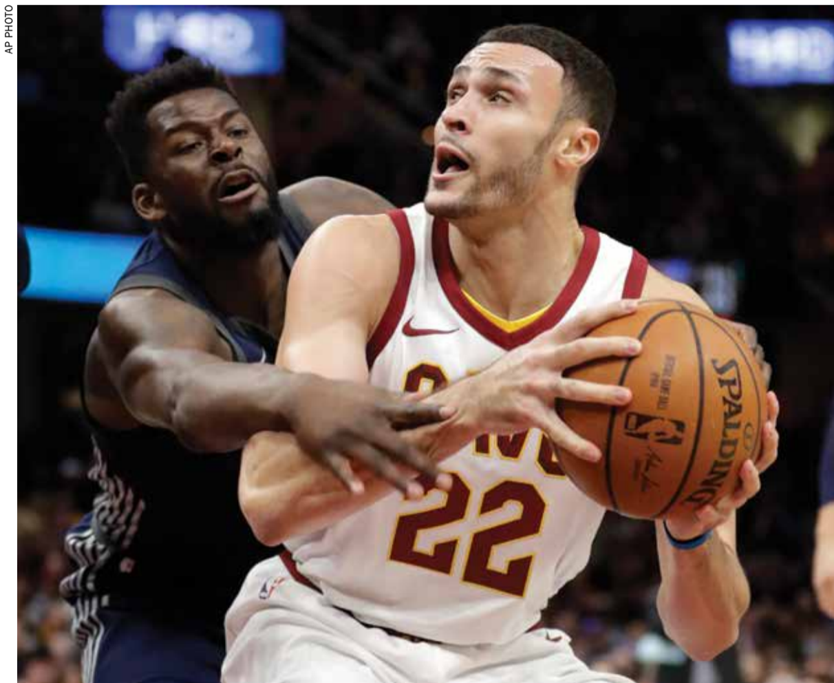
Cleveland Cavaliers' Larry Nance Jr. (22) drives against Detroit Pistons' James Ennis (33)

stick with Nance as a starter while Thompson recovers from a sprained right ankle that will keep him out at least two weeks. And beyond that, it's possible Lue could keep Nance in his first five.