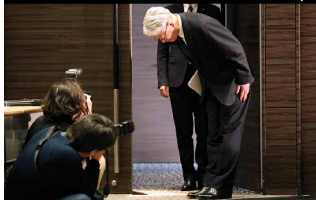
Kobe Steel President and CEO Hiroya Kawasaki bows during a press conference in Tokyo yesterday. Kawasaki is stepping down over a scandal involving massive falsification of inspections data of products (see page 8).