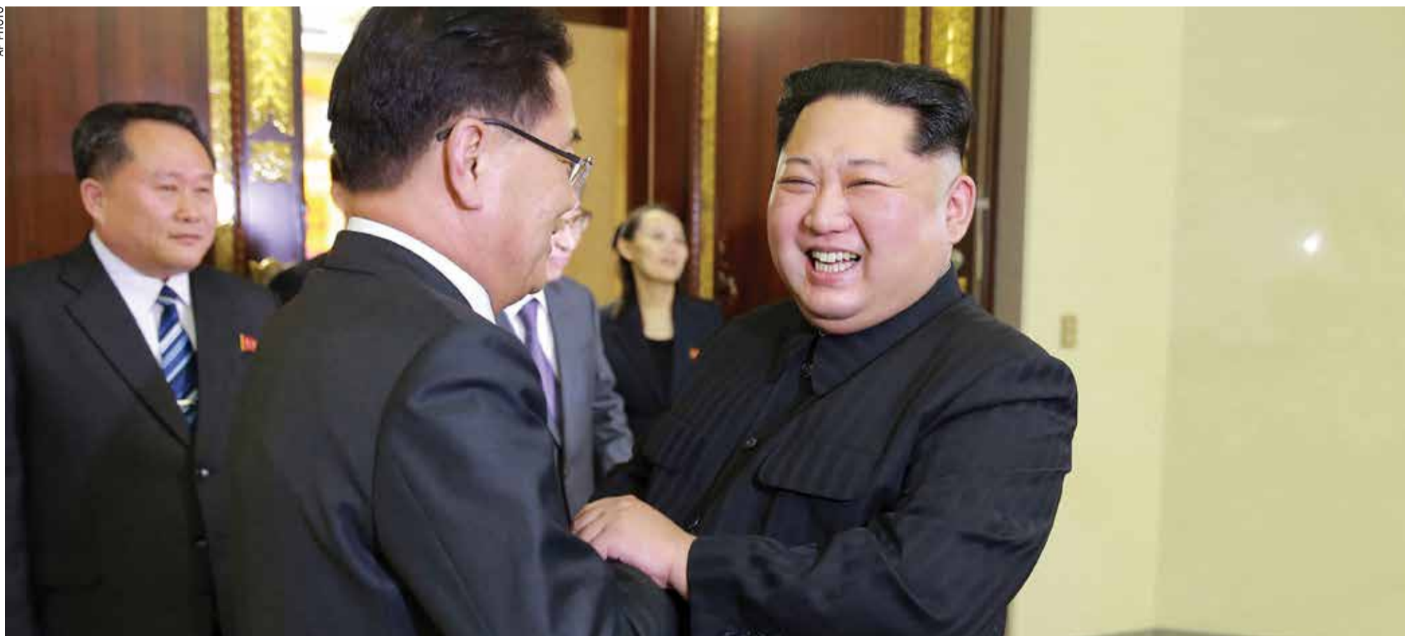
Kim Jong Un meets South Korean National Security Director Chung Eui-yong in Pyongyang.

North Korea also made it clear that it would not need to keep its nuclear weapons if military threats against it are removed and it receives a credible security guarantee, Chung said. AP