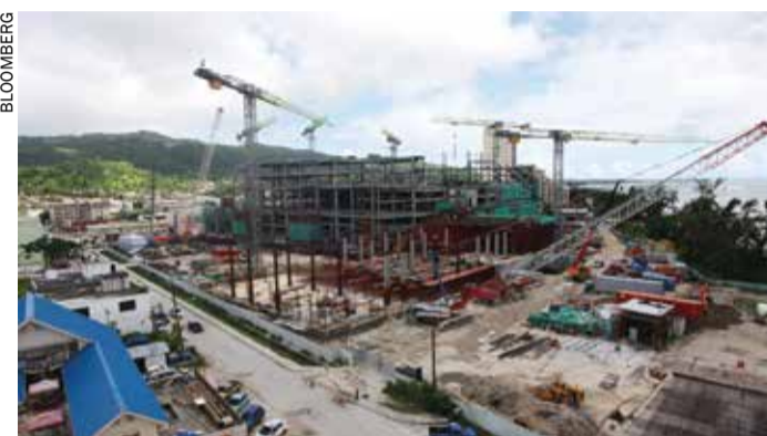
A casino being built in Saipan

are expanding abroad, and in regions like the U.S. and Europe, hiring labor there can be expensive," Li said. "Firms will prefer bringing Chinese workers." But oftentimes, the workers are lured with false promises such as high wages and even help in obtaining a green card -- none of which materializes once they arrive. Higher fines and penalties levied by U.S. authorities will help combat these practices, Li said.