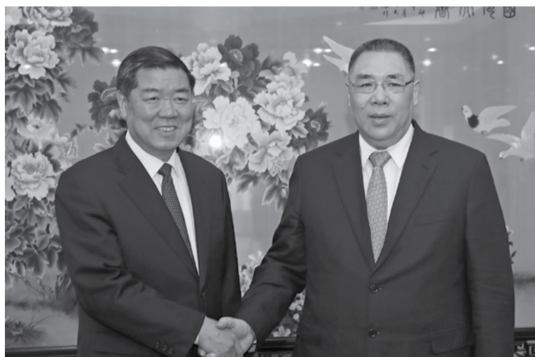
He Lifeng (left) and Chui Sai On

"The Macau SAR government will continue to ensure diverse economic development and keep improving the well-being of Macau residents. This is the principle of development for us," he said, as cited by public broadcaster TDM. "We hope you will give us guidance and support for both our short-term and long-term goals."