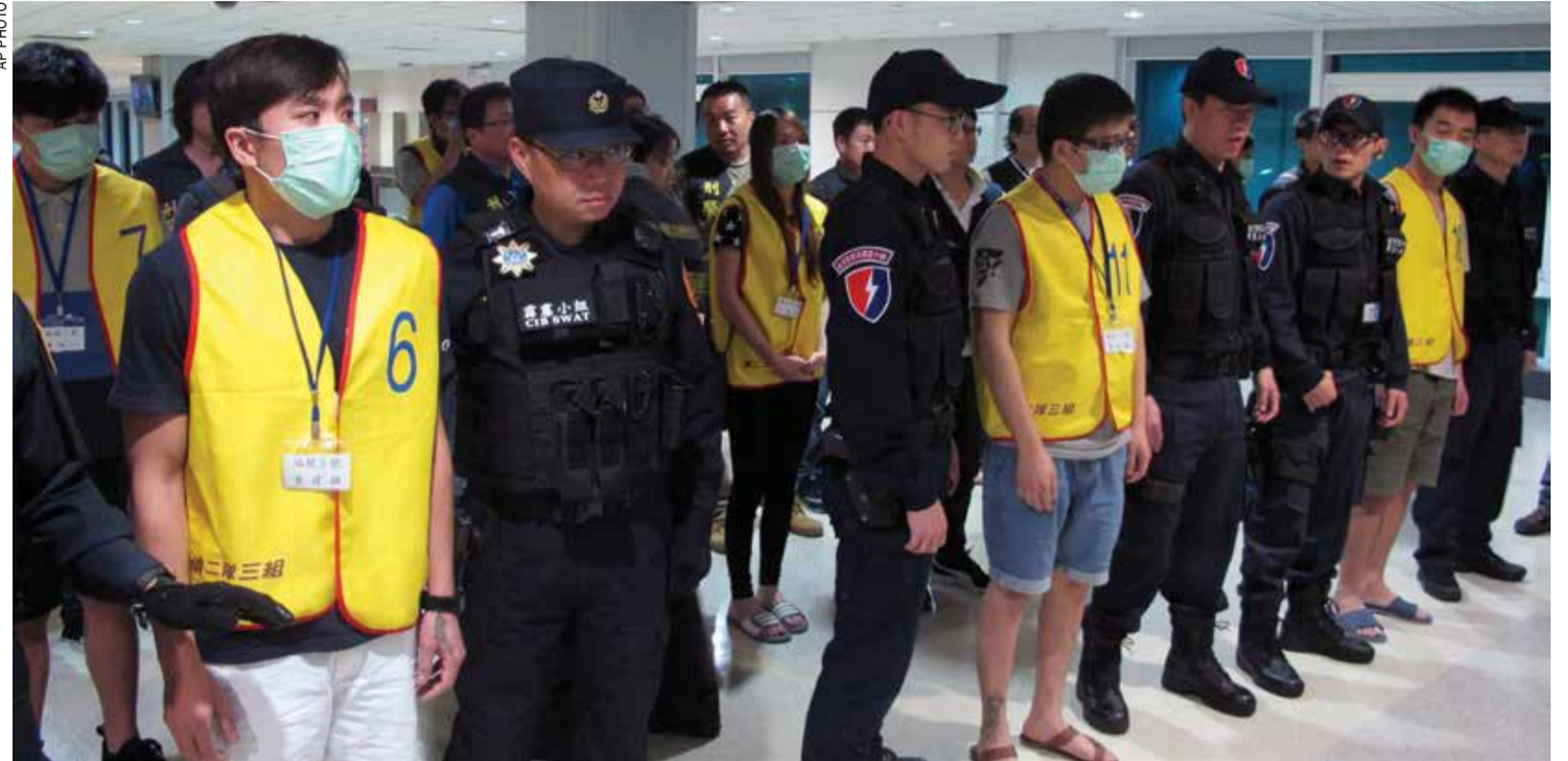
Taiwan CIB SWAT team members stand with 18 suspects arrested upon arrival at Taoyuan International Airport in Taoyuan, Taiwan, last year