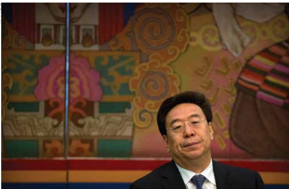
Wu Yingjie, Communist Party secretary of the Tibetan Autonomous Region