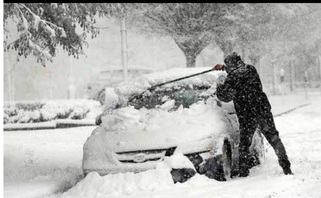
Snow cold. A man clears snow off of his car on State Street in Danbury, Connecticut during a snowstorm yesterday.