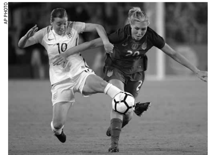
England forward Fran Kirby (10) and United States midfielder Allie Long (20) battle for the ball

England won its opener over France 4-1 before playing to a 2-2 draw with Germany. U.S. England is coached by former Man-