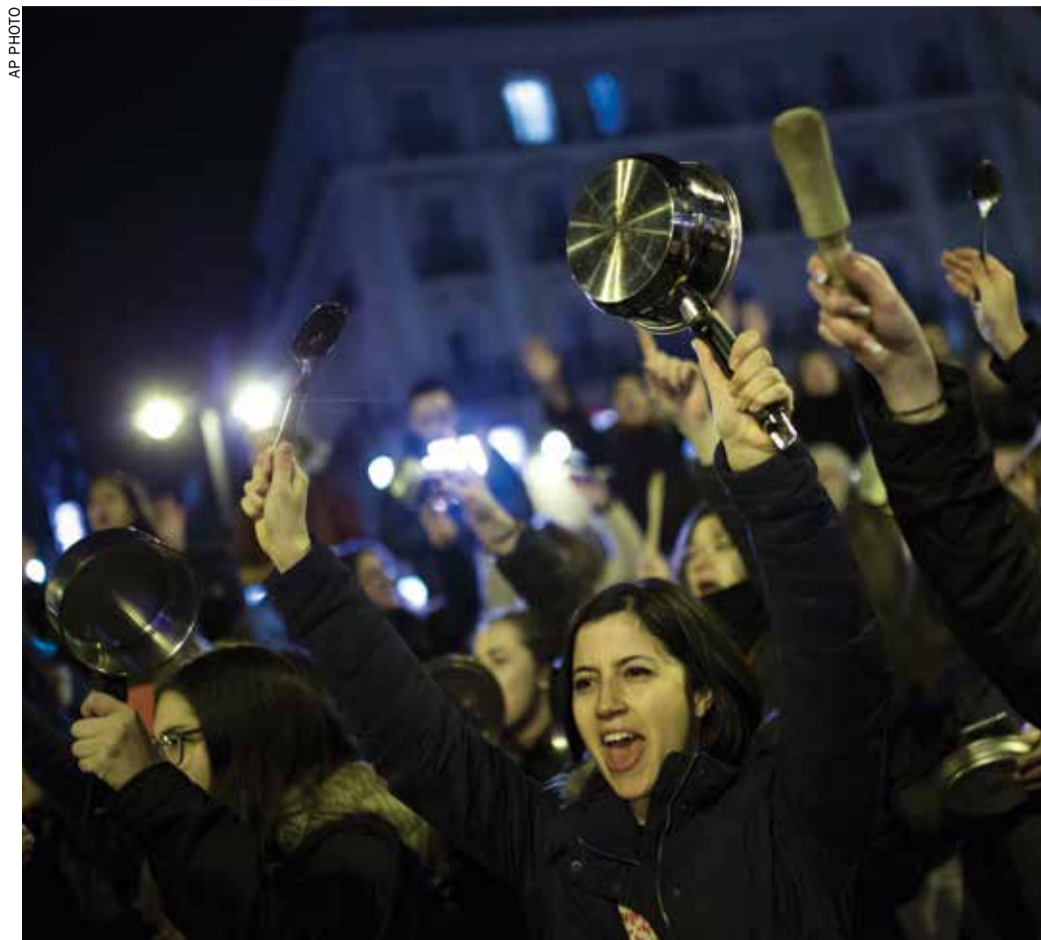
Women bang pots and pans as shooting slogans during a protest marking the beginning of a 24-hour women strike at the Sol square in Madrid