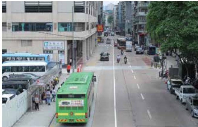
Inner Harbor area