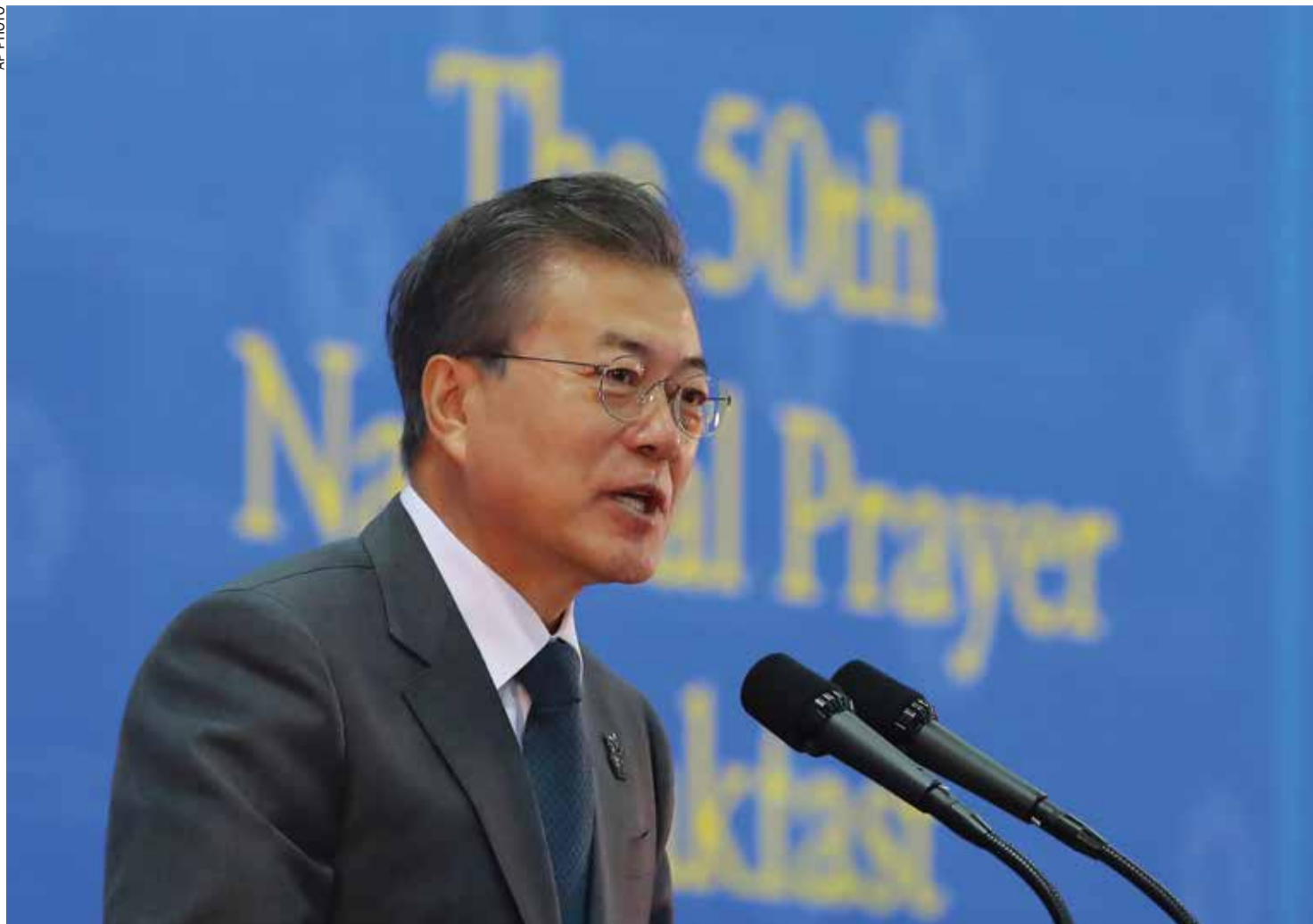
South Korean President Moon Jae-in