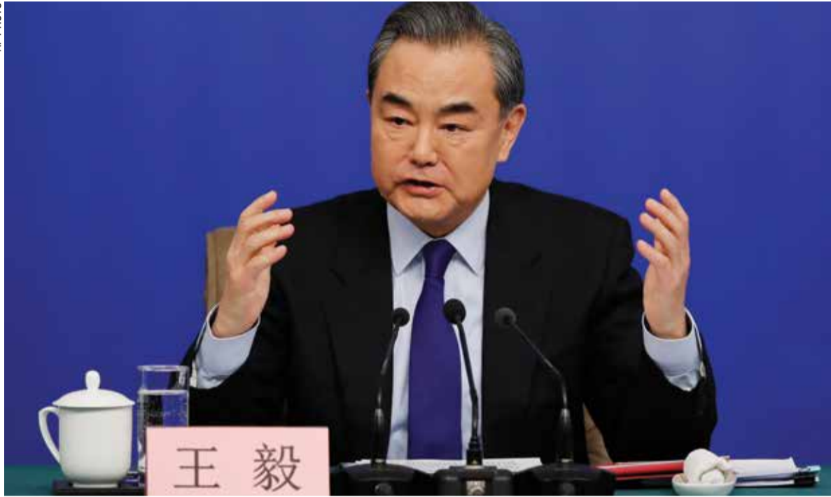
Chinese Foreign Minister Wang Yi

“China and the United States can compete without necessarily being opponents, they should more be partners,” he added, while warning that a possible trade war mulled by President Donald Trump would hurt the U.S.