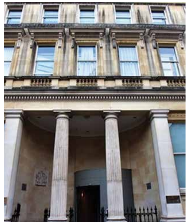
Bristol Crown Court where Lambe's trial took place