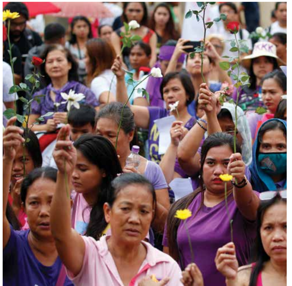
Protesters raise flowers during a rally to mark International Women's Day yesterday in Manila