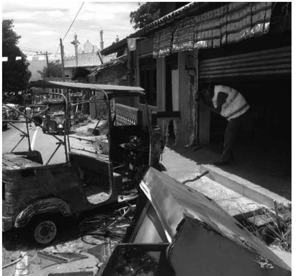
A Sri Lankan police officer investigates a burnt shop in Digana on the outskirts of Kandy, Sri Lanka