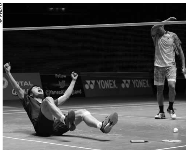
China's Shi Yuqi reacts after defeating fellow countryman Lin Dan (right)

SEVENTH -seeded Shi Yuqi beat six-time champion Lin Dan 21-19, 16-21, 21-9 in a major upset at the All England Championships to win the men's singles title.