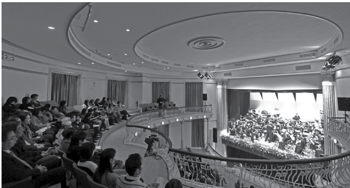
Dom Pedro V Theatre