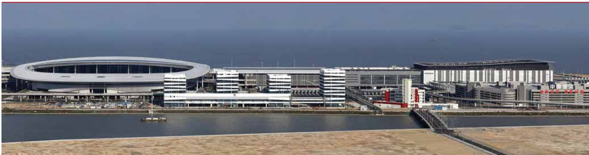
The Macau border zone of the world's longest sea bridge connecting Hong Kong, Zhuhai and Macau was officially handed over to MSAR authorities last week.