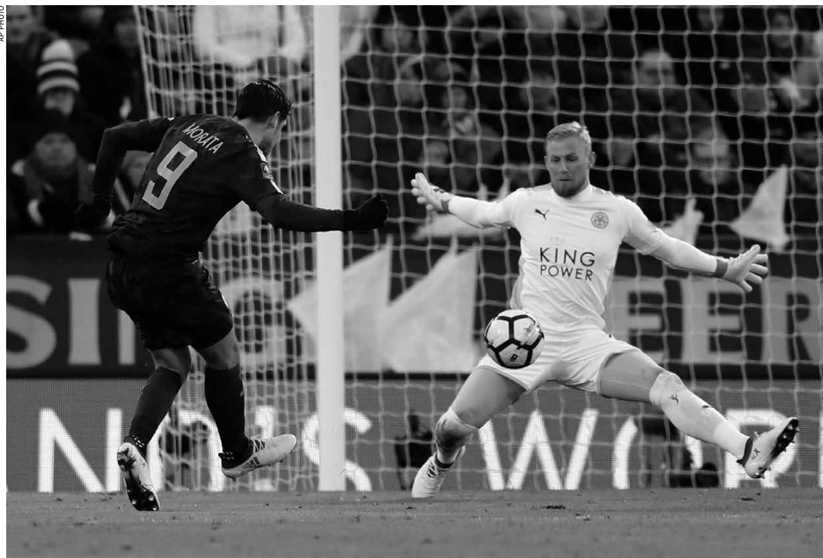
Chelsea's Alvaro Morata scores his side's opening goal during the English FA Cup quarterfinal soccer match between Leicester City and Chelsea

Caballero, playing in place of the injured Thibaut Courtois, saved another effort from Vardy with minutes remaining, before Schmeichel denied Morata at the other end to send the game to extra time.