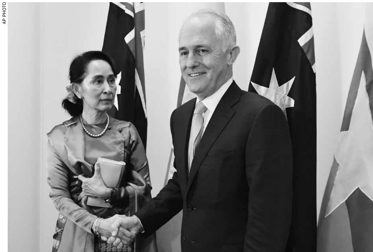
Myanmar's leader Aung San Suu Kyi (left) is welcomed to Parliament House by Australian PM Malcolm Turnbull during her state visit in Canberra

Malaysian Prime Minister Najib Razak told the summit that the refugee crisis was no longer solely a domestic is-