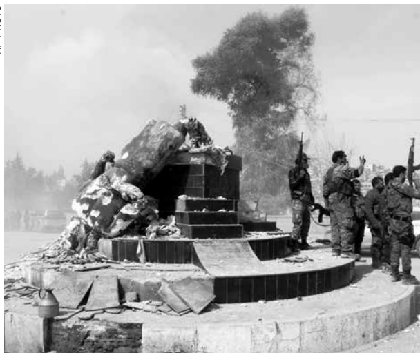
Turkey-backed Free Syrian Army soldiers celebrate around a statue of Kawa, a mythology figure in Kurdish culture, after they have destroyed it in Afrin, northwestern Syria