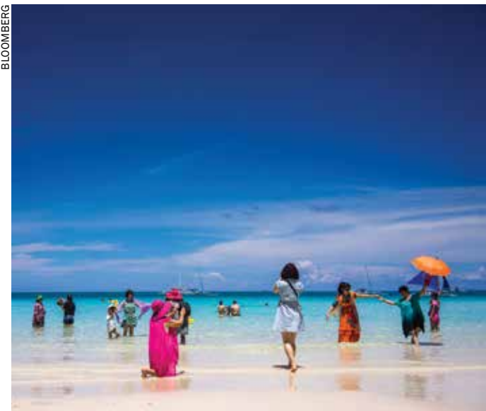
Tourists pose for photographs in the sea at White Beach in Boracay

"We will contribute positively to the local economy and actively partner with the Boracay community. We are confident that we will raise the bar in both resort quality and service and generate significant job opportunities in both construction and resort