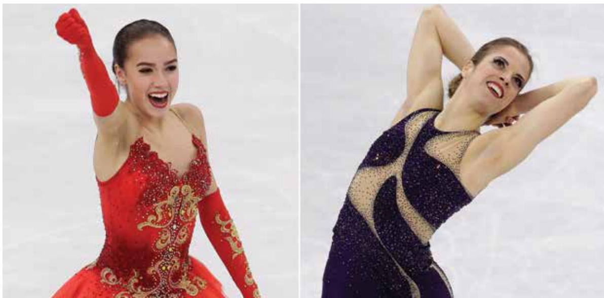
Alina Zagitova and Carolina Kostner

whose elegant artistry and presentation often make up the difference.