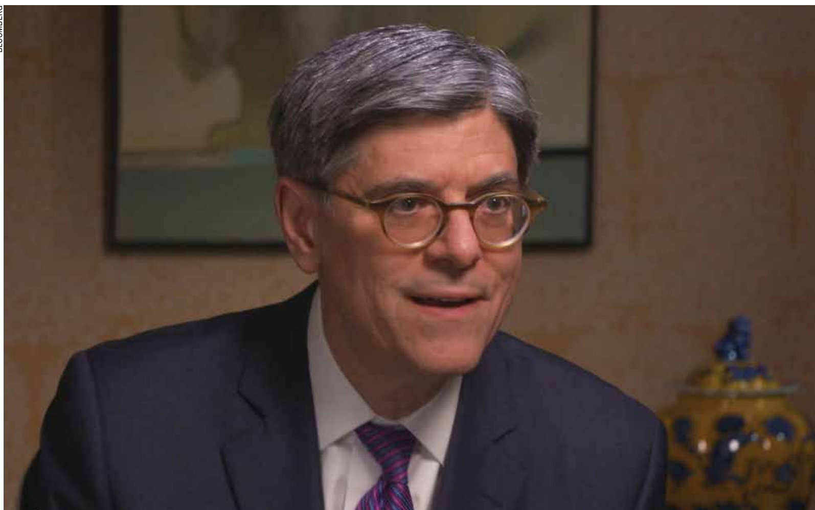
Former U.S. Treasury Secretary Jacob J. Lew