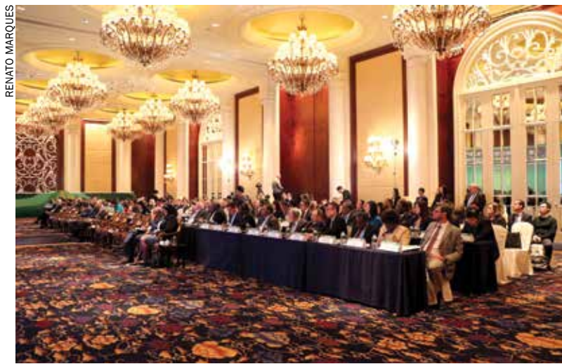
Aspect of the seminar held yesterday