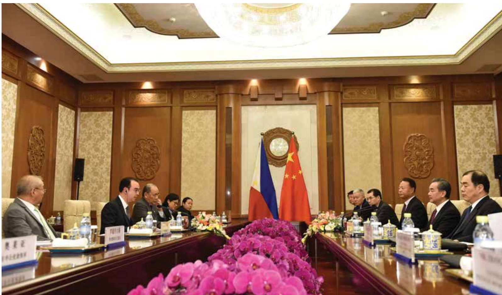
Philippine Foreign Affairs Secretary Alan Peter Cayetano (second from left) talks with Chinese Foreign Minister Wang Yi (second from right) during their meeting in Beijing

find a legal framework acceptable to both that would allow joint exploration even as they continued to disagree.