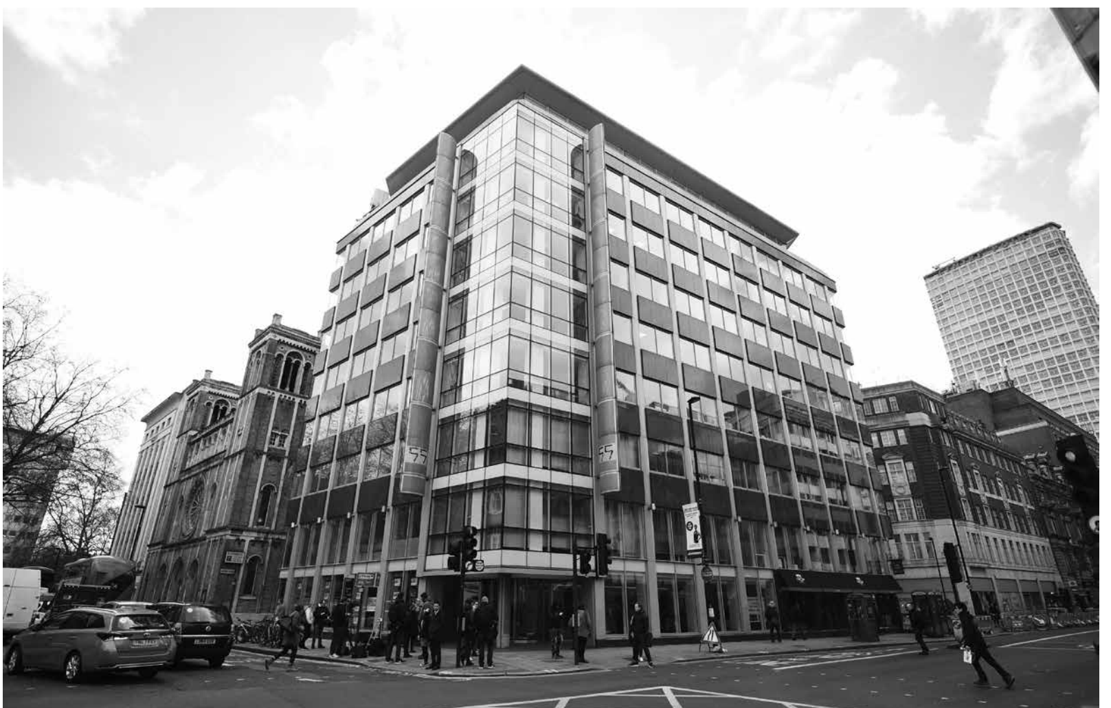
The offices of Cambridge Analytica (CA) in central London

cials "have been misleading to the committee."