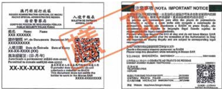
New version of the arrival card

T HE Public Security Police Force (PSP) has been working on the optimization and replacement of the Arrival Card for non-residents. It is expected to be completed by March 31. The Immigration Department of the PSP has been implementing the "Non-stamping Immigration Clearance Policy" since July 2013, issuing a printed Arrival Card to inbound visitors. Starting from January 1, 2014, the scheme was extended to cover persons granted any of the six types of Authorization to Stay. They receive a printed Slip of Authorization to Stay instead of a stamp in their travel document. According to a statement issued yesterday by PSP, "the purpose for this op-