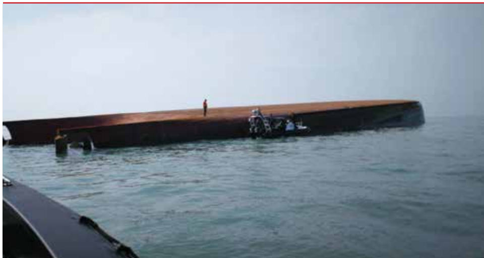
A Chinese sand-dredger capsized off Malaysia's southern coast yesterday, killing a crew member and leaving 14 others missing, Malaysia's coast guard said. Three Chinese citizens out of 18 crew members were rescued but one was found dead after the JBB Rong Chang 8 capsized off southern Johor state, the Malaysian Maritime Enforcement Agency said in a statement.