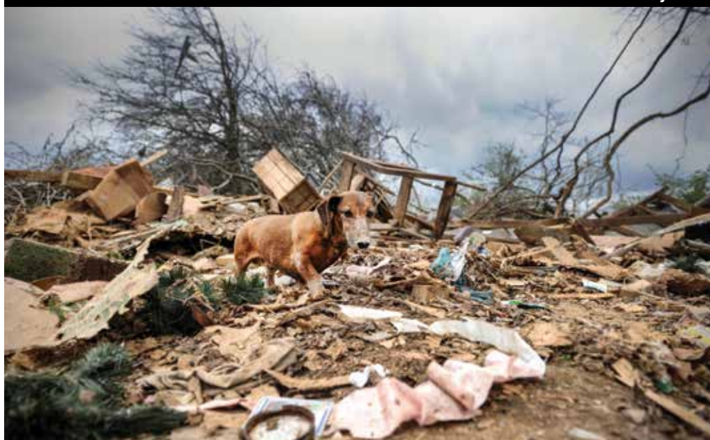
Rusty the dog walks among debris in northern Limestone County, near Ardmore, Ala., after a violent storm went swept through the area the night before.