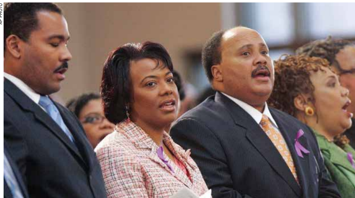
From left: Dexter Scott King, the Rev. Bernice King and Martin Luther King III

minder that at the center of this tragedy was a young family, robbed of a loving husband and father, who was just 39. All are older now than King was. The tributes to their dad — from the buildings and streets that bear his name, to statues in his home state and in the nation's capital — are points of pride, but also constant reminders of the void he left.