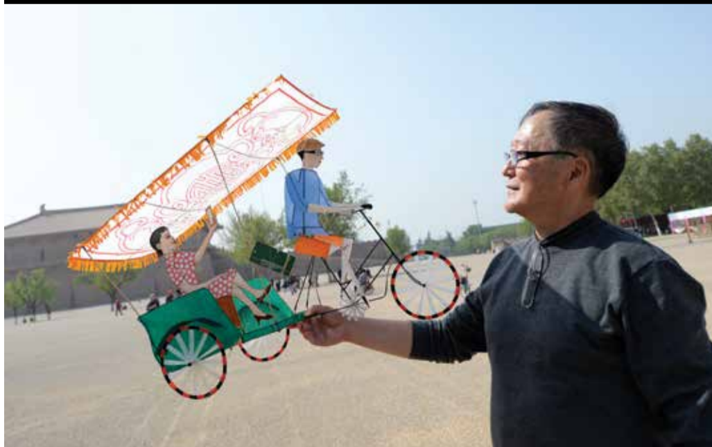
A man displays a kite he made at Daming Palace National Heritage Park in Xi'an, capital of northwest China's Shaanxi Province. A kite festival started yesterday in Xi'an.