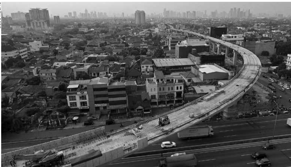
An elevated track for the Jakarta Mass Rapid Transit stands under construction as vehicles travel along a highway

She said that as of now 90 percent of infrastructure and projects to facilitate the Asiad in Jakarta and Palembang have been completed. "Later on they will all be settled, 100 days before the event," the minister said in her visit in