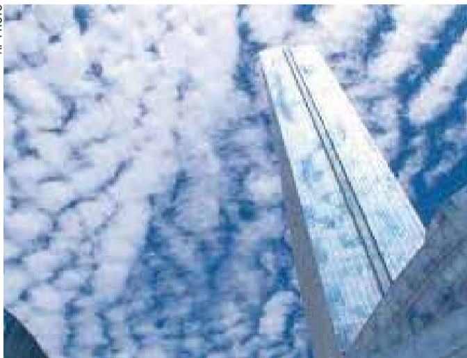
The exterior of the former Revel casino resort in Atlantic City

It also will include the 32,000-square-foot location of exhale, Hyatt's newly acquired fitness and spa brand, which will feature 32 treatment rooms, a mind and body studio, and a retail boutique. Ocean Resort will be part of Hyatt's "Unbound Collection" of hotel properties.