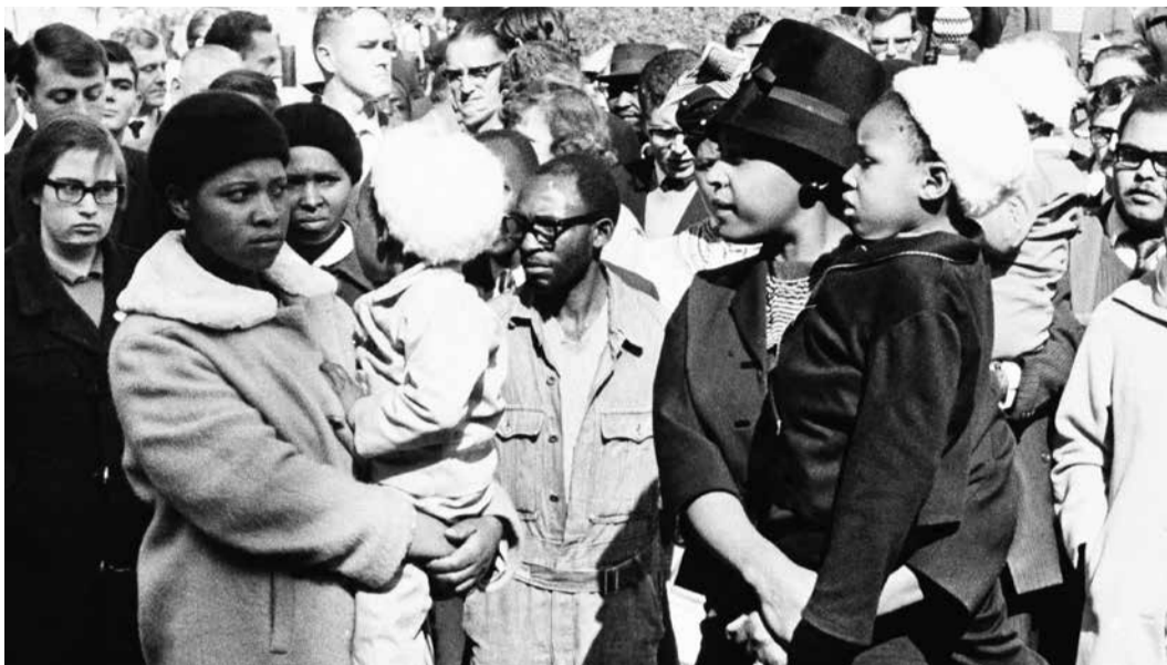
In this June 12, 1964, file photo, Winnie Mandela (right) waits for a glimpse of Nelson Mandela outside the Palace of Justice in Pretoria