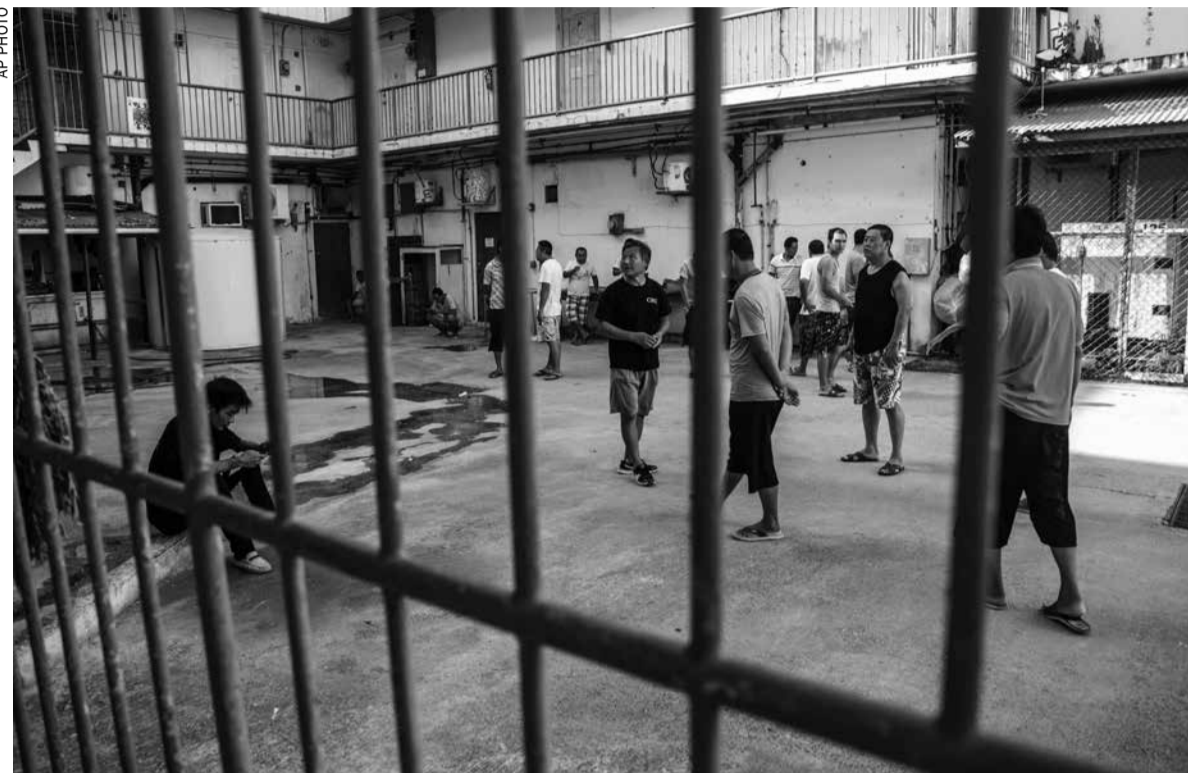
In this July 26, 2017 photo, Chinese laborers at the Imperial Pacific Casino gather in front of their living quarters before a protest in Saipan