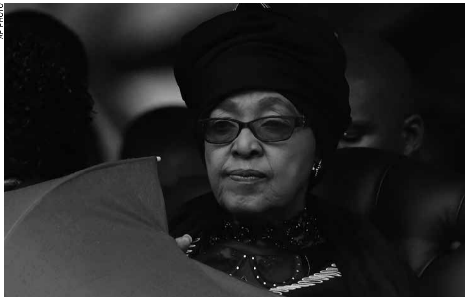
Winnie Mandela listens to speeches during the memorial service for her ex-husband, former South African president Nelson Mandela