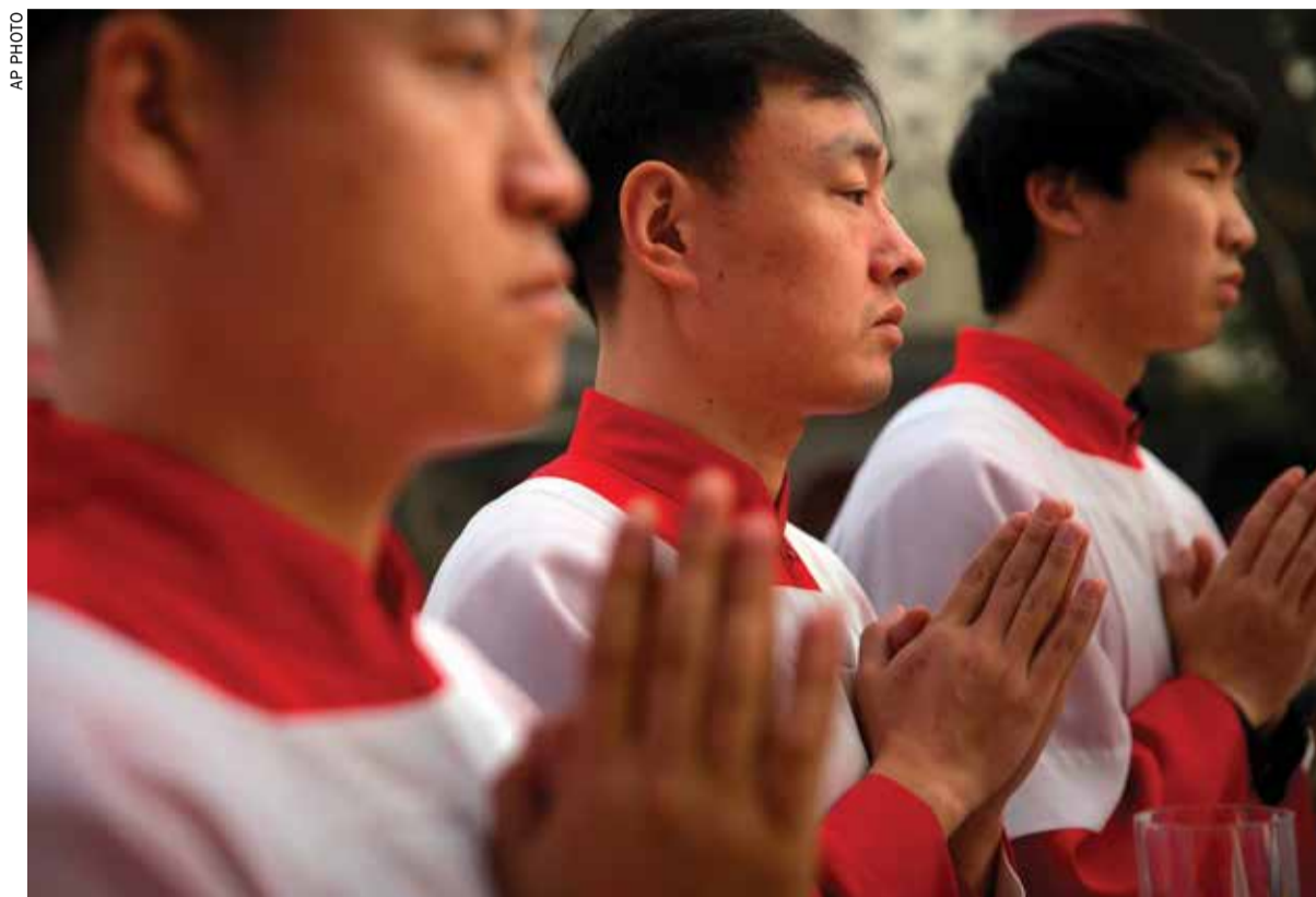
Acolytes pray during a Holy Saturday Mass on the evening before Easter at the Cathedral of the Immaculate Conception, a government-sanctioned Catholic church in Beijing

"Actively guiding religions in adapting to the socialist society means guiding religious believers to [...] be subordinate to and serve the overall interests of the nation and the Chinese people," said a white paper released