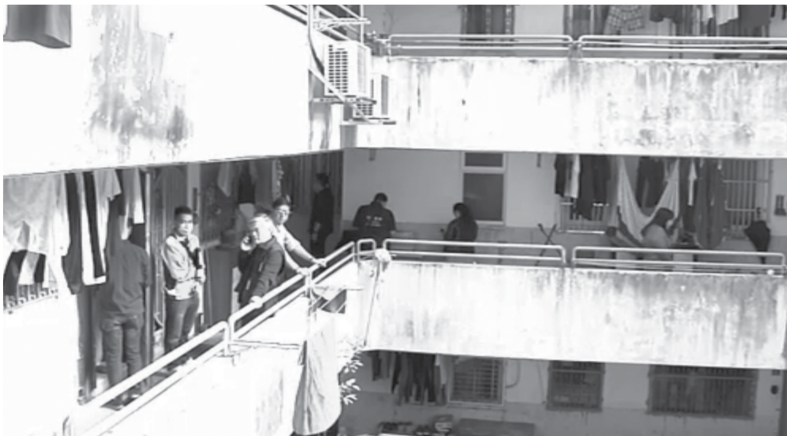
The place where the crime occurred

Wynn Macau announced the enhancement of its maternity and paternity benefits for all eligible employees yesterday. According to a statement from the company, the duration of paid maternity leave will be increased from 56 days (eight weeks) to 70 days (10 weeks). Meanwhile, paid paternity leave will be extended from two days to seven days. Both extensions take effect from May 1, and apply to employees who have completed one year of continuous service as of the date of confinement. The company notes that paternity leave can be taken on or within 30 days after the birth of the child.