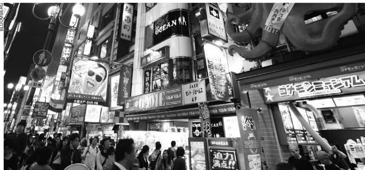
People walk through the Dotonbori district at night in Osaka, one of the locations expected to house a casino

They have also agreed on a flat 30 percent tax rate for gross gaming revenue, as opposed to earlier calls from Komeito for a