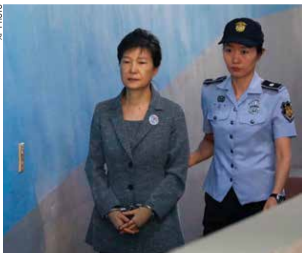
Former South Korean President Park Geun-hye (left)