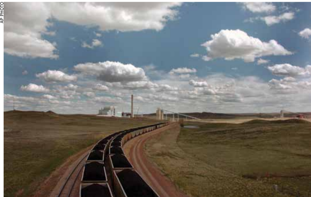
A pair of coal trains idle on the tracks near Dry Fork Station, a coal-fired power plant being built by the Basin Electric Power Cooperative near Gillette, Wyoming