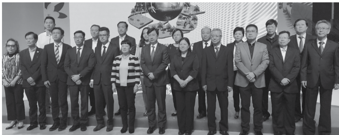
The event organizers pose for a picture

nel session on "Green Finance Innovation to Achieve Sustainable Development" featuring speakers who are experts on "green finance."