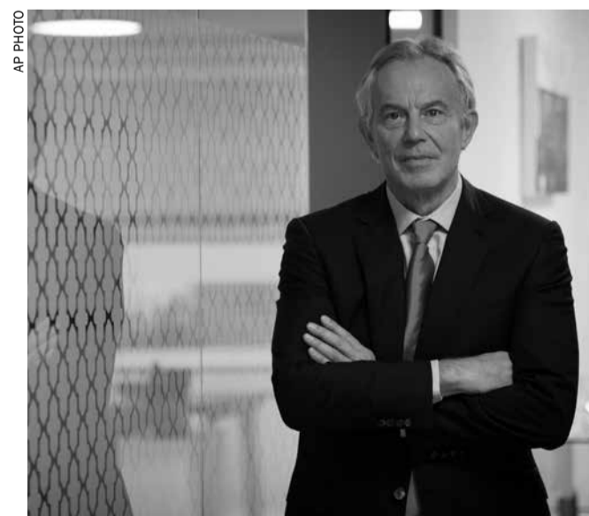
Former British Prime Minister Tony Blair

He said that over the last 20 years the border had become "of no great prac-