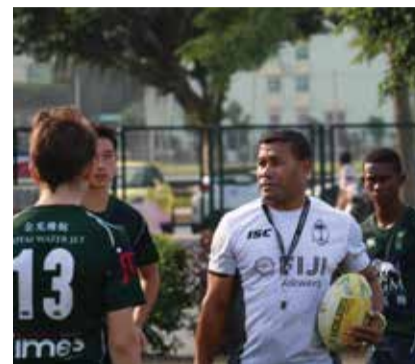
Fijian rugby player Waisale Serevi gave a class in Macau

Food and beverages will be available from stalls on site.