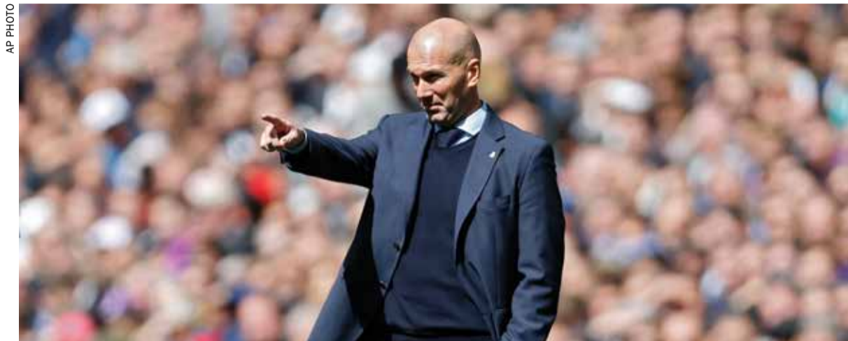
Madrid's coach Zinedine Zidane

Madrid captain Sergio Ramos is suspended and his immediate substitute, Nacho Fernandez, is out injured. Raphael Varane just returned from injury, and the other central defender in the