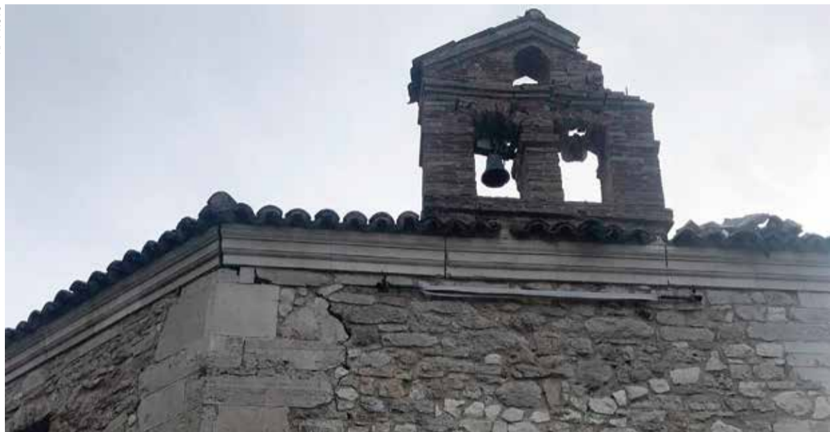
A view of a damaged bell tower of the 17th century Santa Maria di Varano' church after an earthquake, in Muccia, central Italy