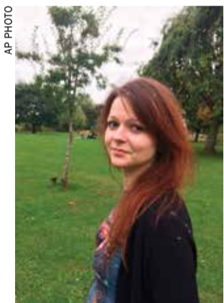
This is a file image of Yulia Skripal taken from her Facebook

The two were poisoned March 4 in an attack that has led to a prolonged confrontation between Russia and Britain that