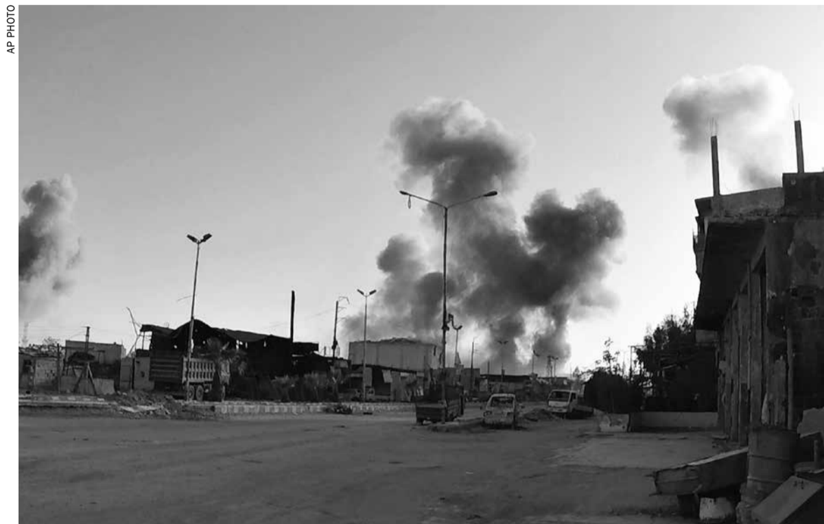
Douma, in eastern Ghouta region east of Damascus, Syria

Ali Akbar Velayati, an aide to Iran's supreme leader, issued his stark warning upon arrival in the Syrian capital yesterday. He was quoted by the country's state-run