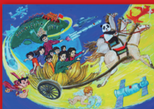
Inter School First Class

Hou Kong Middle School (Primary Division)