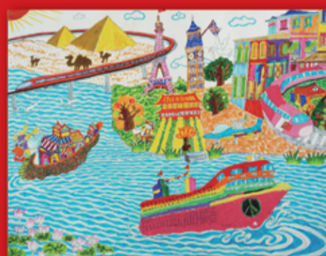
Junior Individual Champion