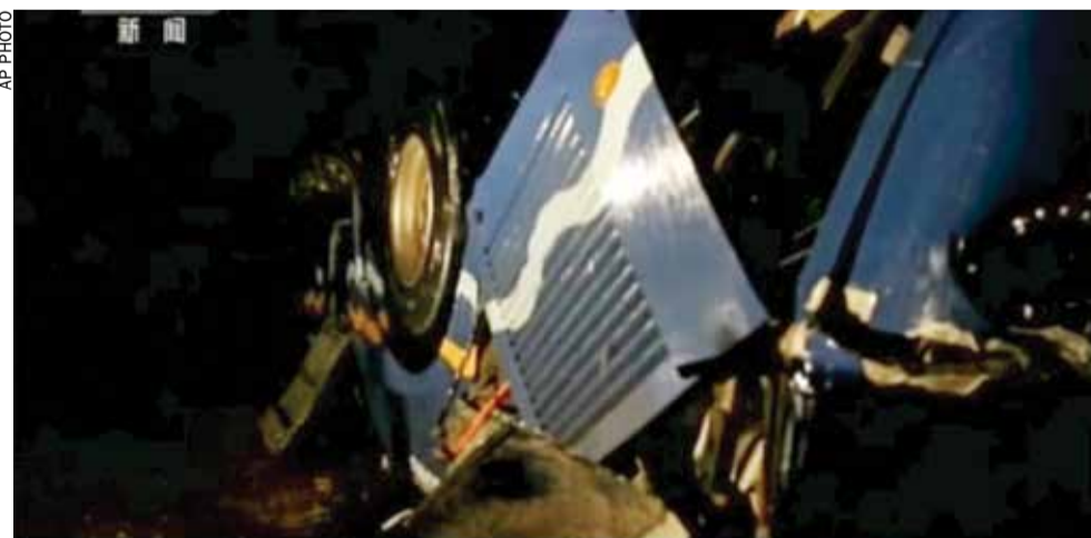
In this image taken from video footage, a bus which carries Chinese and North Koreans is seen overturn after an accident in North Hwanghae province

Only about 5,000 Westerners visit the isolated, hard-line communist state each year. Americans have been banned from traveling to North Korea without special permission from the U.S.