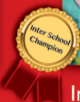
Inter School Champion

Ling Nan Middle School (Primary Division)