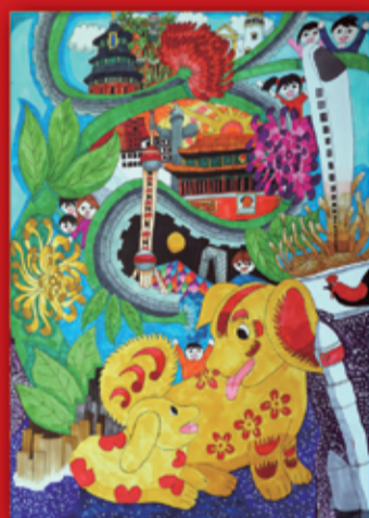
Senior Individual Champion

Hou Kong Middle School (Primary Division)