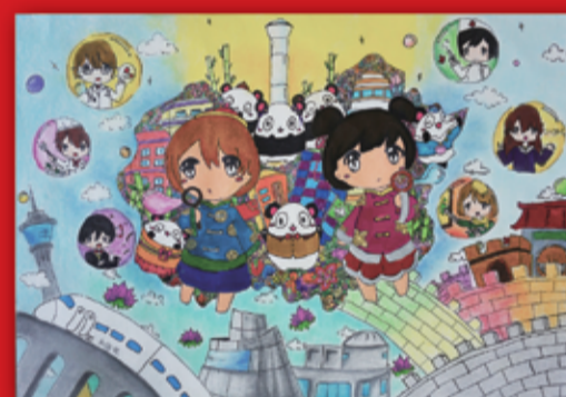
Inter School First Class

Ling Nan Middle School (Primary Division)