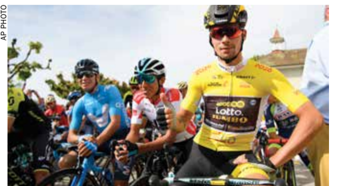
The overall leader Primoz Roglic from Slovenia of team Lotto NL-Jumbo poses with the yellow jersey

Richie Porte of Australia stayed third, trailing Roglic by 35 seconds.