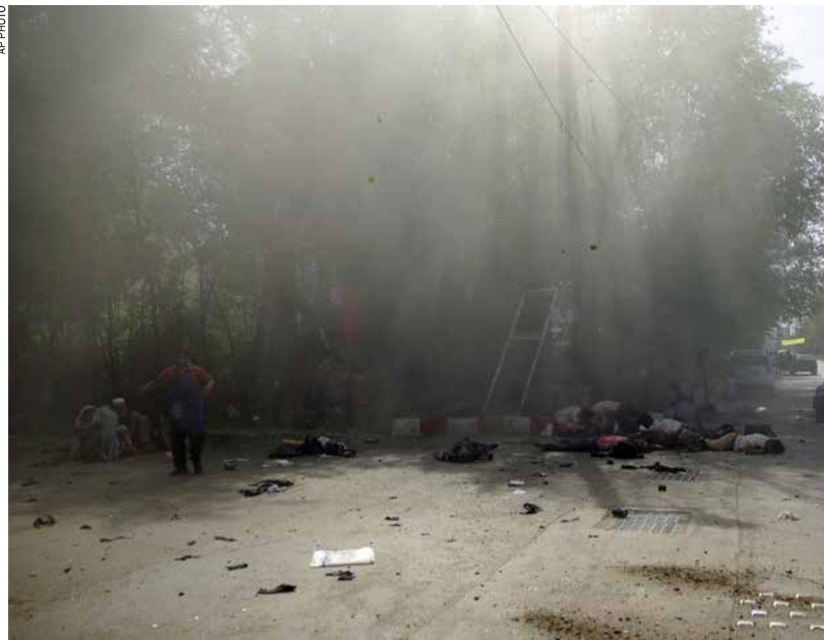
Victims in double explosions lie on the ground in Kabul