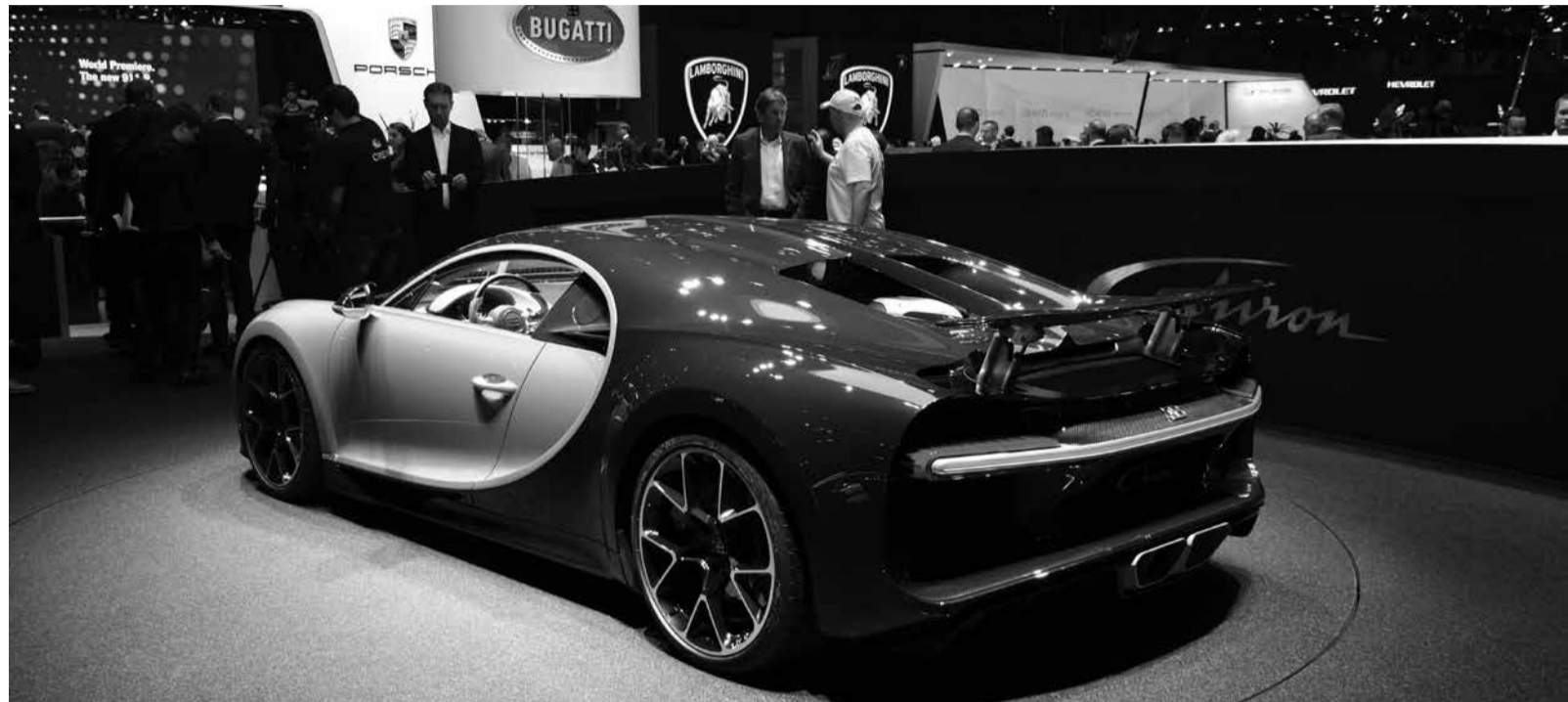
A Bugatti Chiron at the Geneva Motor Show

He decided to follow up on the case by seeking for the sales manager at his company.