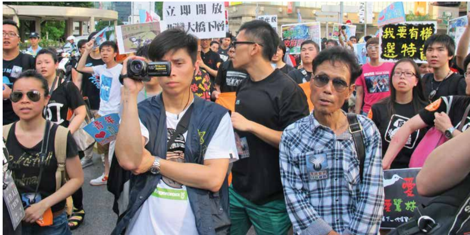
A scene from last year's Labor Day demonstrations

"[Groups which organize demonstrations] have been suppressed one by one, but there are still many of them. [...] The situation concerning the young generation has also deteriorated, [because] they were disappoint-