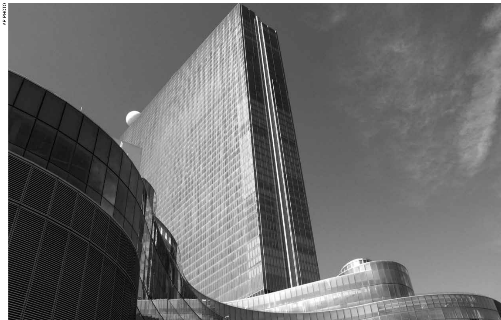
The exterior of the Ocean Resort Casino in Atlantic City

Some Revel patrons said they felt unwelcome there, from not being able to smoke, to a general feeling that higher-end guests were more valued. It took Revel management 14 months (and