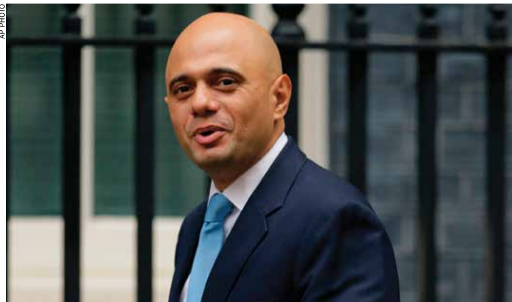
Government Cabinet Minister Sajid Javid arrives for a meeting at 10 Downing Street