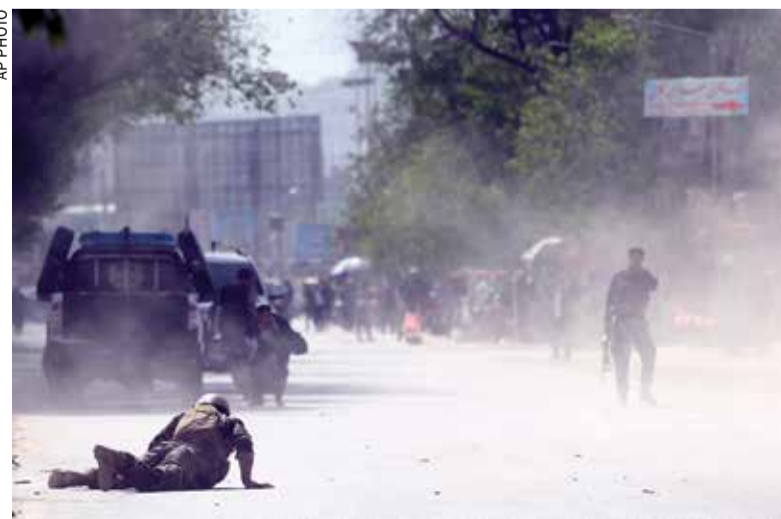
Security forces run from the site of a suicide attack after the second bombing

And the month before, an IS suicide bomber targeted a Shiite shrine in Kabul where people had gathered celebrating the Persian new year. That attack killed 31 people and wounded 65 others. AP