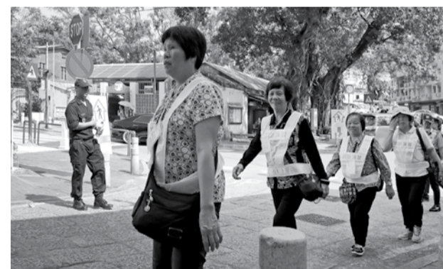
Residents leave their Coloane neighborhood and head toward a typhoon shelter during the weekend drill