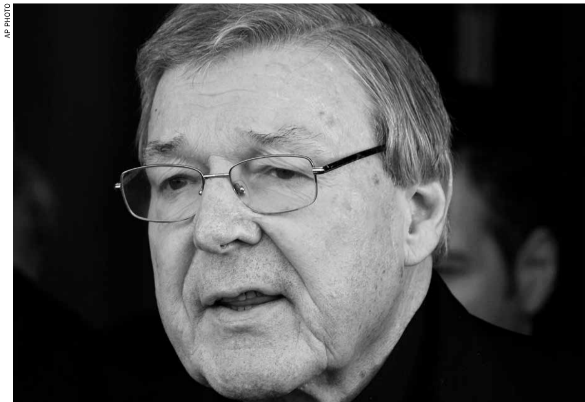
Cardinal George Pell