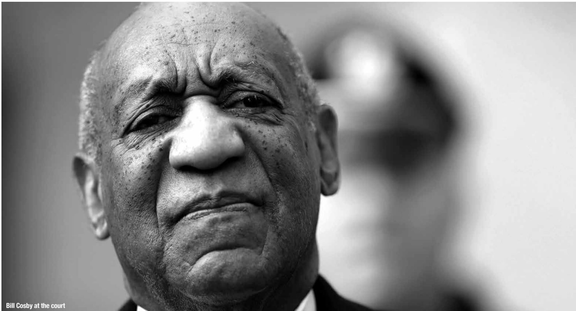
Bill Cosby at the court