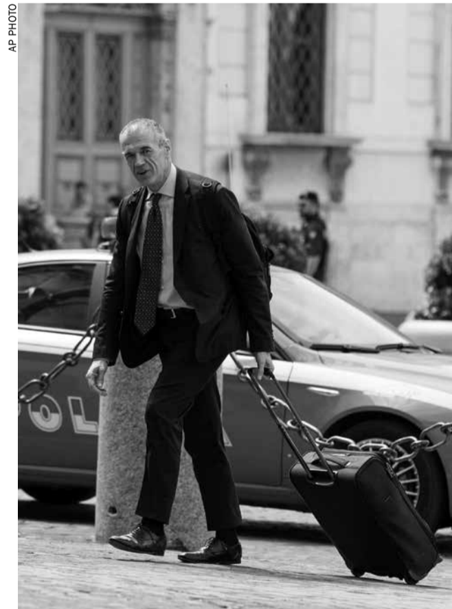
Economist Carlo Cottarelli

He rejected that argument saying Italy isn't structurally weaker than Germany, but that the message needed to be underlined that "if we want to share currency, we need to behave in a different way." He noted that Italy's inflation level is currently below Germany's, making Italy more competitive industrially.