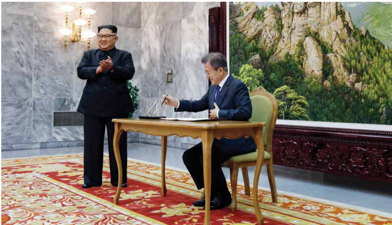
President Moon Jae-in writes on a visitor's book as Kim Jong Un stands at the northern side of Panmunjom in North Korea