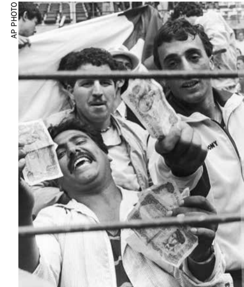
Algerian soccer fans show money to photographers, in Gijon, Spain, after the World Cup soccer match between West Germany and Austria

Most of the senior Springboks, including Kolisi, will stay at home to prepare for England.