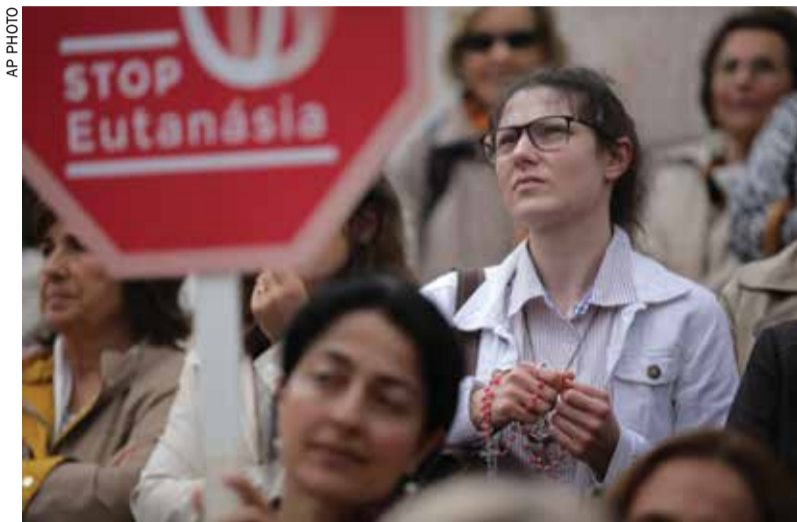
People stand on the steps of the Portuguese parliament in Lisbon during a protest against euthanasia

die activists pushed the contentious and divisive issue of euthanasia onto the political agenda. It got more than 8,000 signatures — more than double the amount needed to force a parliamentary debate last year.