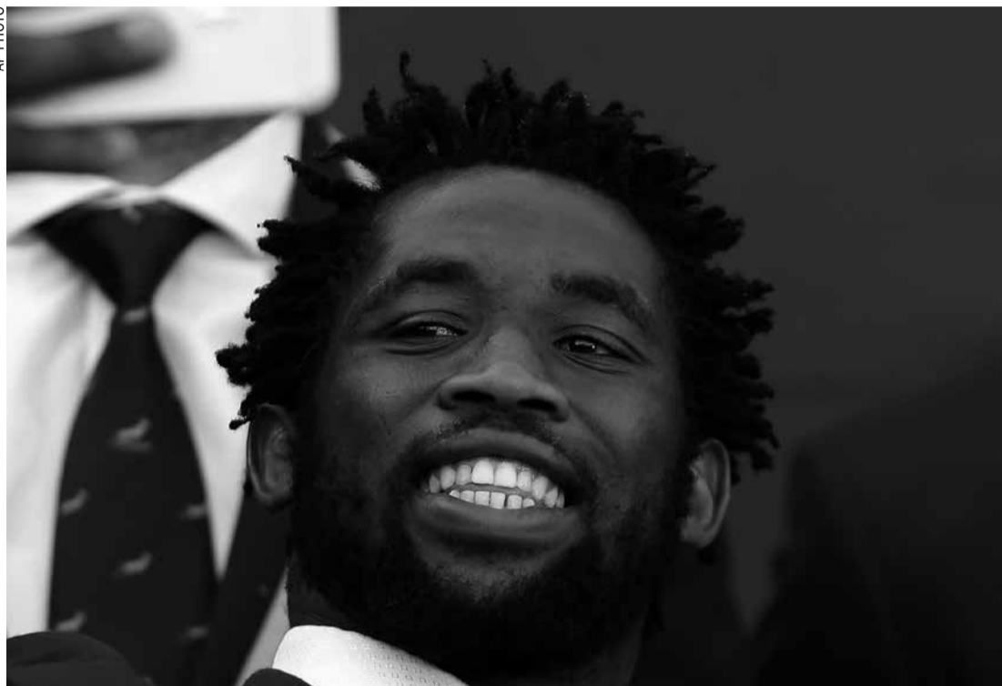
South Africa's Siya Kolisi takes a selfie with teammates

During apartheid, only whites were allowed to play for the Springboks, the team viewed as an extension of