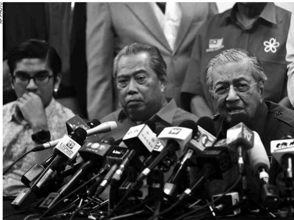
PM Mahathir Mohamad (right) speaks during a press conference in Petaling Jaya yesterday

Mahathir has reopened an investigation into 1MDB that was suppressed during Najib's rule. Najib, who denies any wrongdoing, and his wife have been barred from leaving the country. AP