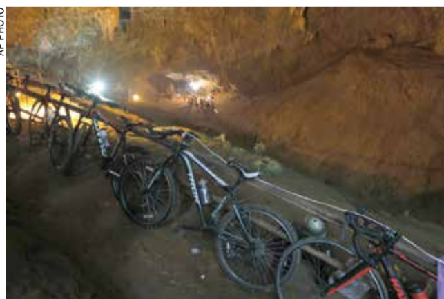
Bicycles left by a group of missing boys lean against a railing at the entrance of a deep cave in Chiang Rai

Footage on Thai television showed bicycles, backpacks and soccer cleats left outside the entrance to the cave. The area was filled with soldiers and res-