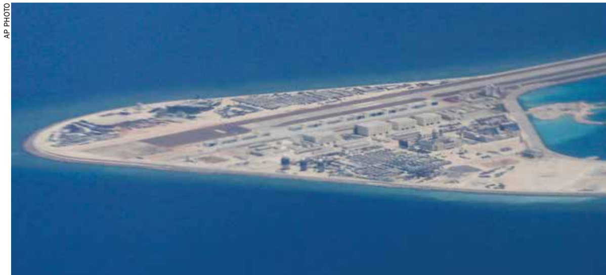
Chinese structures and an airstrip on the man-made Subi Reef at the Spratly group of islands are seen from a Philippine Air Force C-130

while Mattis will willingly lay out America's position on China's military buildup in the South China Sea and other points of contention, the Pentagon chief doesn't want to open the conversations with "the irritants." Instead, the goal is to have higher quality talks about the two countries' military relationship, said the official, who spoke on condition of anonymity to discuss internal deliberations on the trip.