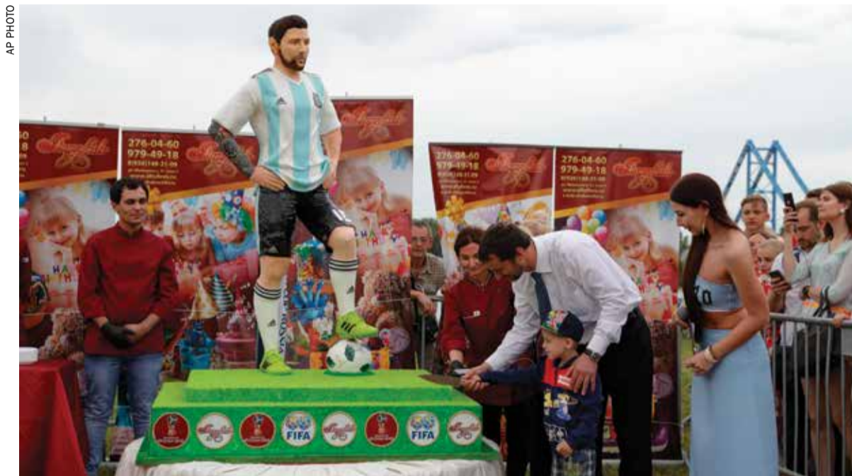
The mayor of Bronnitsy helps a boy cut a cake to mark Lionel Messi's birthday near Argentina's training camp base

paoli would be dismissed and wouldn't take charge against Nigeria on Wednesday [2 a.m. Macau time] in St. Petersburg for the team's last Group D match.