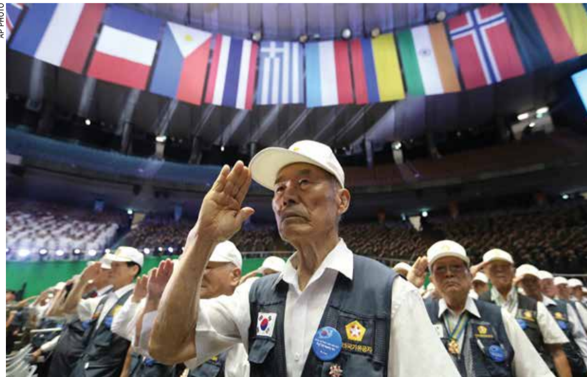
War veterans salute during yesterday's ceremony to mark the 68th anniversary of the outbreak of the Korean War in Seoul

Many experts have called the North Korean artillery threats "significant" because it can