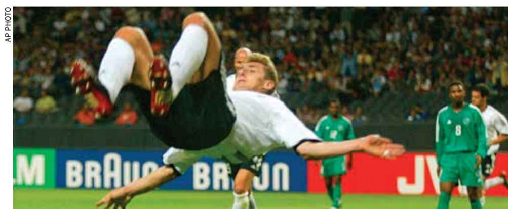
Miroslav Klose performs a somersault after scoring his second goal during the 2002 World Cup match between Germany and Saudi Arabia

The Hungary team of 1954 is one of the most-revered in World Cup history, and it had arguably the best player in the world in Fer-