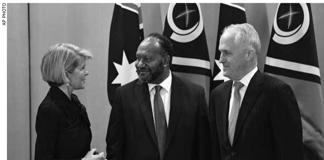
Charlott Salwai Tabimasmas (center) meets with Malcolm Turnbull and Julie Bishop

Abe still faces a potential challenge by former Defense Minister Shigeru Ishiba, 61, in the September LDP election. While Ishiba hasn't declared whether he'll run, he told Bloomberg News that an uncontested election would be bad for the ruling party and said he would try to make a decision this month. Bloomberg