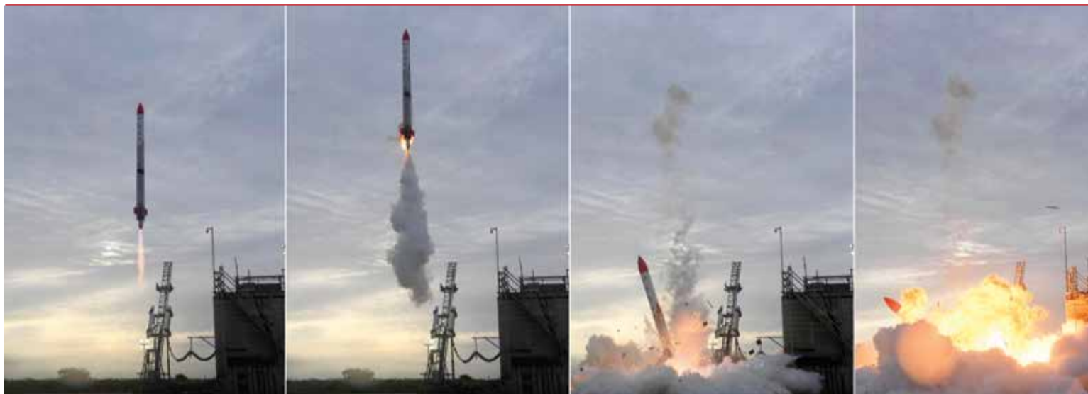
This combination of photos shows the failed launch of a Japan's privately developed rocket, MOMO-2, in Taiki, northern island of Hokkaido.