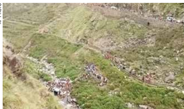
The area of a deadly bus accident in Uttarakhand's Paudi Garhwal district