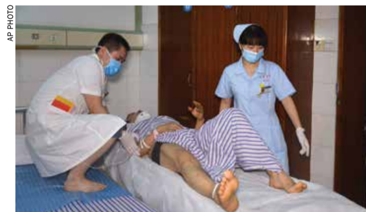
Hospital workers attend to a person injured in a coach-truck collision accident in Hengdong County

A larger protest march, an annual event that attracts tens of thousands of people, is scheduled for yesterday afternoon. AP