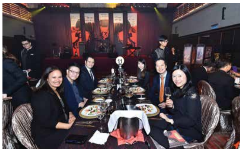
Bank of China Diamond Sponsors and guests

Whilst funds from the Ball help towards the professional running of BBAM's offices, 50 percent of profits are guaranteed to go to CSR projects that support local Macau students facing financial difficulties and helping them to complete their education.