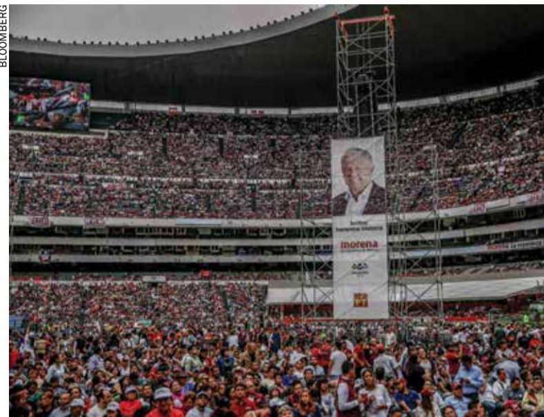
A campaign rally by candidate Manuel Lopez Obrador

This is Lopez Obrador's third bid for the presidency and some