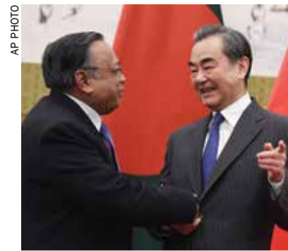
Mahmood Ali (left) chats with Wang Yi before a meeting

Goldman Sachs Group Inc., Morgan Stanley and CLSA Ltd. led Xiaomi's IPO as joint sponsors. Bloomberg