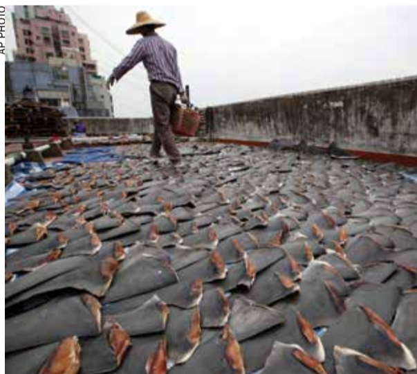
A worker collects pieces of shark fins dried on the rooftop of a factory building in Hong Kong

rican shark fishermen and processors. China is one of the biggest buyers of shark fins, as the product is used to make shark fin soup, an Asian delicacy.