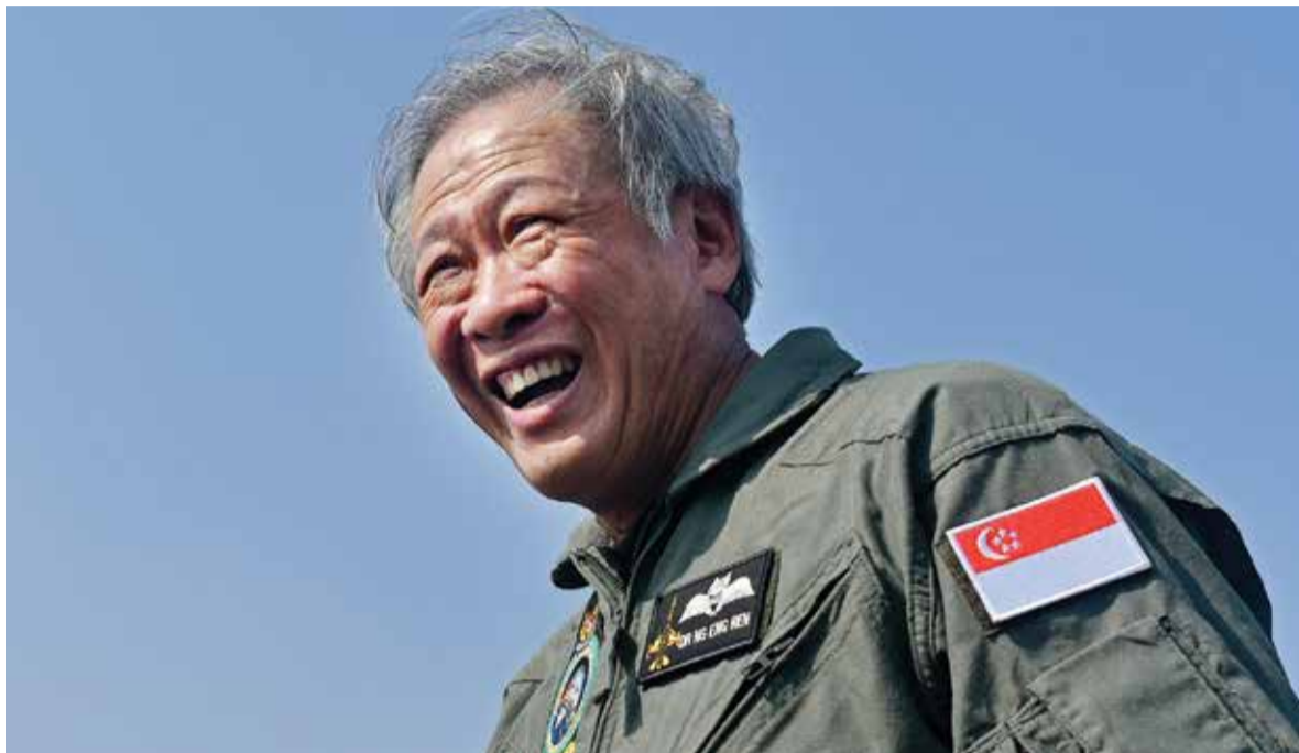
Singapore's defense minister Ng Eng Hen

rean leader Kim Jong Un had been invaluable to the Singapore Armed Forces to validate its defense systems, and also helped to send a message to would-be attackers that the SAF meant business.