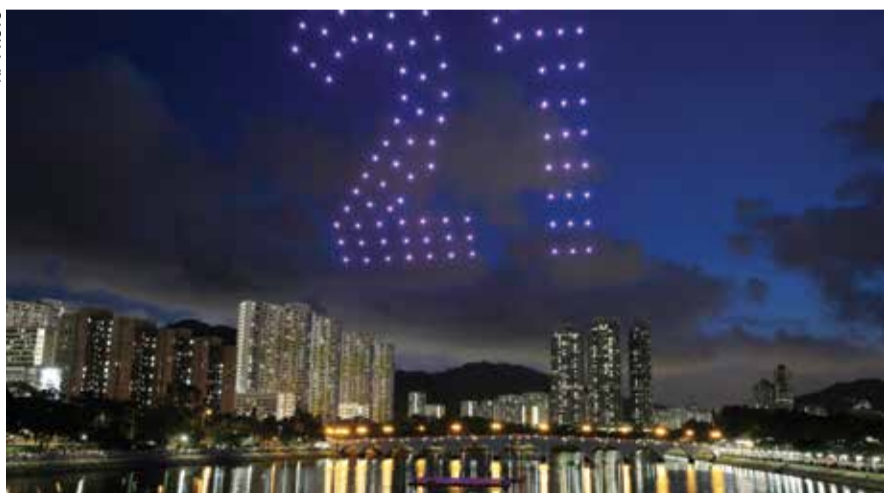
One hundred drones are remote-controlled to form a shape of number 21 in Hong Kong

The ceremony, held beside Victoria Harbour, continued uninterrupted with Beijing-backed Hong Kong leader Carrie Lam in attendance. At a reception later yesterday, she expressed confidence in Hong Kong's future without