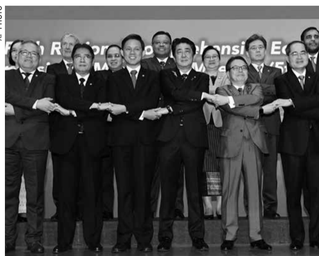
Shinzo Abe (center) joins hands with trade ministers from Asian countries for a group photo

tariff on auto imports could backfire, jeopardizing hundreds of thousands of American jobs created by Japanese automobile industry-related companies, raising prices for U.S. consumers and causing a disaster for the U.S. and global economy.