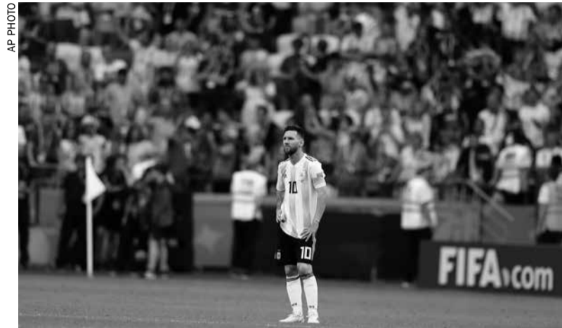
Messi stands on the pitch at the end of the round of 16 match between France and Argentina

Ronaldo lost a World Cup semi-final in 2006 but never got past the second round again. He did help Portugal to its first European Championship in 2016.