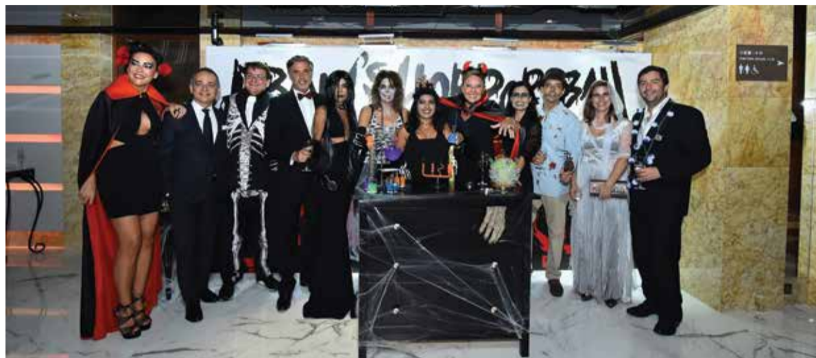
DSL Lawyers and guests out to party hard