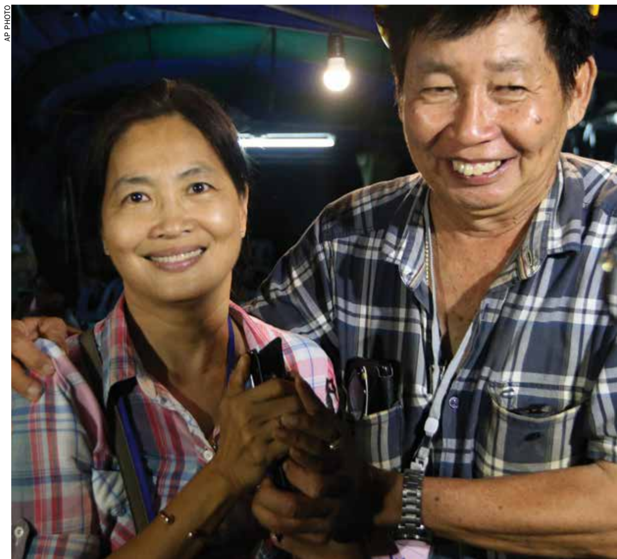
Family members smile after hearing the news that the missing 12 boys and their coach were found