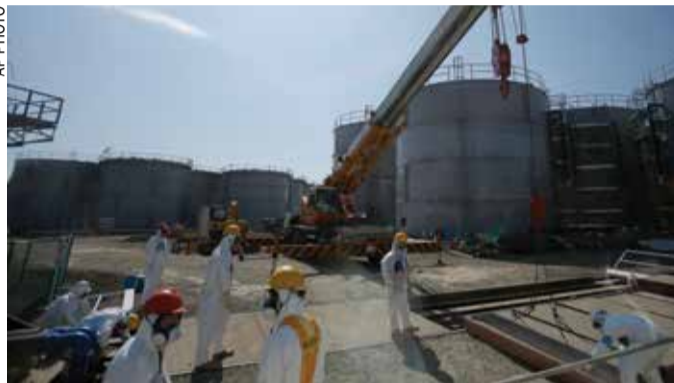
Cleaning works at the troubled Fukushima nuclear plant

sition, Japan is still seeking to develop a replacement for it.