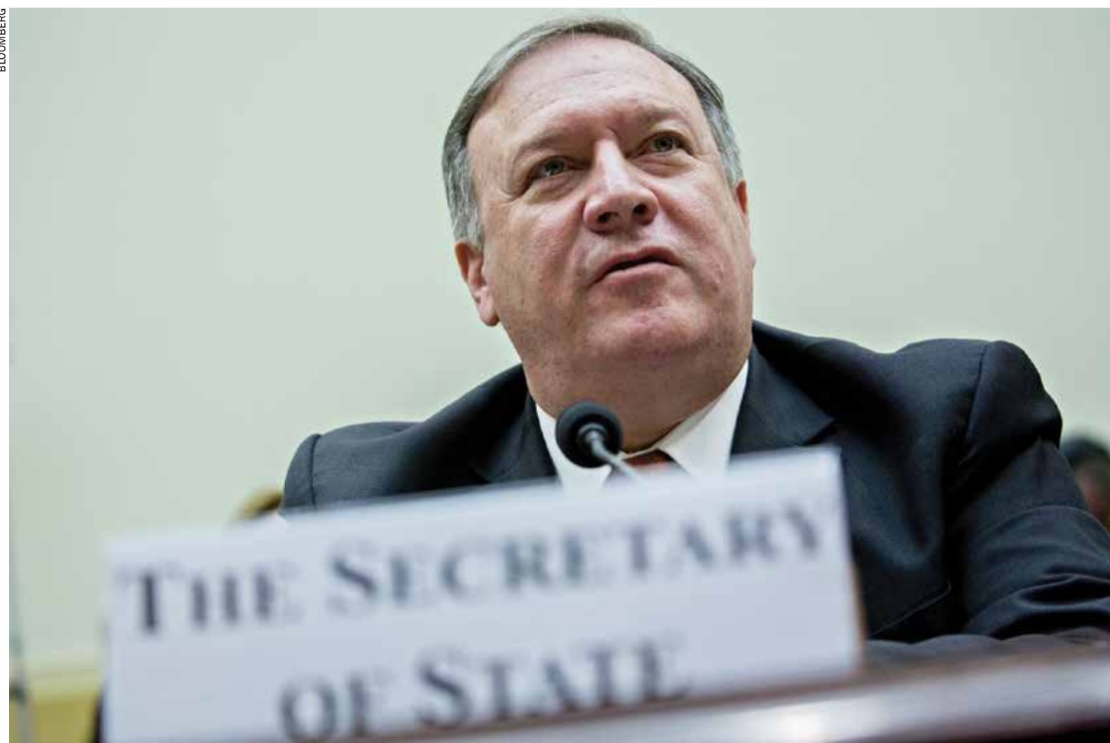
U.S. Secretary of State Mike Pompeo

Axios reported Monday that Trump was considering meeting Kim in September in