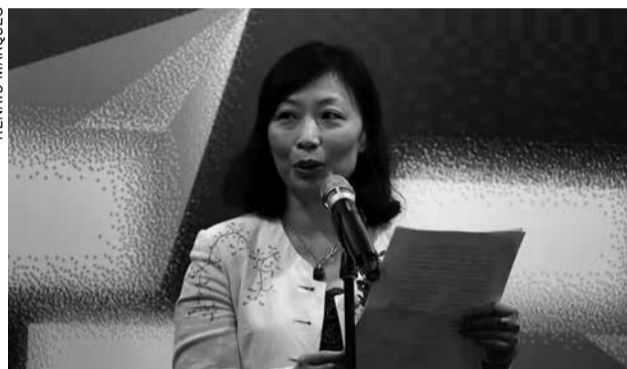
Mok Ian Ian pictured during the opening ceremony

At the opportunity, the president of the Cultural Affairs Bureau (IC) Mok Ian Ian, noted that the festival - which will last until July 13 featuring a total of 24 films - falls in line with the "national policies of strengthening Macau's role as a bridge between China