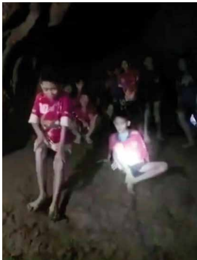
In this grab taken from video provided by the Thai Navy Seal, a view of the boys and their coach as they are rescued in a cave