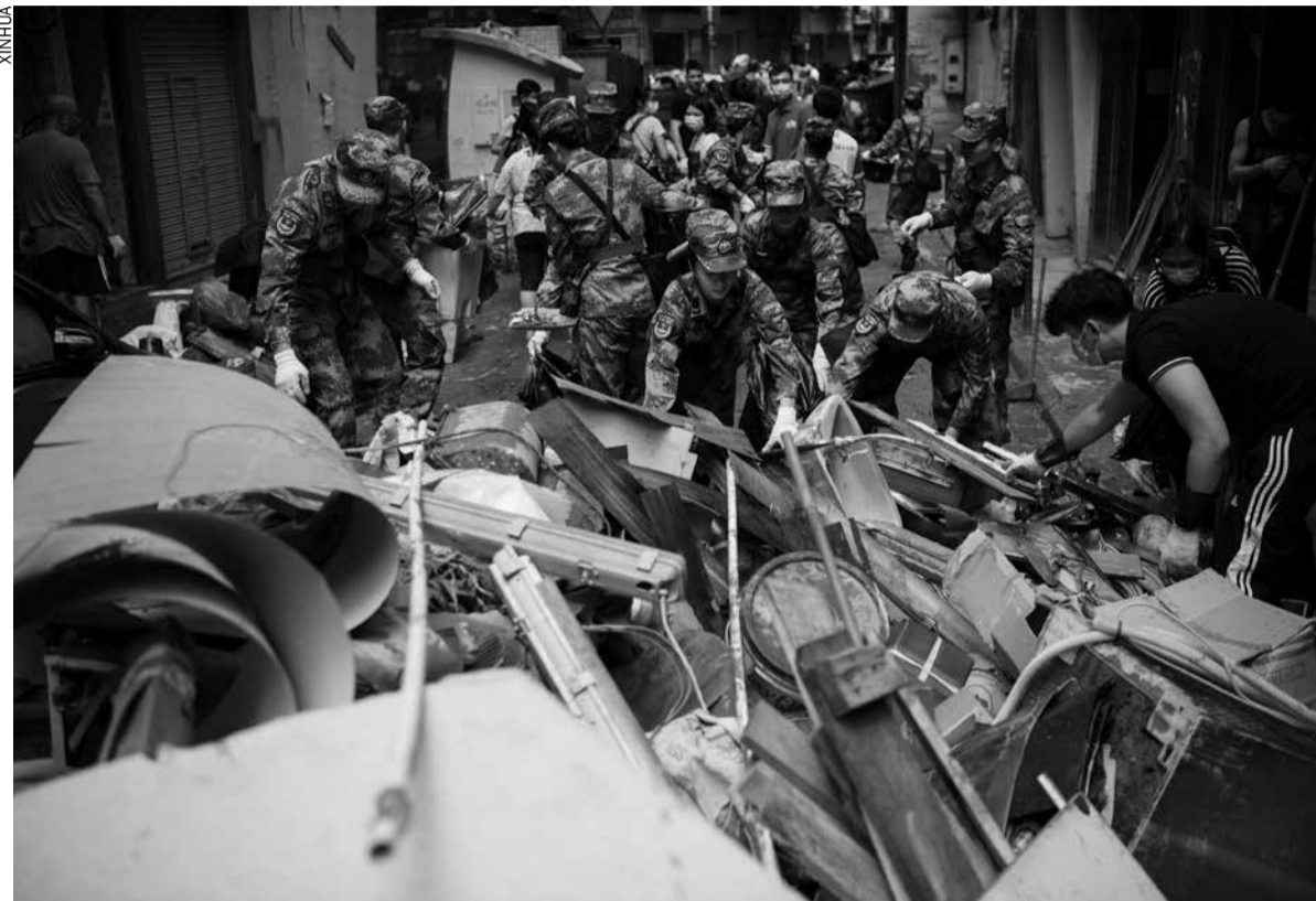
PLA soldiers conducting cleaning operations in the aftermath of Typhoon Hato