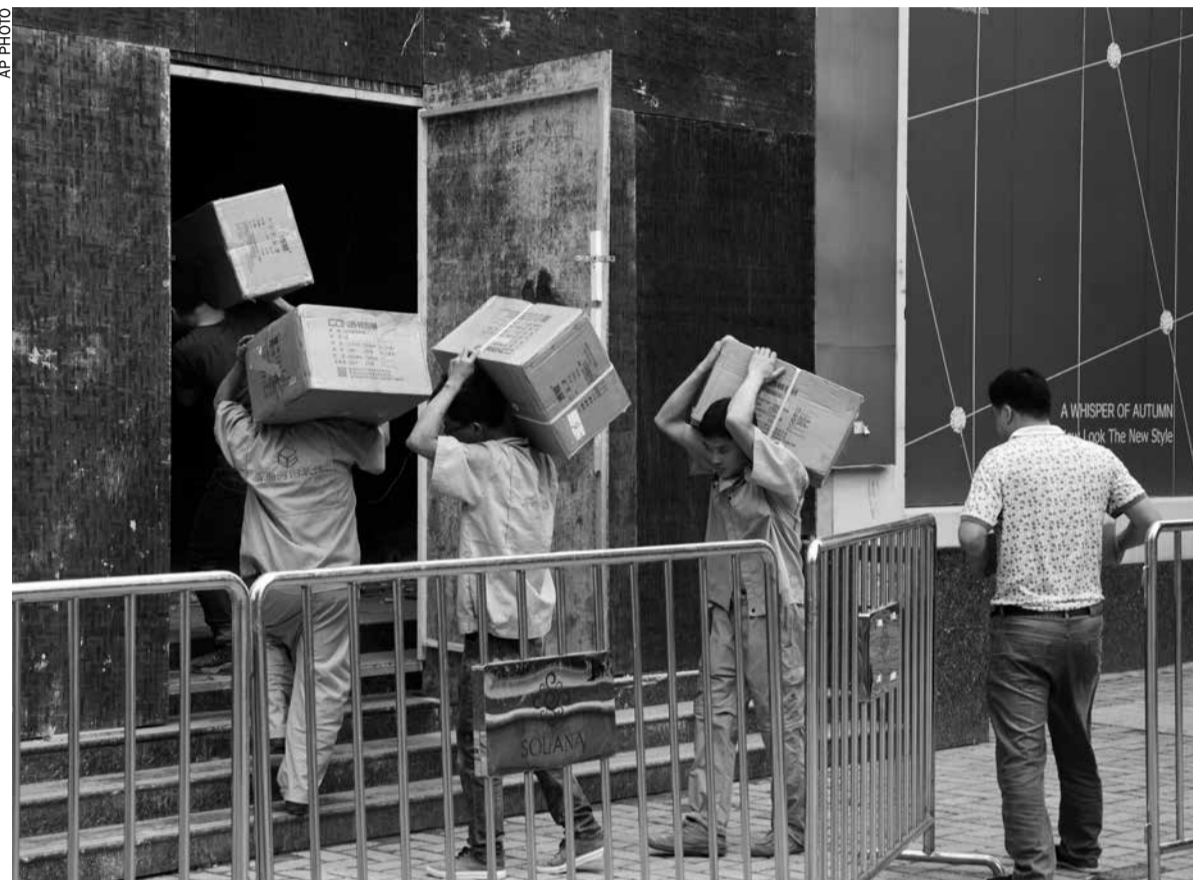
Workers carry boxes of LED lights into a renovation site in Beijing

Lu yesterday called the warnings "unfounded speculation