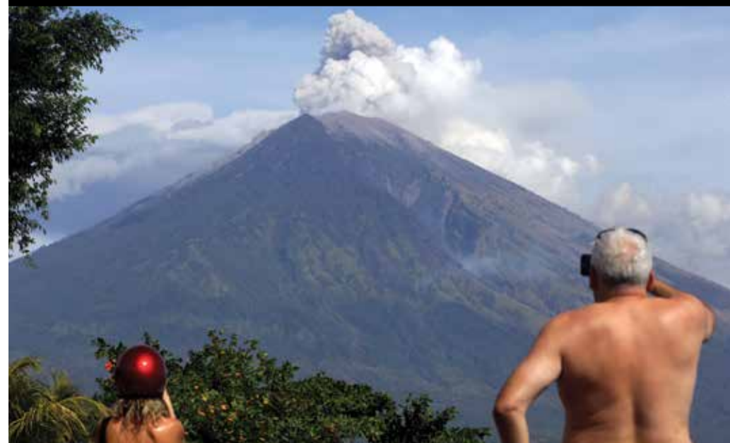
Tourists watch Mount Agung erupt in Karangasem, Bali, Indonesia. The volcano on the Indonesian tourist island of Bali erupted Monday evening, ejecting a 2,000-meter-high column of thick ash and hurling lava down its slopes.