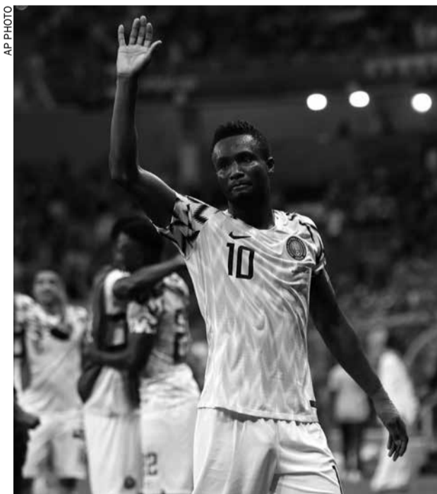
Nigeria captain John Obi Mikel