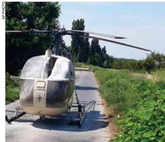
This photo taken on Sunday, and provided by the AP on the condition that its source not be revealed shows the abandoned helicopter

A prison guard union member had said the helicopter landed in the only area of Reau Prison that did not have anti-helicop-