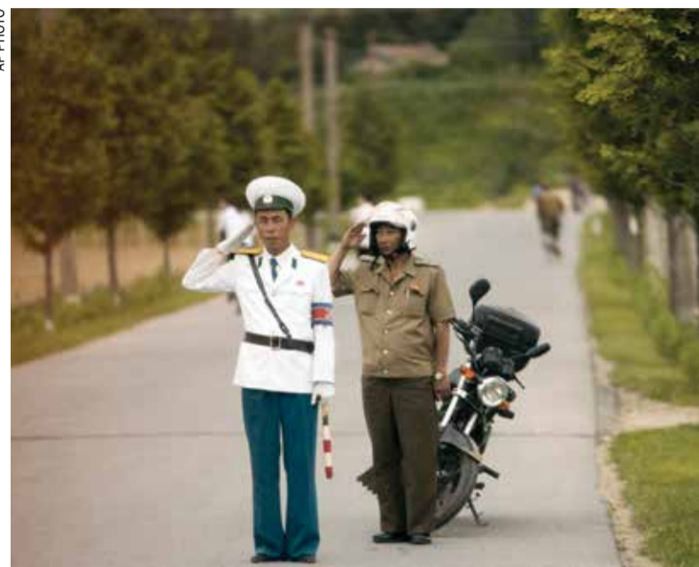
Members of the North Korean military salute the motorcade carrying Pompeo as it makes its way to the Park Hwa Guest House

and challenging and we know critics will try to minimize what we have achieved," he said. Two days of talks with senior North Korean officials had "made progress," he said, and included a "detailed and substantive discussion about the next steps."