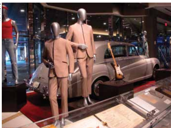
Suits worn by the Beatles during an early tour of America in front of the Rolls Royce automobile owned by Elvis Presley

Alongside is a vintage Springsteen stage outfit