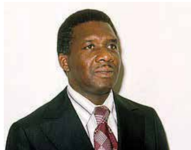
Prime Minister Lynden Pindling