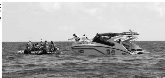
Thai rescue divers and a tourist police boat are seen during a search mission for missing passengers from a capsized tourist boat