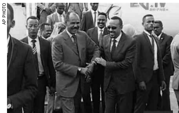
Abiy Ahmed (centre right) is welcomed by Eritrea's President Isaias Afwerki as he disembarks the plane