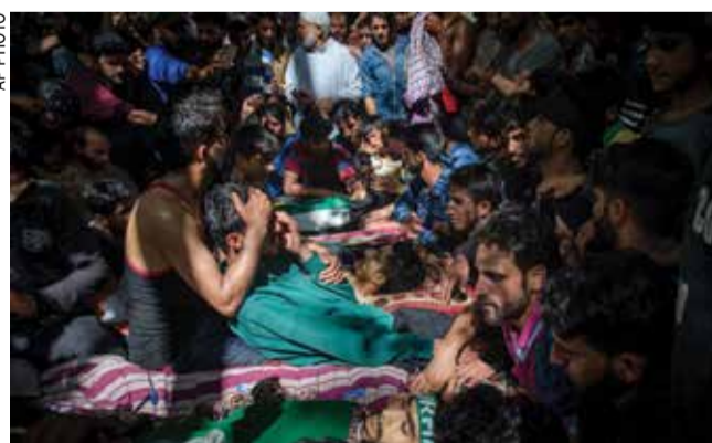
Relatives grieve near the bodies of Kashmiri civilians during a joint funeral procession in Hawoorah village

India has accused Pakistan of arming and training the rebels, a charge Pakis-