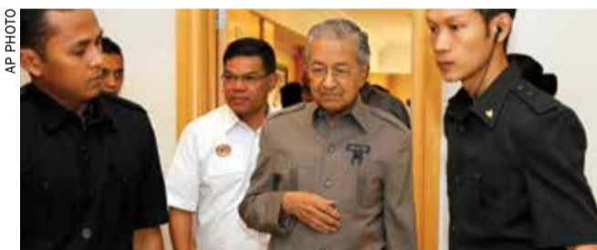
Mahathir Mohamad (center) arrives for a press conference in

"There are several issues to be brought up, among which is the unfairness of the terms of the contract and also of the loans. The interest is also of concern to us because the interest is much higher than when government borrows. Nor-