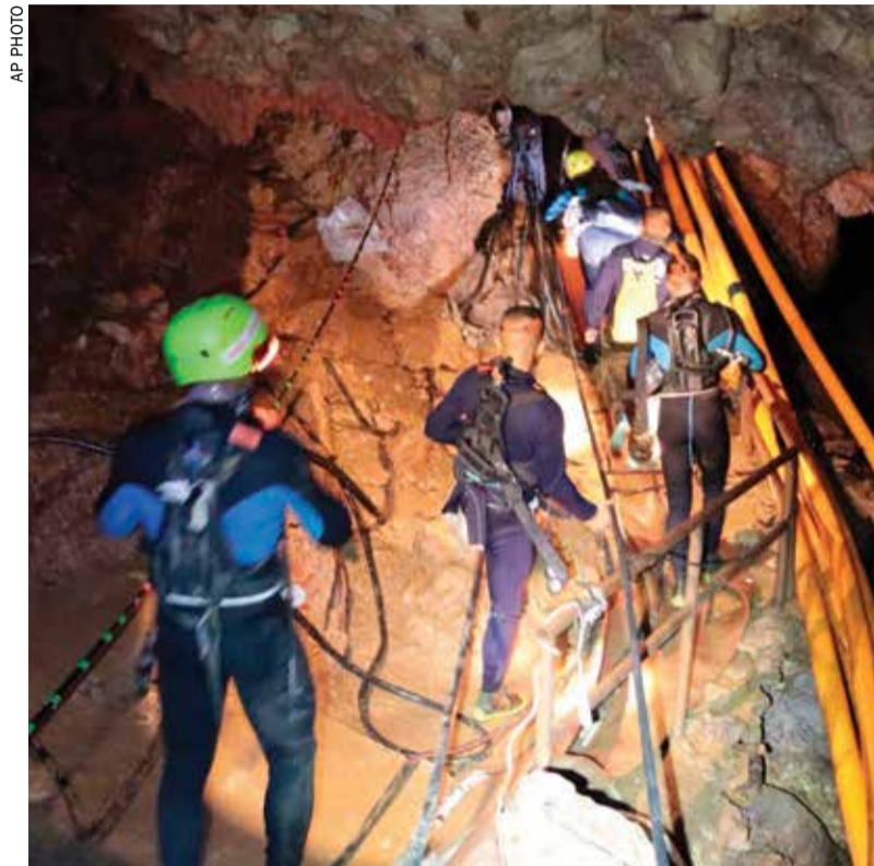
Thai rescue team members walk inside the cave

The entire operation to rescue all 13 could last two to four days, depending on weather and water conditions, said army Maj. Gen. Chalongchai Chaiyakam.