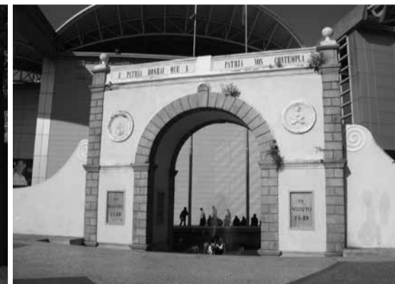
Portas do Cerco

Years of discrimination against his Macanese ethnicity are what modern historians say drove Mesquita to insanity, culminating in the murder of his family and his suicide. As a consequence, Mesquita was denied both a military funeral and a Christian burial during the 19th century.