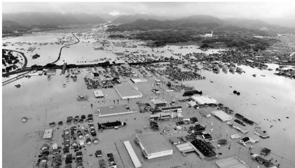
Buildings are almost submerged in floodwaters caused by heavy rains in Okayama prefecture