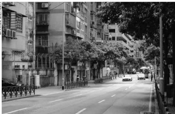
Avenida do Coronel Mesquita named after Mesquita in Areia Preta