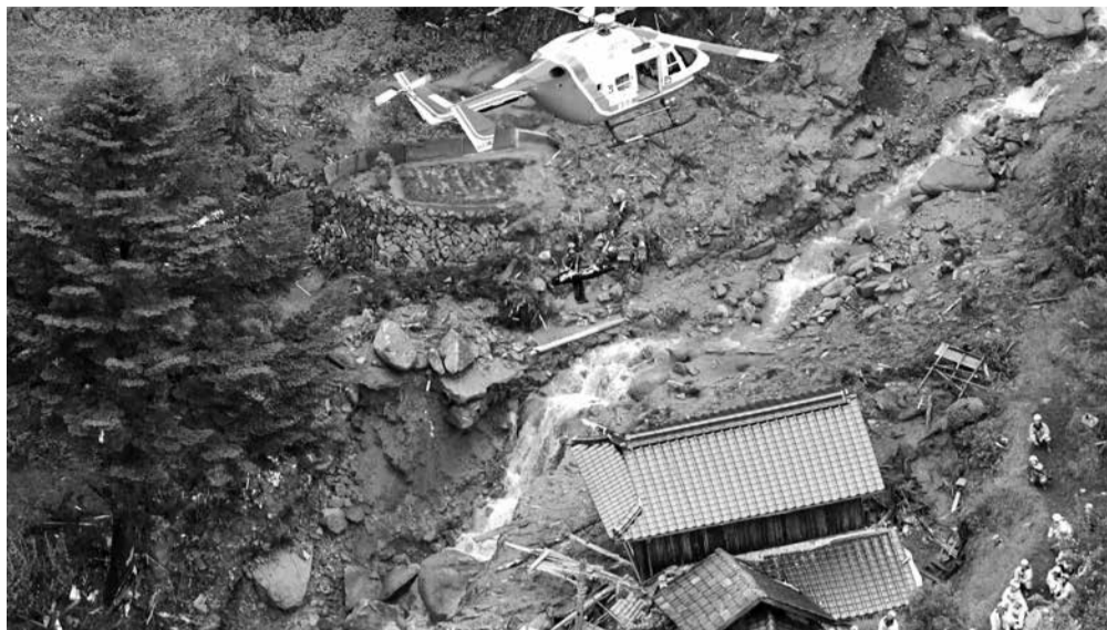
A rescue helicopter hovers over damaged buildings after a landslide caused by heavy rains in Yamaguchi prefecture