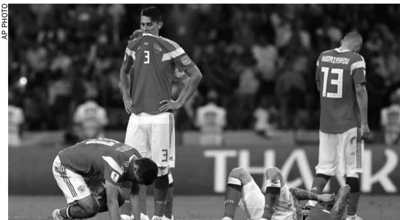
Russian players react at the end of the quarterfinal match between Russia and Croatia

Since the opening match nearly a month ago, Moscow went almost without sleep as fans danced through the night on the streets near the Kremlin, locations where police would normally break up unauthorized gatherings by force. They drank while they partied, singing songs and taking pictures