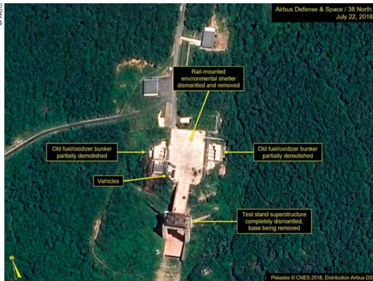
Satellite image released and annotated by 38 North shows what the U.S. research group says is the dismantled engine test stand at the Sohae launch site in North Korea

"The actions at Sohae are a helpful signal that Pyongyang wants to continue negotiations, but do not in themselves advance nuclear disarmament," Mount said in an email. "North Korea still has not disclosed or offered to dismantle facilities that produce or store nuclear or missile systems, or the means to transport