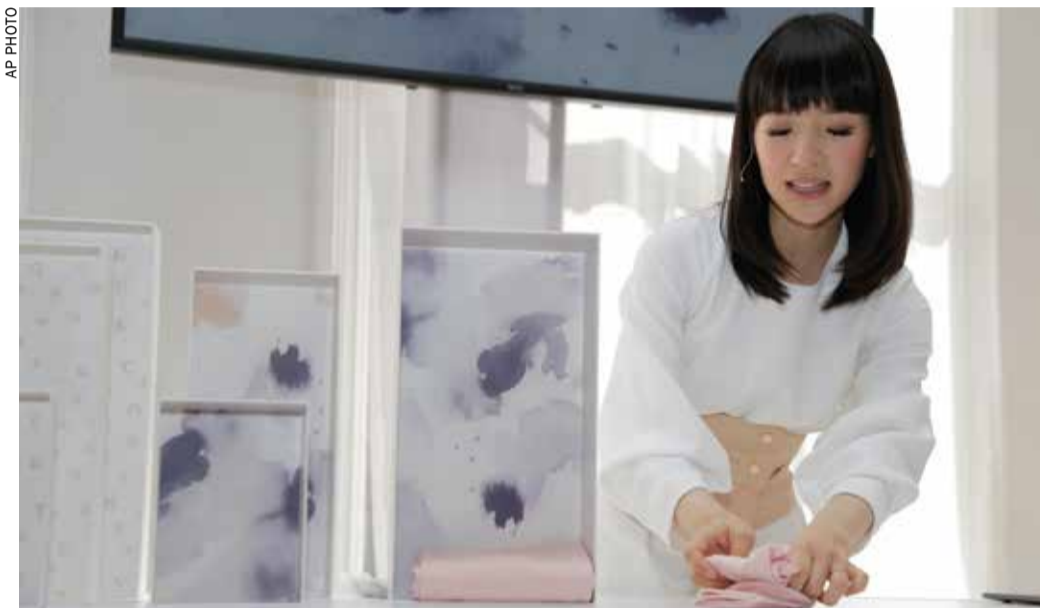
Japanese organizational expert Marie Kondo folds an item of clothing as she introduces her new line of storage boxes during a media event in New York