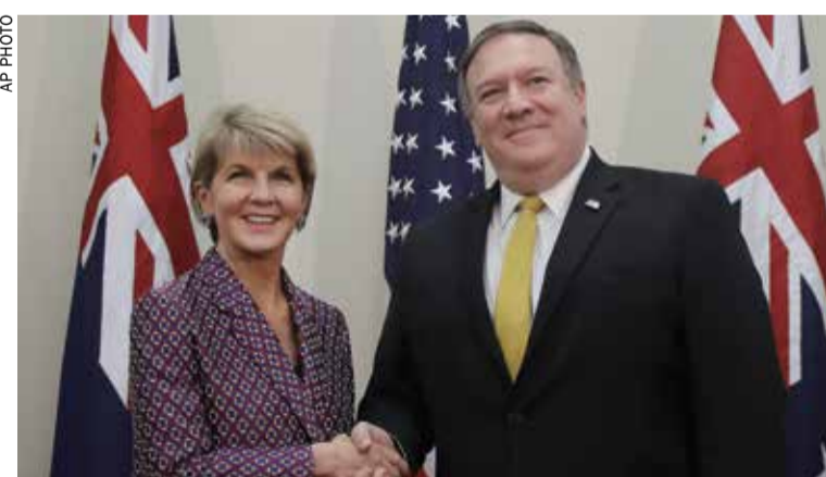
Australia Foreign Affairs Minister Julie Bishop (left) shakes hands with U.S. Secretary of State Mike Pompeo

The U.S. Department of State said this year's talks would focus on threats in the Indo-Pacific region and cooperation to defeat Islamic State militants. China and North Korea were