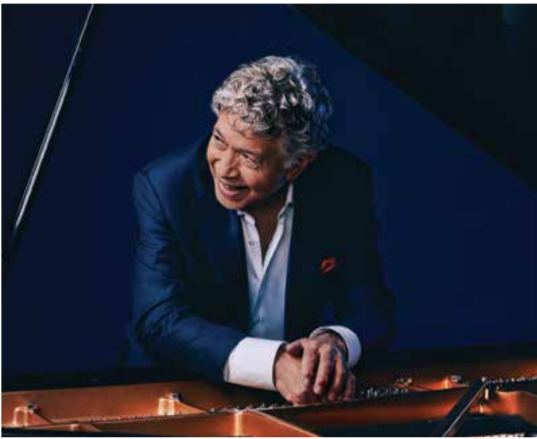
Monty Alexander will present A Life in Jazz