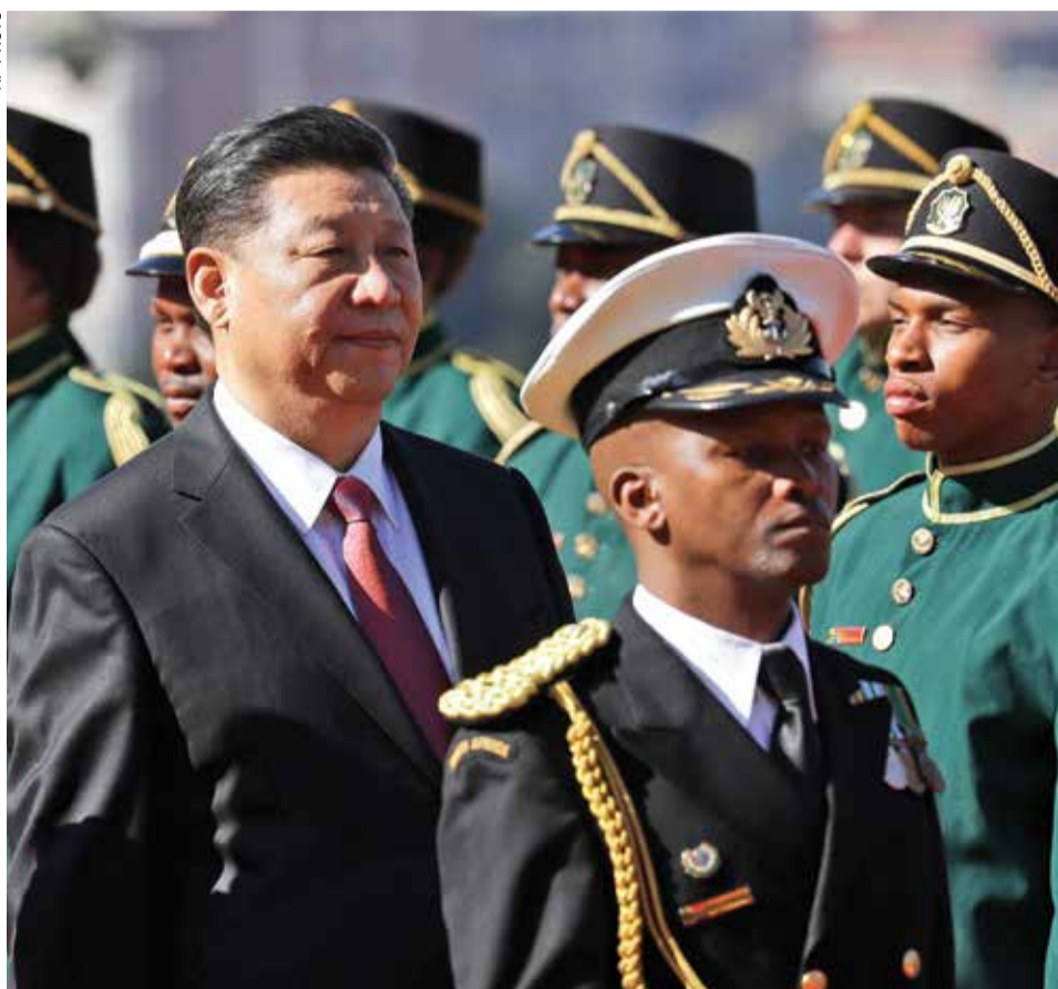
President Xi Jinping of China (left) inspects the honour guard during an official welcoming ceremony at the government’s Union Buildings, yesterday

Member countries — Brazil, Russia, India, China and South Africa — begin a three-day summit in Johannesburg today. Turkey’s President Recep Tayyip Erdogan is also expected to attend the meeting. AP