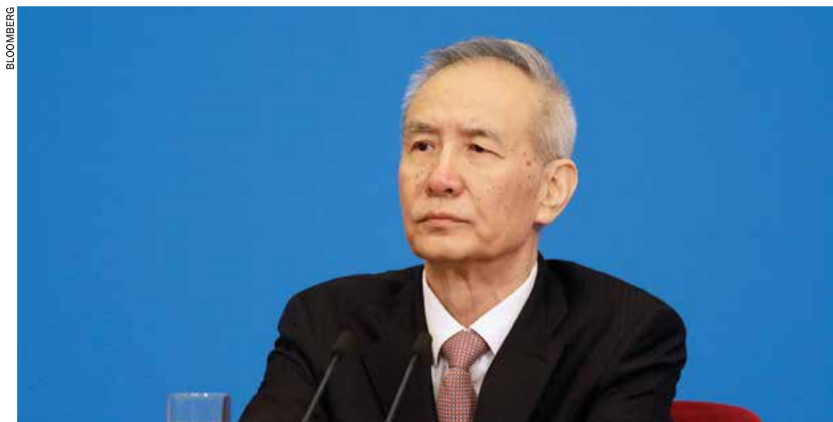
Vice Premier Liu He