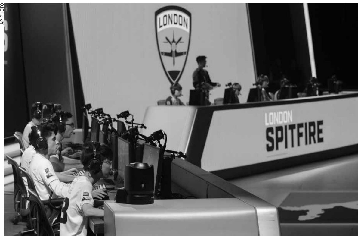
The London Spitfire (background) competes against the Philadelphia Fusion

The twelve-team league has many traditional sports markers: regional divisions, a preseason and postseason, and even broadcast rights deals with Twitch and ESPN. Blizzard Entertainment, the creator of Overwatch, structured the league on traditional sports, even