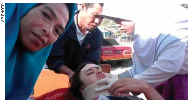
Medical officers take care of earthquake victims at Sembalun village

The quake caused blackouts in East Lombok and North