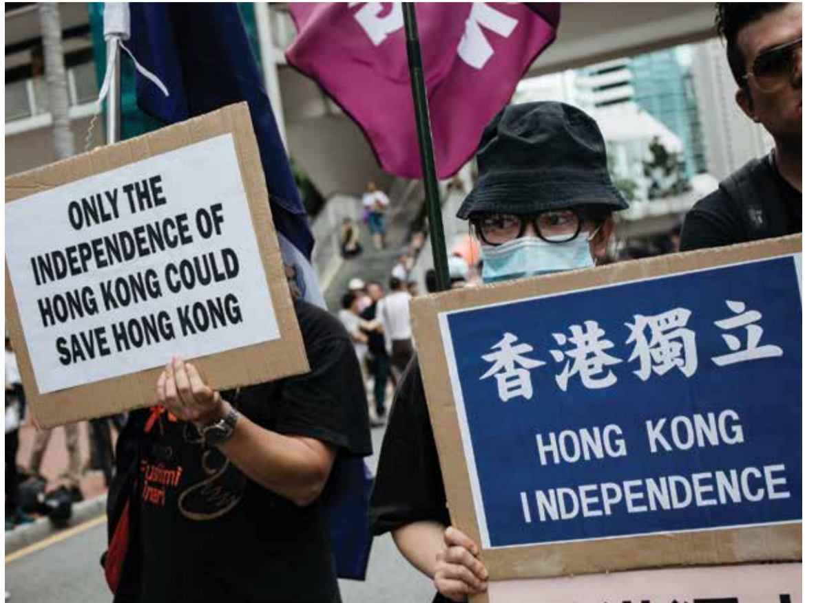
Protesters hold placards calling for Hong Kong's independence during a 2016 rally