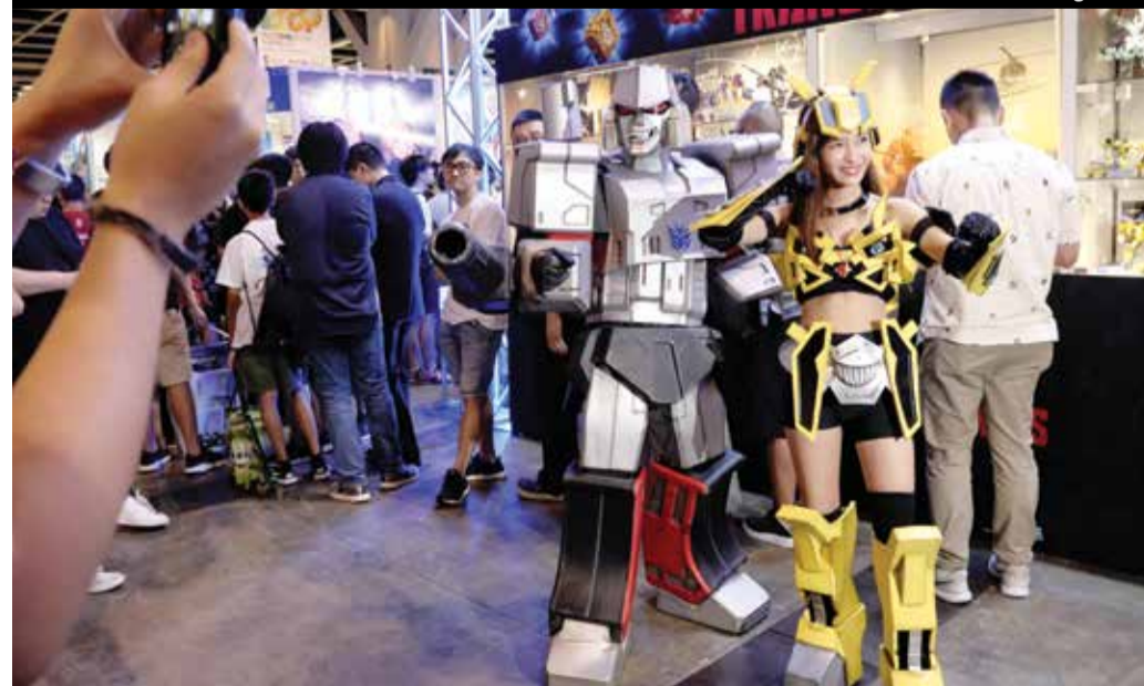
A girl dressed up as an anime character poses for photos at the Hong Kong Convention and Exhibition Center. The five-day 20th Animation Comic Games Hong Kong kicked off on Friday.