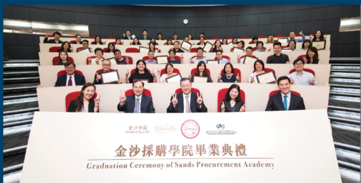
Guests of honour, Sands China executives and graduating local suppliers attend a graduation ceremony for the Sands Procurement Academy July 19 at the Adelson Advanced Education Centre at The Venetian Macao.

Sands China's Local Small, Medium and Micro Suppliers Support Programme is in line with the Macao government's initiative to "buy local" and demonstrates Sands China's commitment to supporting local enterprises as part of the company's corporate social responsibility efforts. It is part of Sands China's supplier relationship management strategy, which guides the company's long-standing effort to support local suppliers, whom it views as its strategic partners.