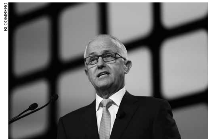
Prime Minister Malcolm Turnbull

Still, Turnbull, 63, has downplayed the chances