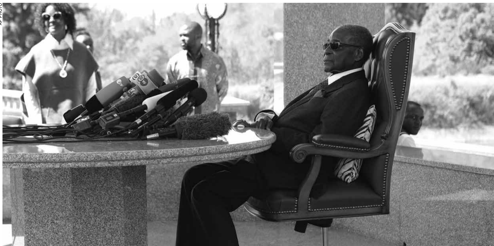
Former Zimbabwean President Mugabe holds a press briefing at his residence in Harare