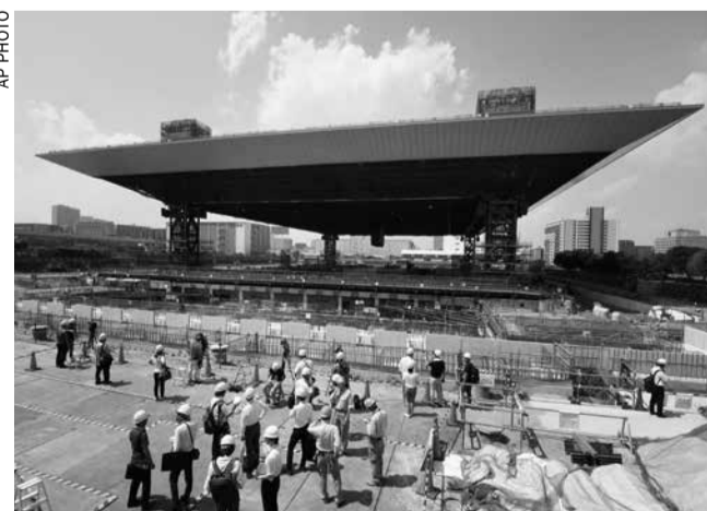
The Olympic Aquatics Center under construction

"Overall, Tokyo 2020 is right on track to deliver the Games in two years'