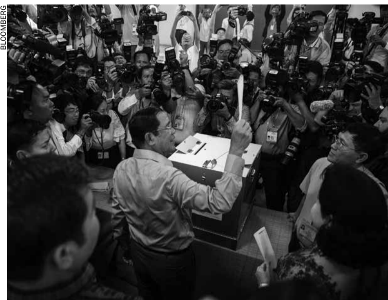
Hun Sen casts his ballot

As a staunch supporter of Hun Sen's regime, Beijing has billions of dollars at stake. This month, U.S. security-research firm FireEye said it found evidence of a Chinese hacking team infiltrating computer systems be-