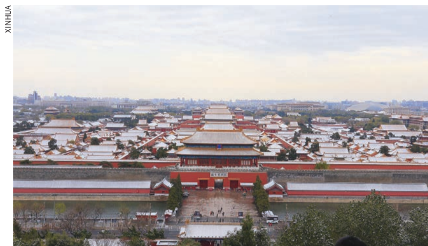
The Forbidden City in Beijing