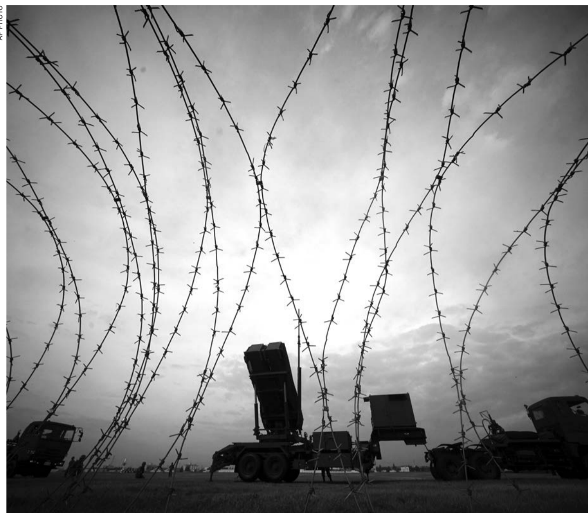
The PAC-3 surface to air interceptors at the U.S. Yokota Air Base in Fussa, on the outskirts of Tokyo

North Korea has increased the range, accuracy and versatility of its missiles and di-