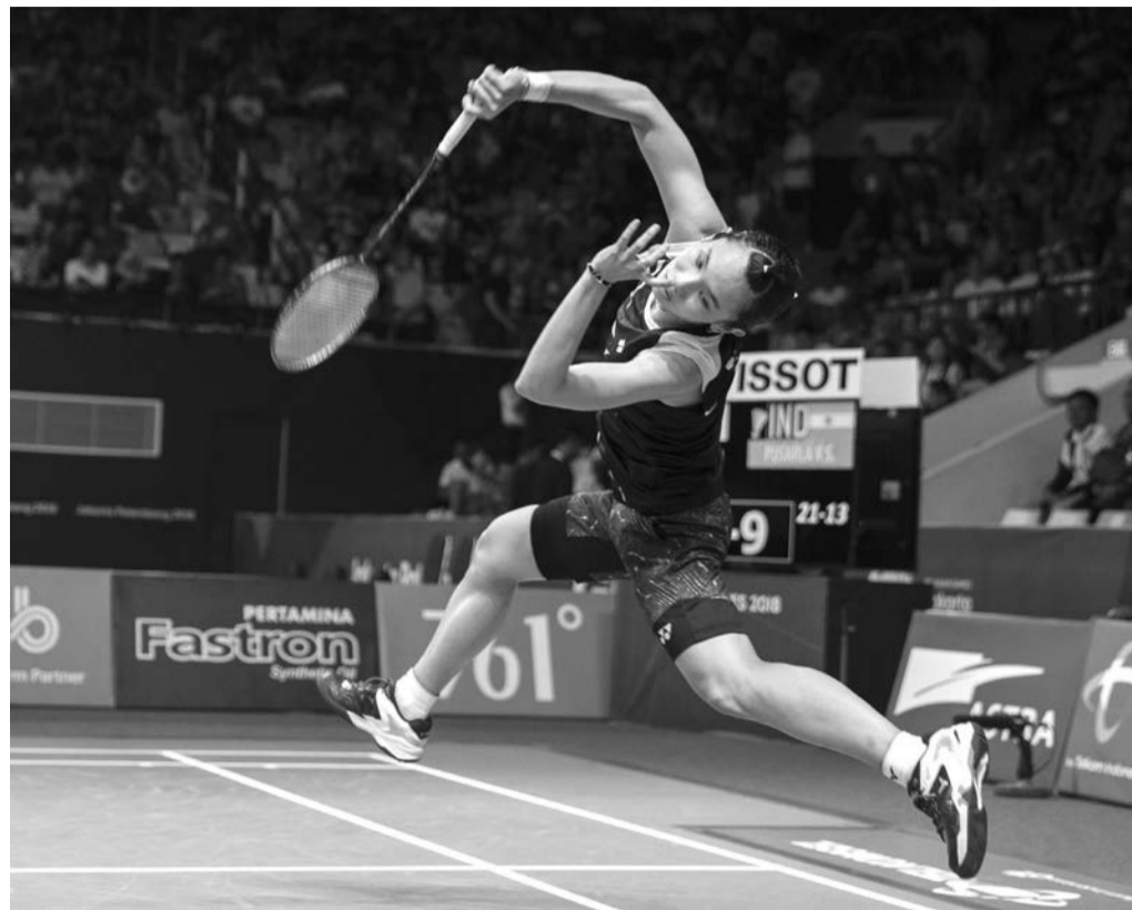
Tai Tzu-ying of Taiwan won the women's tournament