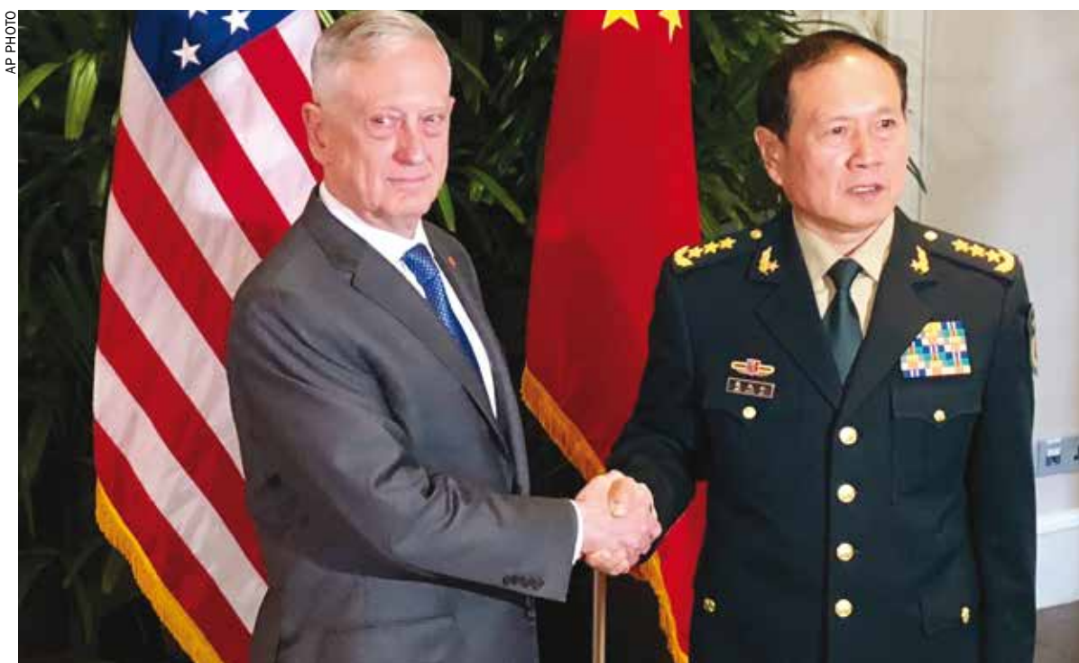
Jim Mattis (left) meets Chinese Defense Minister Wei Fenghe

China did not immediately comment to U.S. media outlets at the conference after the meeting between Mattis and Wei.