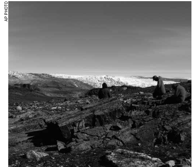
Scientists examine rocks in Greenland