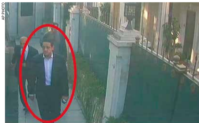
A man previously seen with Saudi Crown Prince's entourage walks outside the Saudi consul general's residence in Istanbul

Saudi Arabia, which initially called the allegations "baseless," has not responded to repeated requests for comment from over recent days. The Sabah report showed the man walking past police barricades at the consulate at 9:55 a.m.