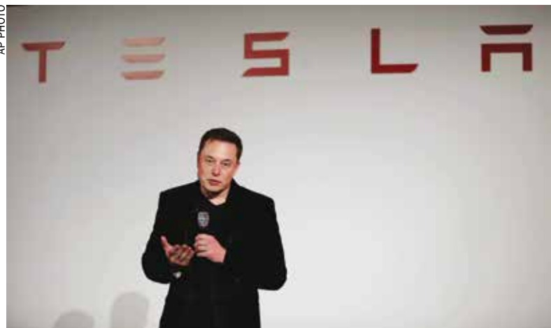
Elon Musk, CEO of Tesla Motors