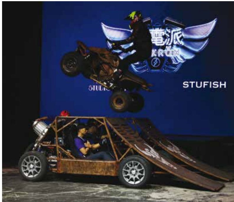
Aspect of the show