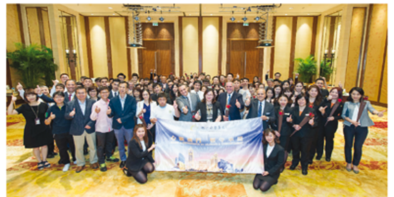
The GEG Integrated Resort Internship Program has been bringing many aspiring young people onto its properties to get real-world experience in the integrated resort business.