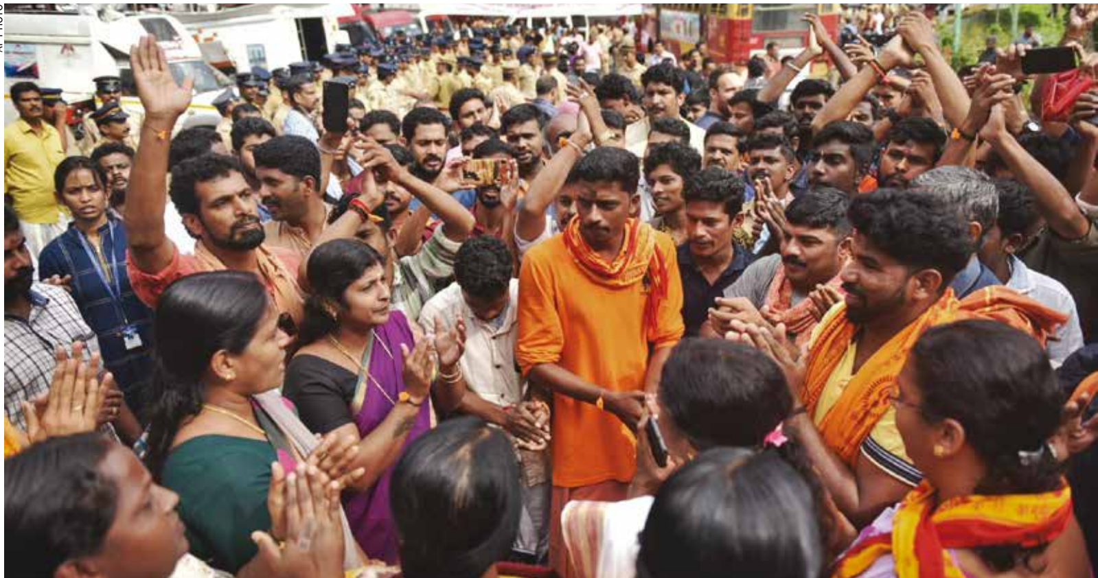
Protesters who are opposed to allowing women of menstruating age from entering the Sabarimala temple chant devotional hymns