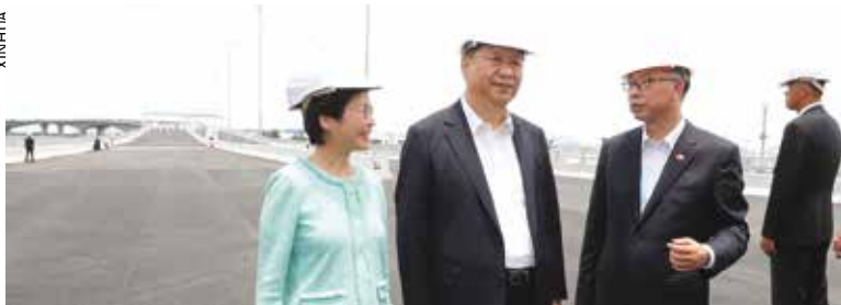
Xi Jinping inspects the Hong Kong-Zhuhai-Macau bridge

The South China Morning Post (SCMP), citing an unidentified source, said that local authorities in the Pearl River Delta were "still awaiting confirmation from the mainland authorities," adding that "there may be a last-minute change."