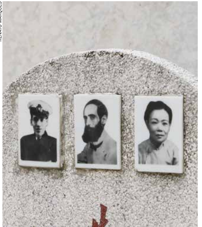
Pessanha's grave in Macau