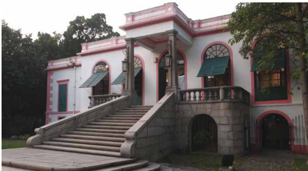
The exhibition is being held at Casa Garden