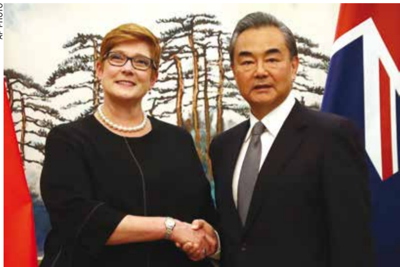
Australian Foreign Minister Marise Payne and Chinese Foreign Minister Wang Yi