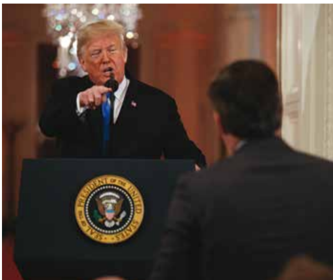
Trump speaks to CNN journalist Jim Acosta during a news conference in the White House

ned that the media did not cover the humming economy and was responsible for much of the country's divided politics. He said, "I can do something fantastic, and they make it look not good."