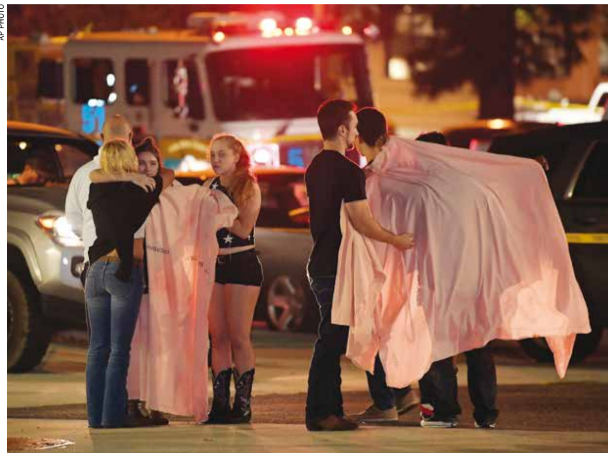
People comfort each other as they stand near the scene yesterday