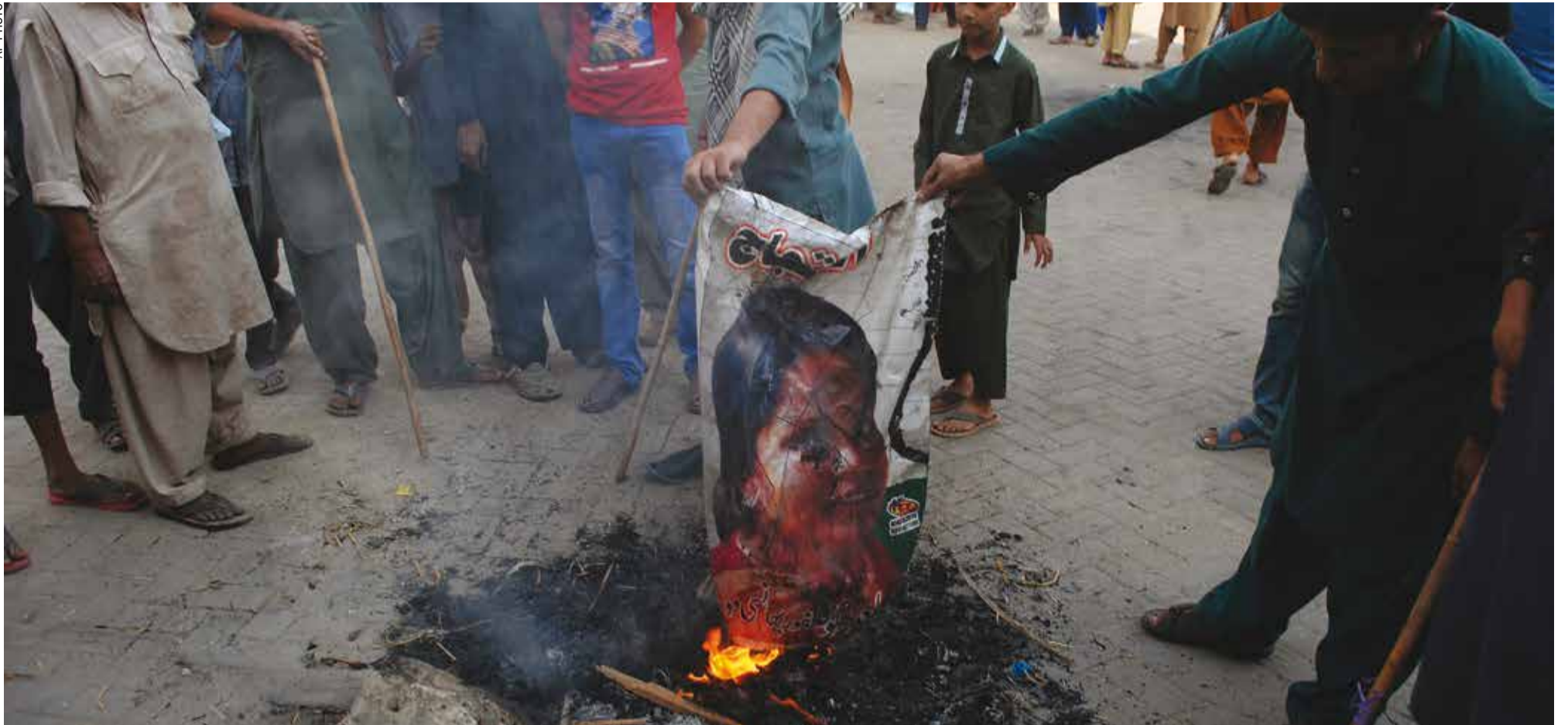
The court decision to acquit and free Aasia (seen in burning poster) caused a torrent of anger among Muslim radicals