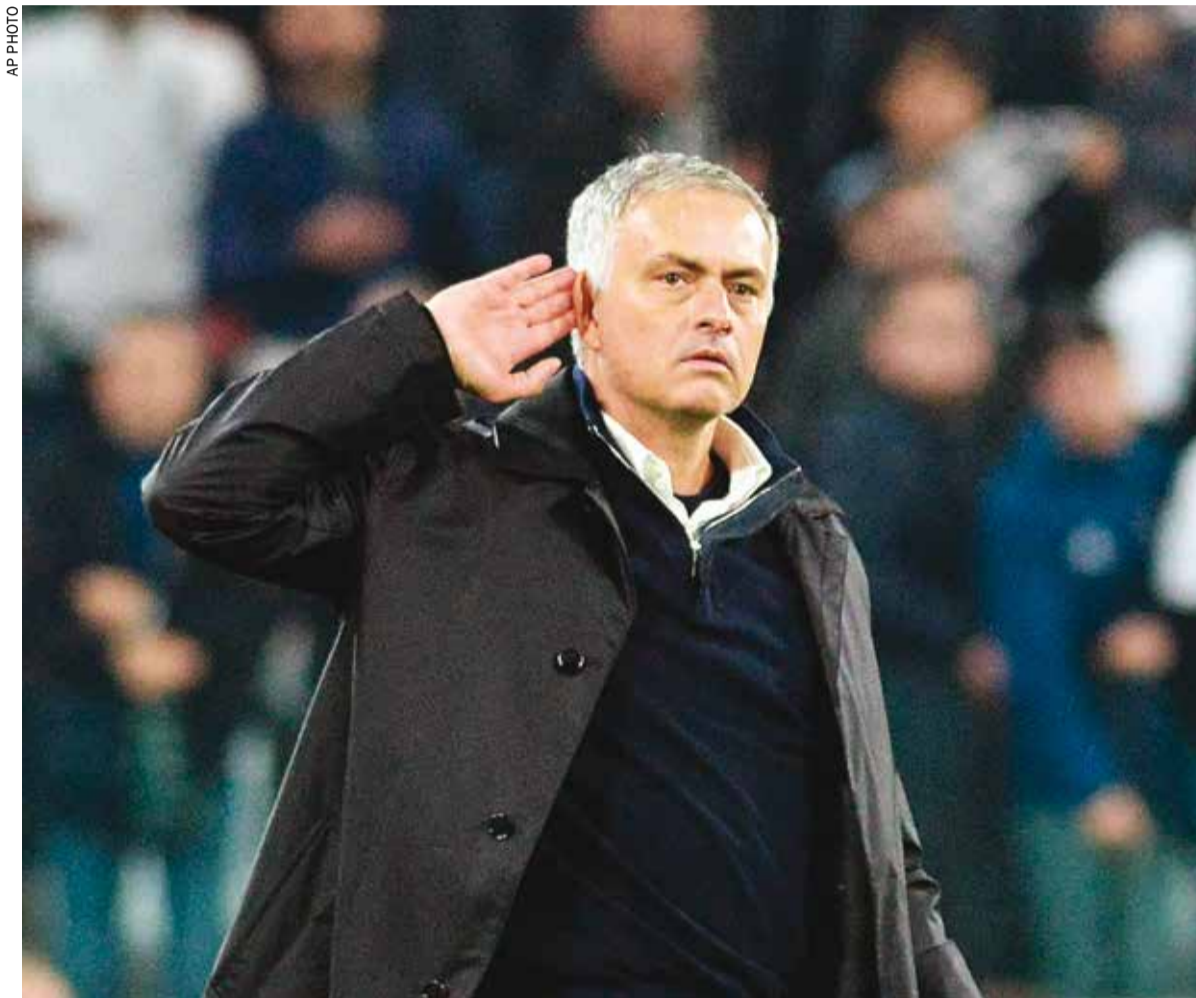
Mourinho reacts towards Juventus' fans at the end of the match

This time he had another win to celebrate, after watching his team fight back from Cristiano