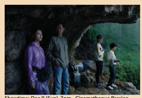
Showtime: Dec 9 (Sun), 7pm - Cinematheque Passion