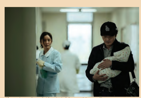
Showtime: Dec 9 (Sun), 6:30pm - Macao Tower