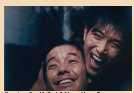
Showtime: Dec 13 (Thu), 9:30pm - Macao Tower