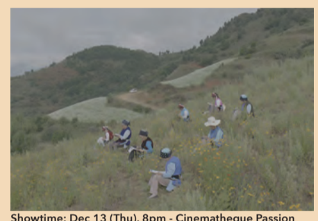
Showtime: Dec 13 (Thu), 8pm - Cinematheque Passion