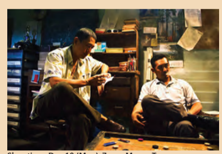
Showtime: Dec 10 (Mon), 7pm - Macao Tower