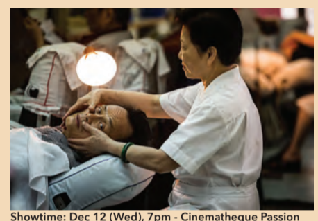
Showtime: Dec 12 (Wed), 7pm - Cinematheque Passion

Screen International is partnering with IFFAM to showcase the uniqueness that is Chinese cinema and introduce to the world the best contemporary Chinese-speaking directors. There is a total of six movies being screened in this segment.