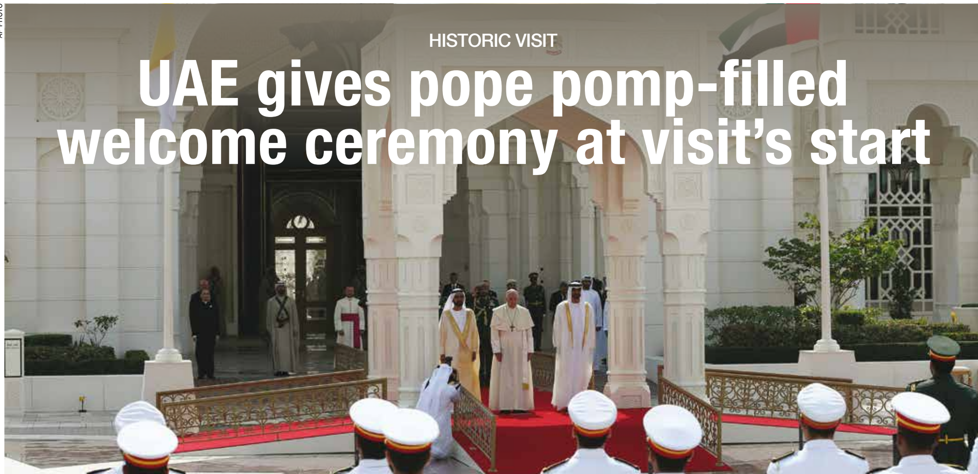
Pope Francis is welcomed by Abu Dhabi's Crown Prince and Deputy Supreme Commander of the UAE's Armed Forces, Sheikh Mohammed bin Zayed Al Nahyan (right), and Sheikh Mohammed bin Rashid Al Maktoum, Vice President and Prime Minister of the UAE and Ruler of Dubai, at the Abu Dhabi Presidential Palace