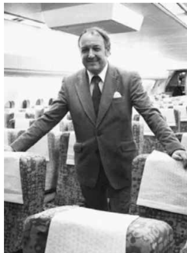
Sir Freddie Laker