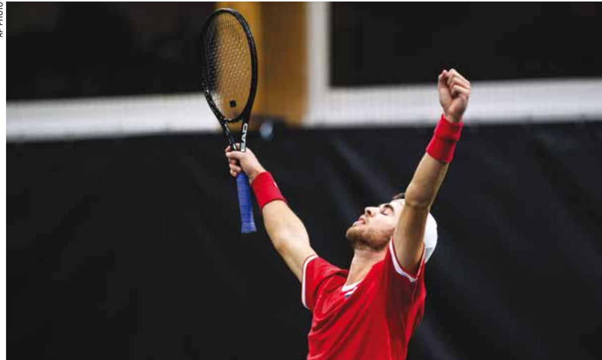
Russia's Karen Khachanov

surmountable 3-1 lead. Earlier, the hosts, playing without Roger Federer or Stan Wawrinka, won the doubles as they fielded