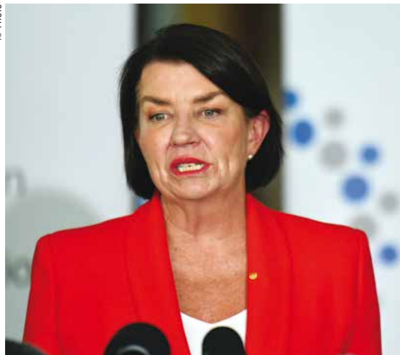
Australian Banking Association CEO Anna Bligh speaks in Canberra at a press conference after the Banking Royal Commission findings were released yesterday