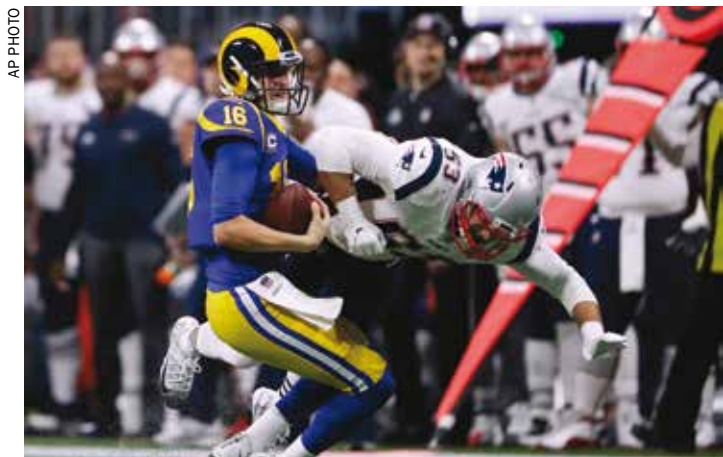
Los Angeles Rams' Jared Goff (16) gets sacked by New England Patriots' Kyle Van Noy (53)