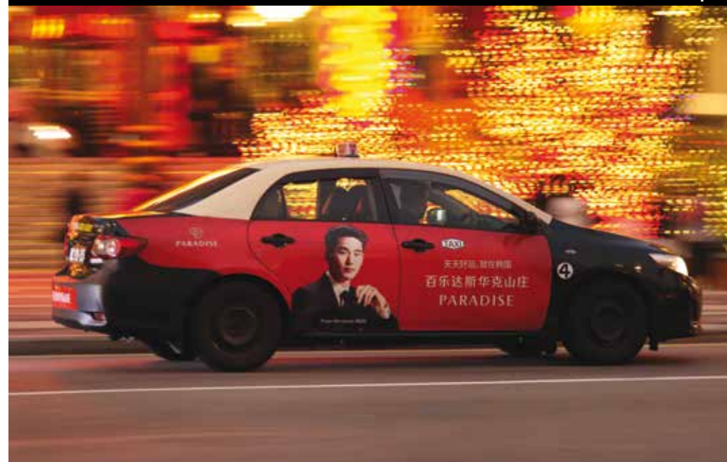
Taxi's paradise. Rides over the counter, flash inflation of rates, abundance of clients over CNY holidays has always been a dark side of this tourism destination little-big-town of ours. A taxi driver's paradise becomes hell to passengers. Business as usual...