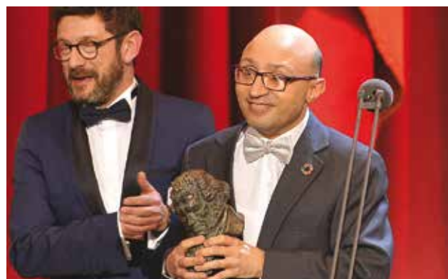
Actor Jesus Vidal celebrates his Goya award

The film "Campeones" ("Champions"), a comedy about a basketball team featuring actors with mental disabilities, won best picture at the Spanish Film Academy's Goya Awards.