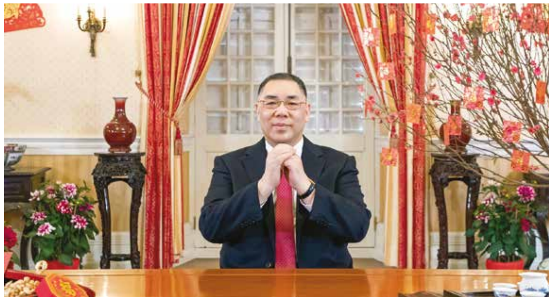
Chui Sai On

Current efforts to advance social development would also constitute clear strides toward building a better Macau for future generations, Chui said.