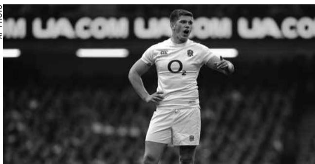
England's Owen Farrell

northern and southern hemisphere sides meeting in a final.