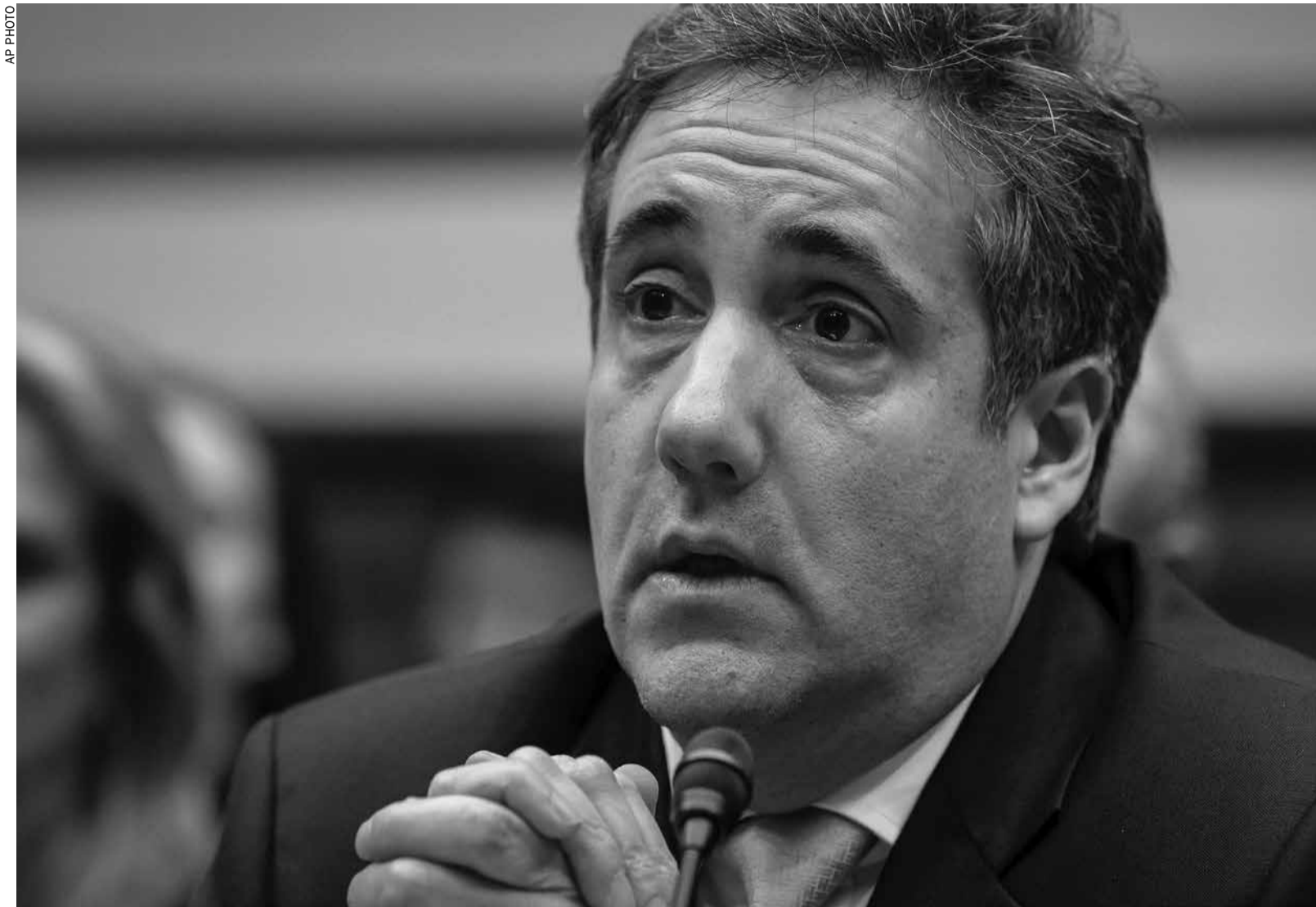
Michael Cohen becomes emotional as he finishes a day of testimony to the House Oversight and Reform Committee on Capitol Hill, Washington