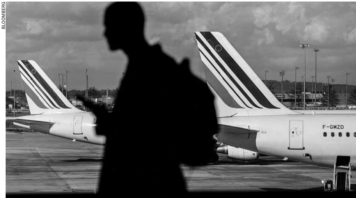
A passenger walks through the terminal as Tricolour livery sits on the tail fins of Air France passenger aircraft

Air France-KLM shares fell 12 percent on Wednesday amid concern a protracted power struggle would hamper ma-