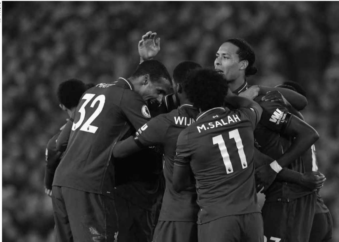
Liverpool's Divock Origi celebrates with teammates after scoring his side's third goal

beating Crystal Palace 3-1 for a club-record eighth straight away win.