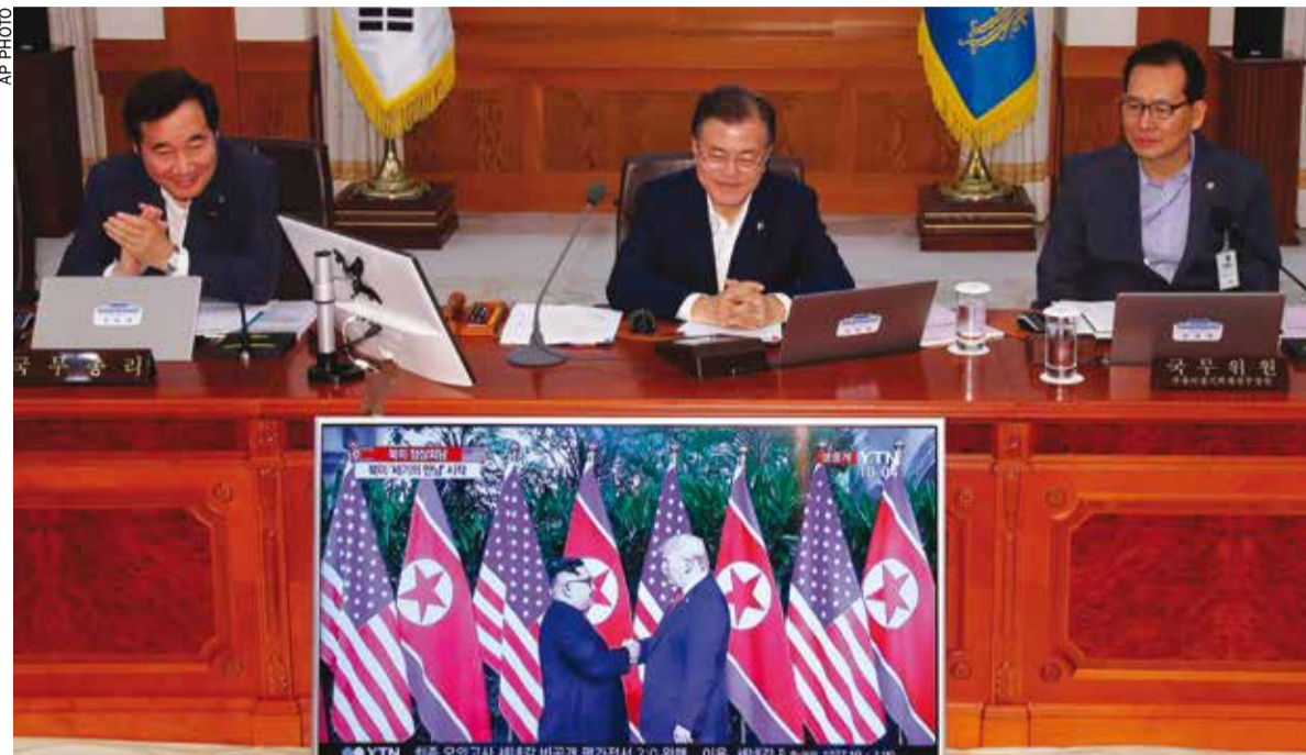
President Moon Jae-in (center) watches the summit

Moon has been held back in his drive for inter-Korean engagement by tough U.S.-led sanctions against North Korea, which prohibit many kinds of