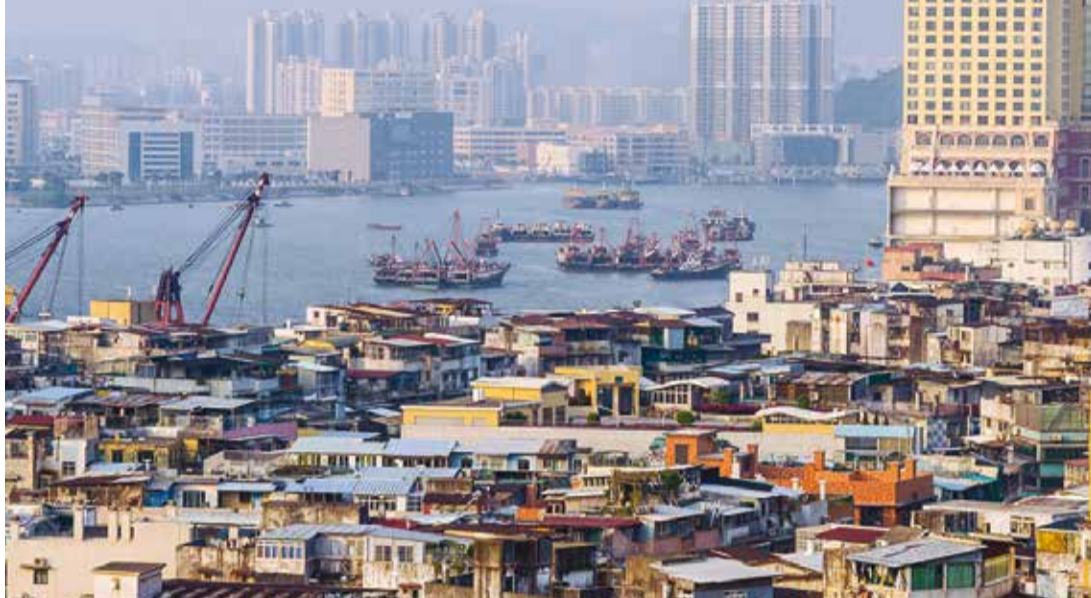
The Inner Harbor

T HE region's economy grew by 4.7 percent year-on-year in real terms in 2018, but the pace of growth slowed notably, according to data released by the Statistics and Census Service. The growth is lower than