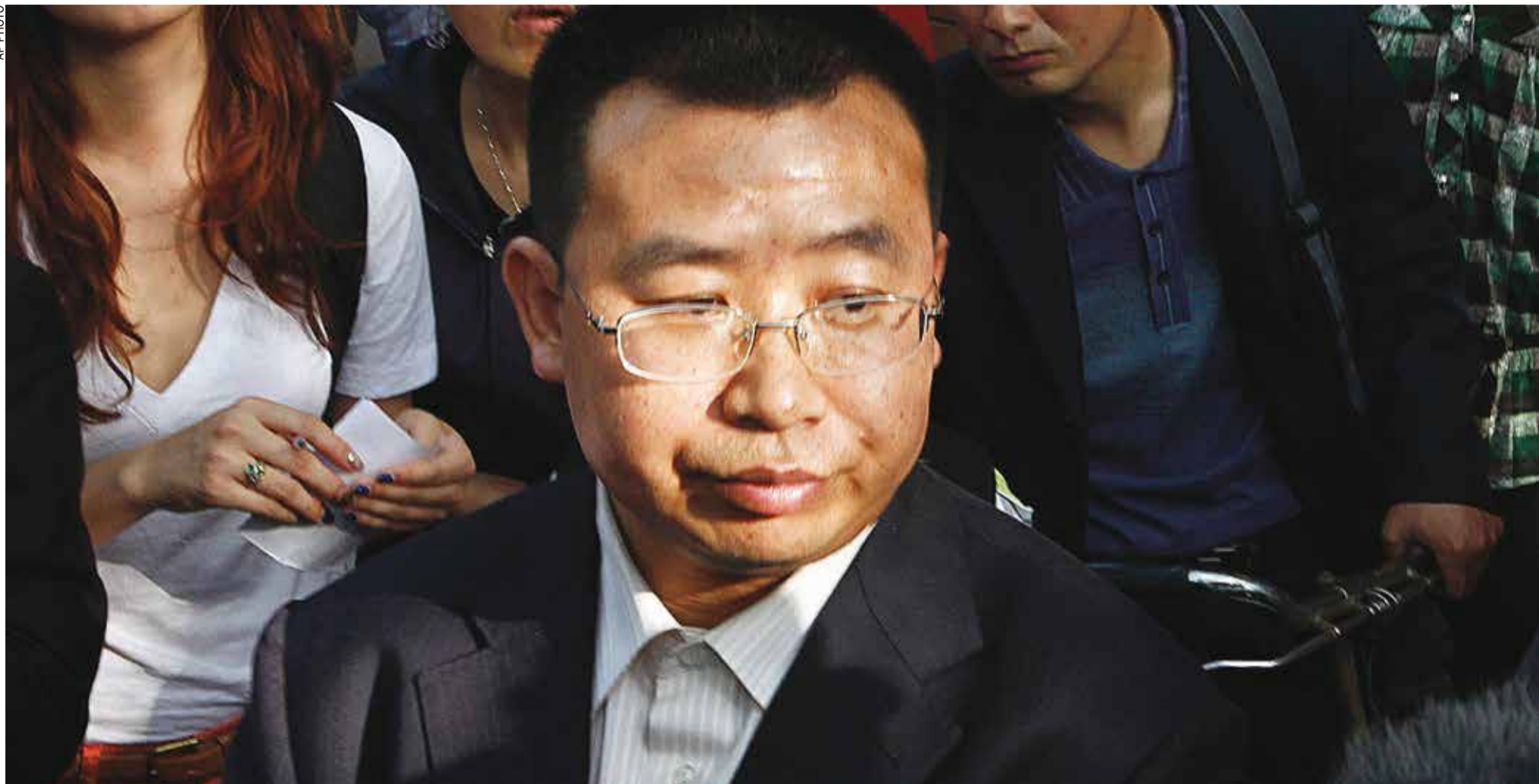
Jiang Tianyong speaks to journalists back in 2012