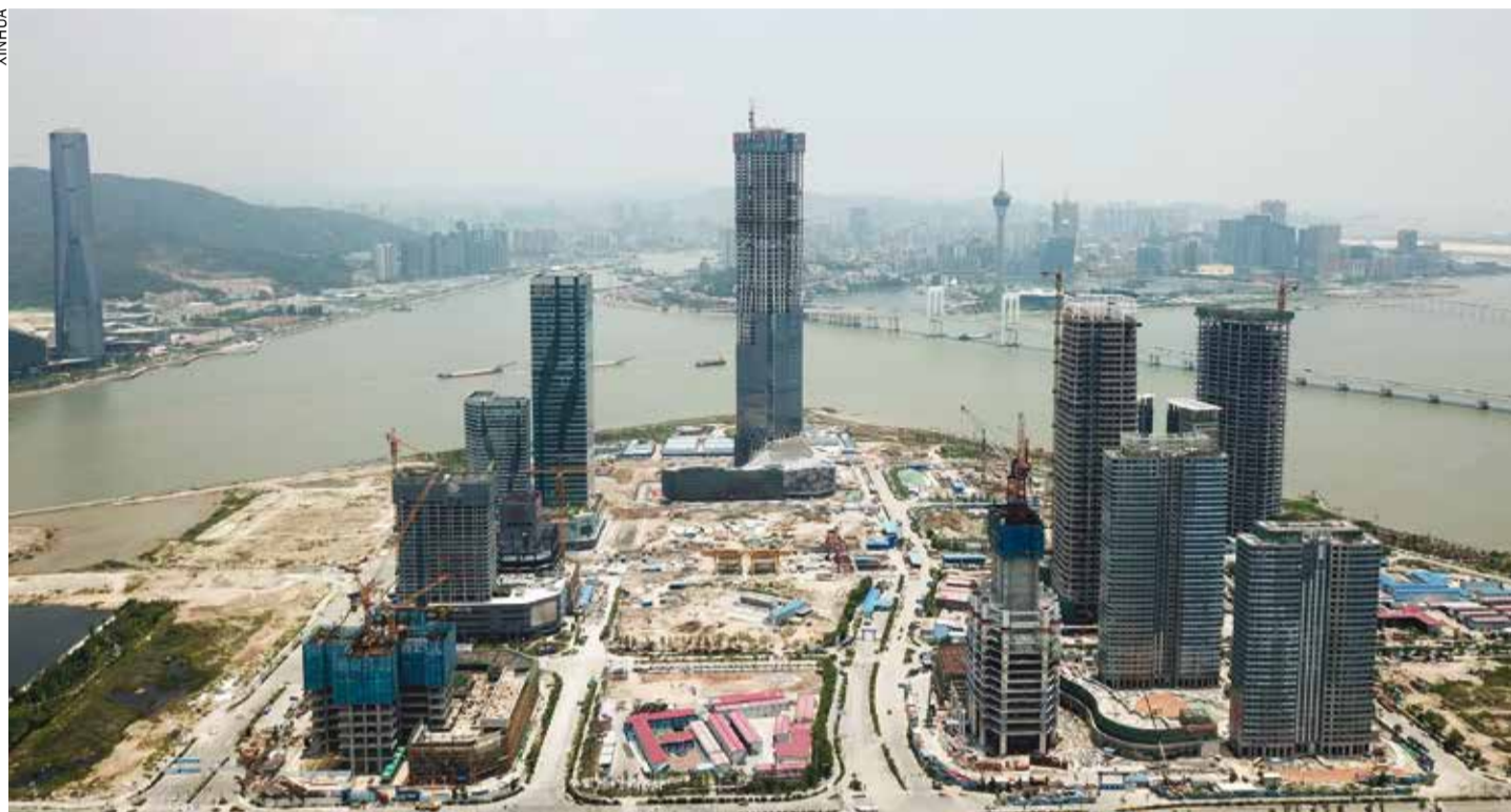
This May 23, 2018 photo shows the Hengqin New Area under construction