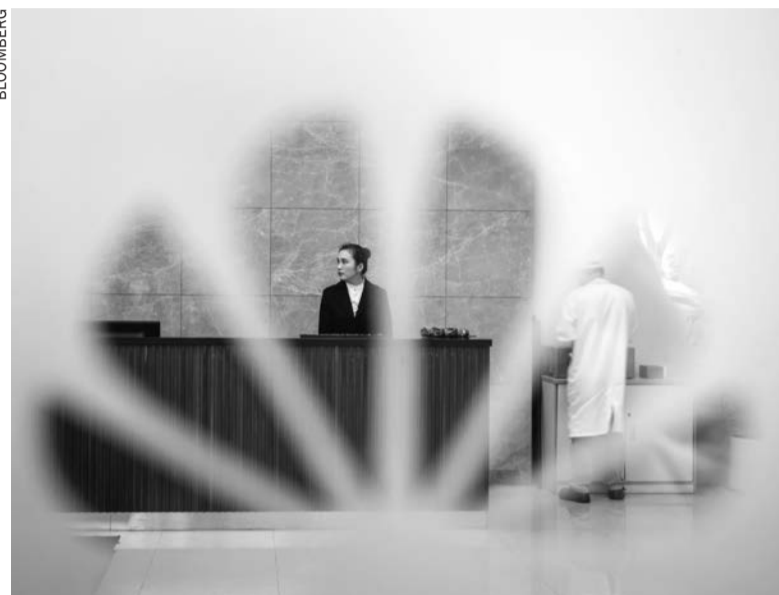
An employee is seen through a window displaying the Huawei Technologies Co. logo

Revenue from its consumer business, which includes smartphones, jumped 45 percent to 348.9 billion yuan while sales in the carrier unit were little changed at 294