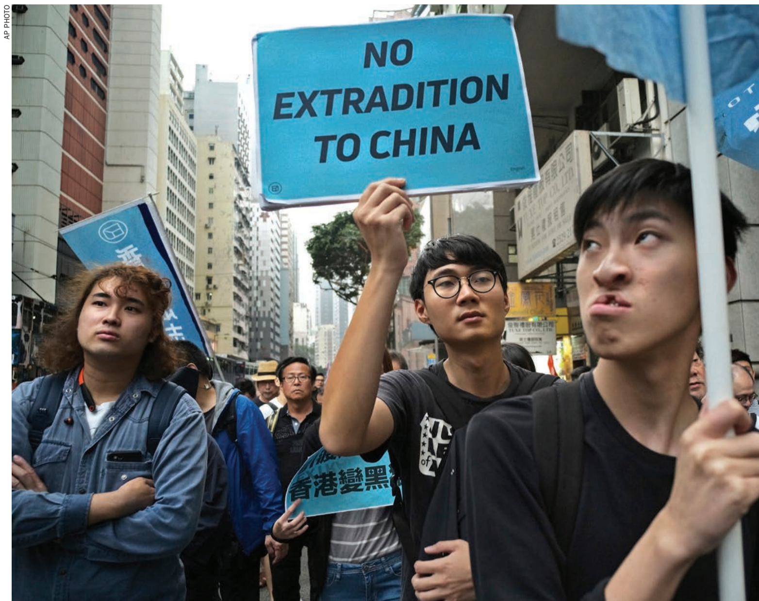
Protesters raise placards and flags against an extradition law during a march toward the government headquarters in Hong Kong yesterday

A liver disease research institute has been established in Shenzhen, integrating research resources in the Greater Bay Area, said the city's health commission. The Shenzhen institute aims to carry out comprehensive clinical diagnosis, treatment and scientific research of liver diseases, improve the diagnosis and treatment, establish an information resource bank and sample library of common liver diseases, and carry out innovative research on the diagnosis and treatment of liver diseases. Statistics from the World Health Organization show that nearly 55 percent of the world-wide patients with liver cancer came from China in 2012.