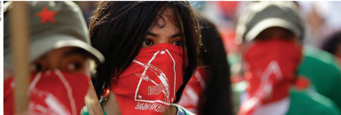
Masked members of the outlawed National Democratic Front of the Philippines, the umbrella organization of the Philippine communist movement

Human rights and farmers' groups condemned the killings of the men they said were farmers, including two village chiefs, and called for an independent investigation.