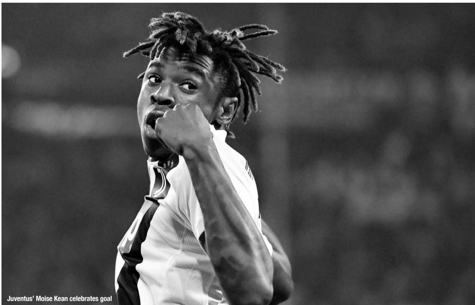
Juventus' Moise Kean celebrates goal