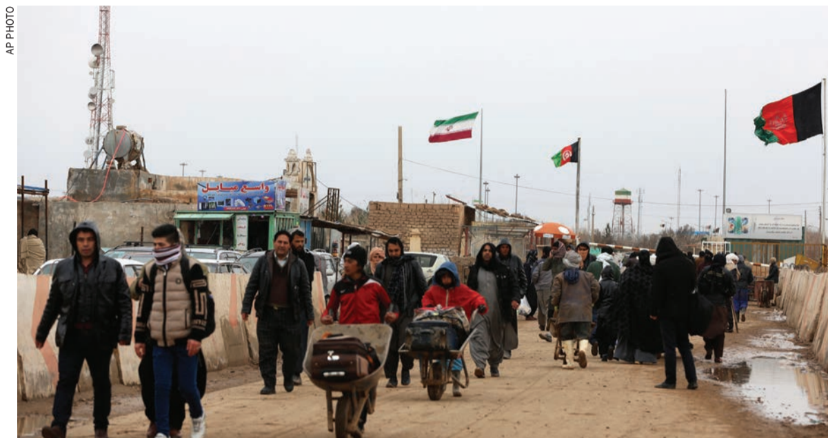
Afghans return to their country at the Islam Qala border with Iran, in the western Herat Province

Just knowing people who fought in Syria can land someone in jail, said a local elder in a village near Herat. He spoke on condition of anonymity for that reason. Eight