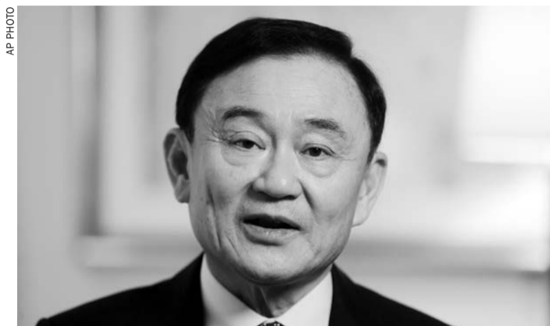
Thailand's former Prime Minister Thaksin Shinawatra

Vajiralongkorn on election eve had issued a statement urging