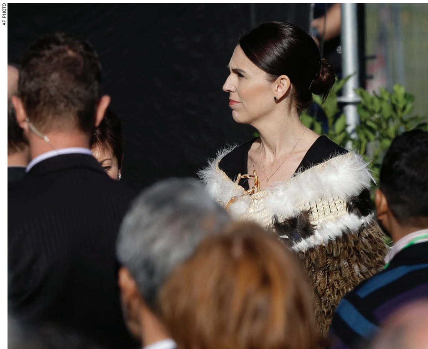
New Zealand Prime Minister Jacinda Ardern (right) arrives for a National Remembrance Service for the victims of the mosques terrorist attack in Christchurch