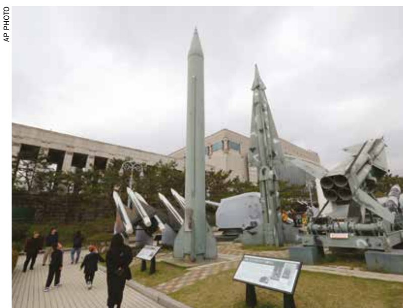
A mock North Korea's Scud-B missile (left) and South Korean missiles are displayed at Korea War Memorial Museum in Seoul

Separately, Pyongyang's Foreign Ministry accused Pompeo of playing down the significance of comments by North Korean leader Kim Jong Un, who said last week that Washington has until the end of the year to offer mutually acceptable terms for an agreement to salvage the high-stakes nuclear diplomacy. Both the demand for Pompeo's