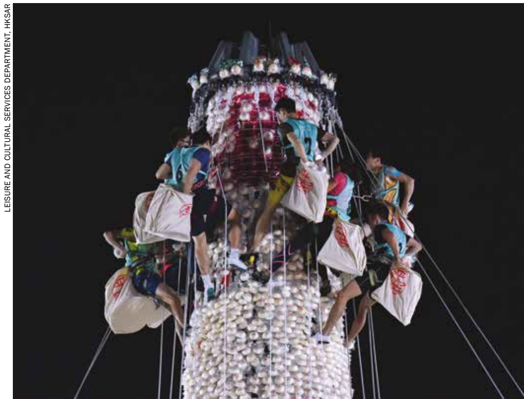
Bun Scrambling Competition