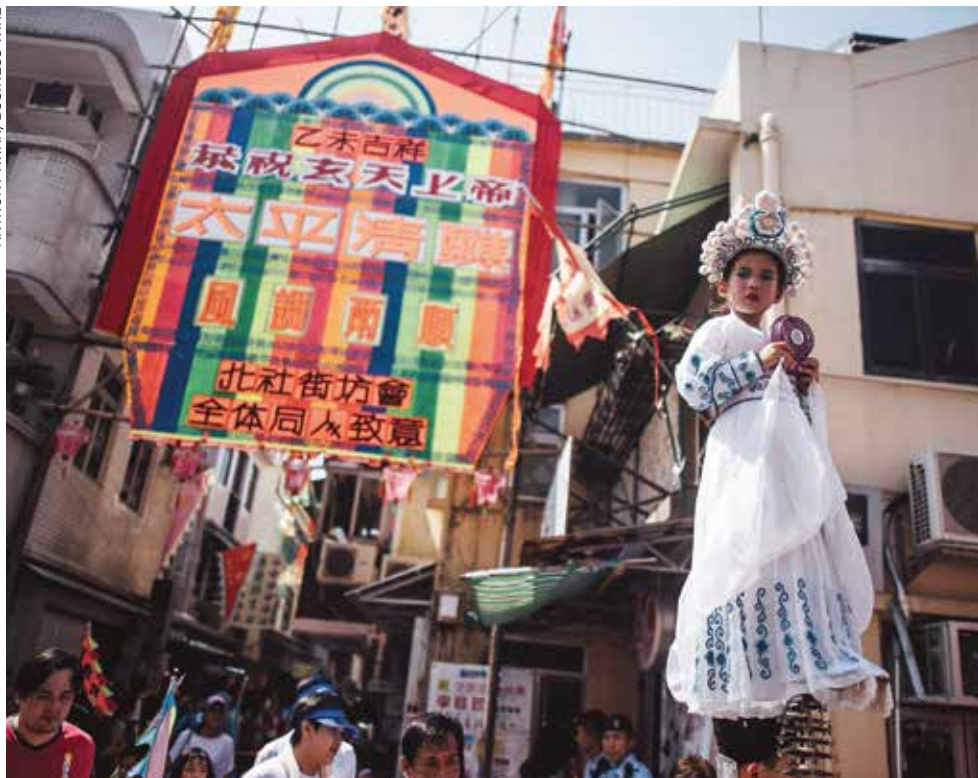
A child dressed in costume performs on a float during Piu Sik (Floating Colours) Parade