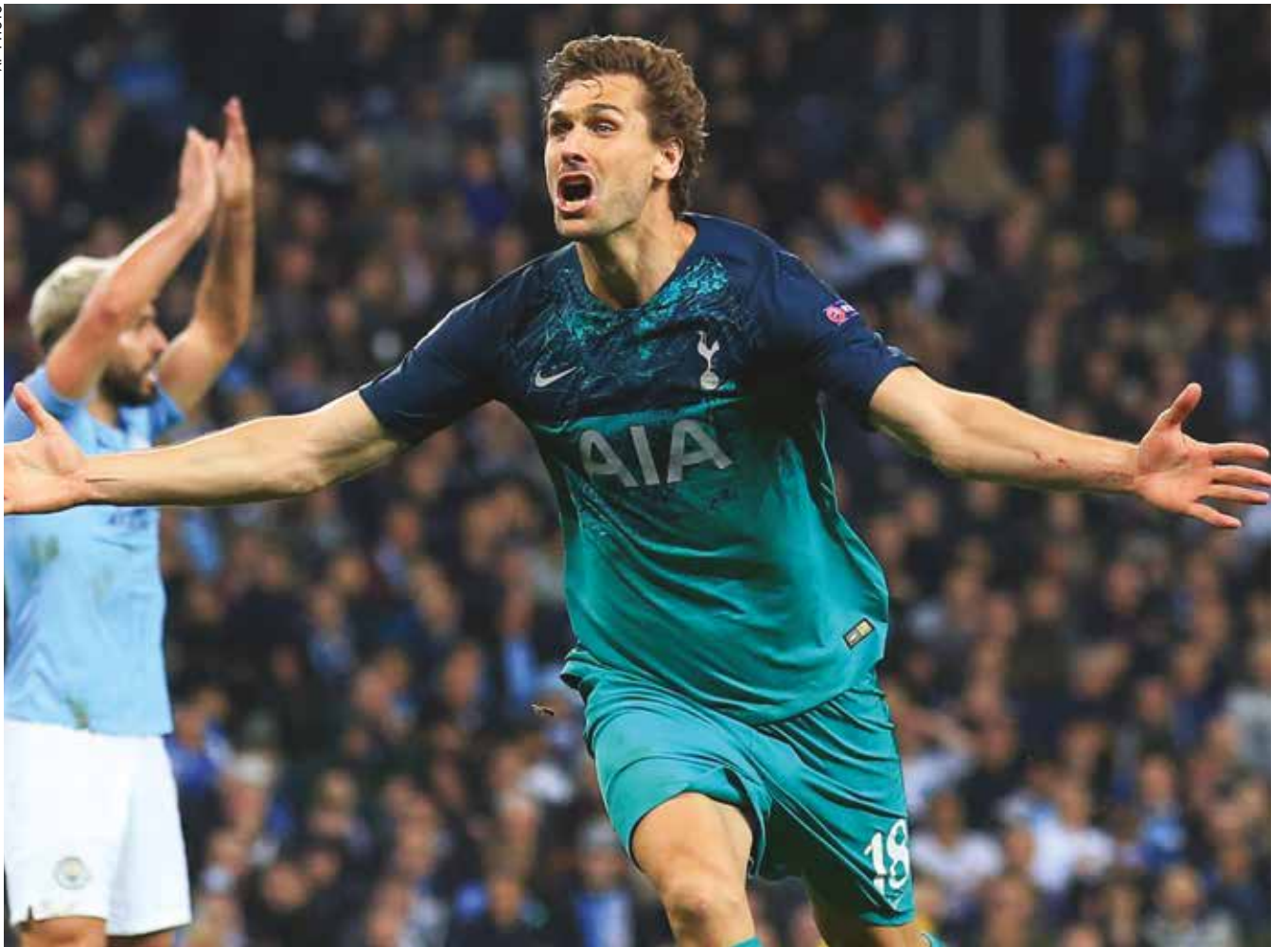
Tottenham Hotspur forward Fernando Llorente