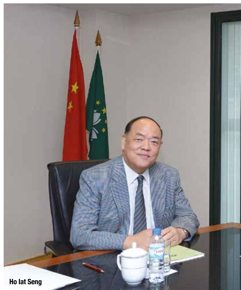
Ho Iat Seng