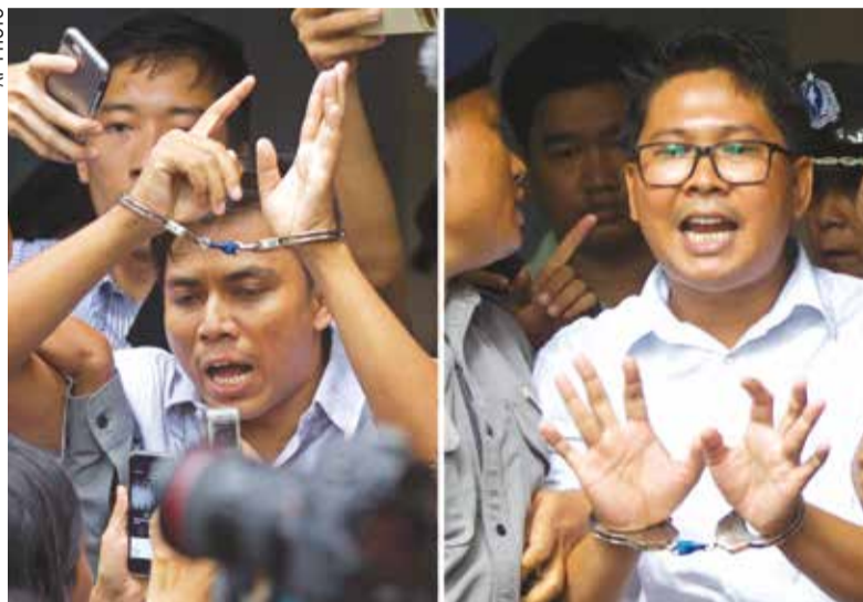
Reuters journalists Kyaw Soe Oo (left) and Wa Lone