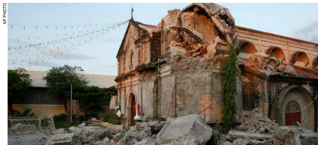
Damaged St. Catherine church is seen following a 6.1 magnitude earthquake that also caused the collapse of a commercial building in Porac township, Pampanga province yesterday