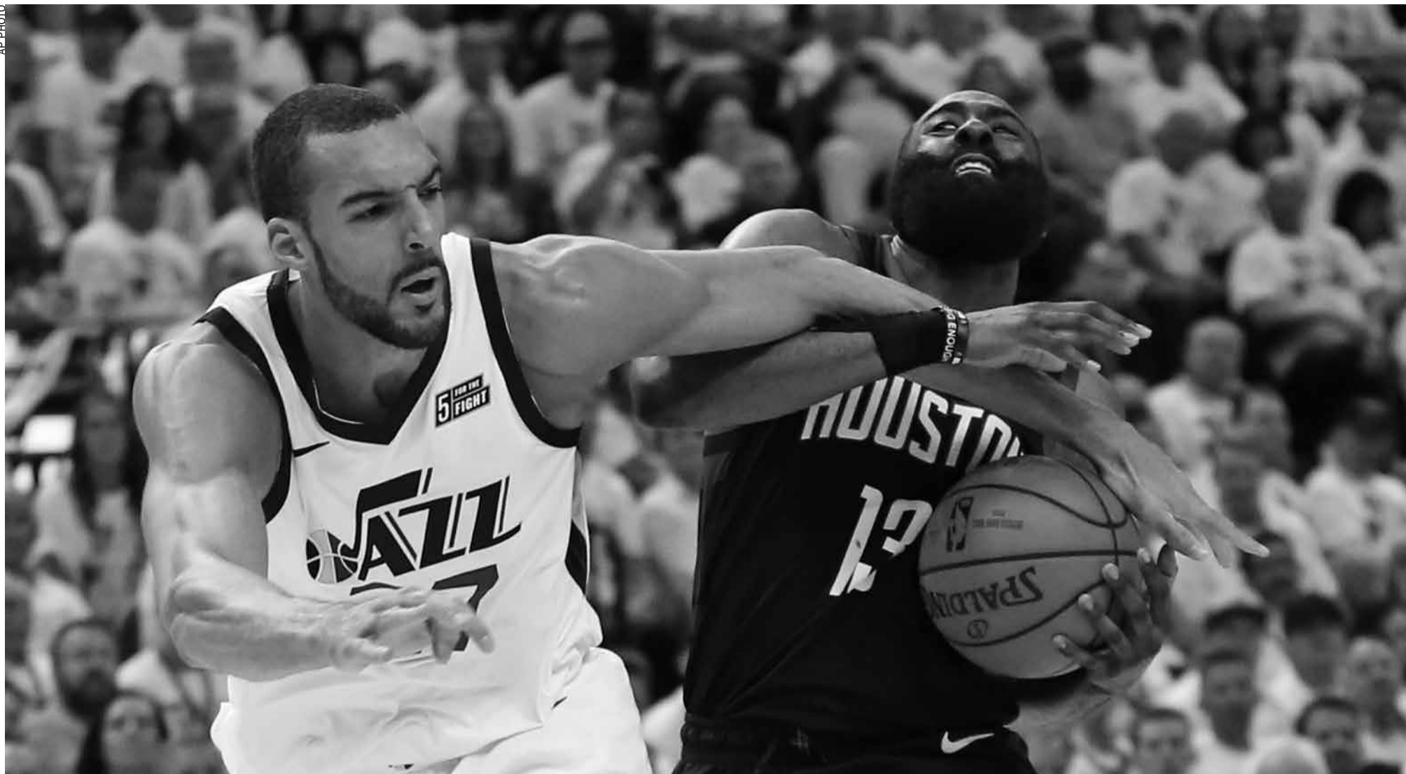
Utah Jazz center Rudy Gobert (left) fouls Houston Rockets guard James Harden (13)