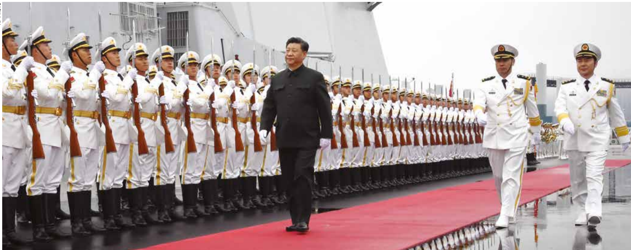
President Xi Jinping reviews an honor guard before boarding the destroyer Xining at a pier in Qingdao yesterday