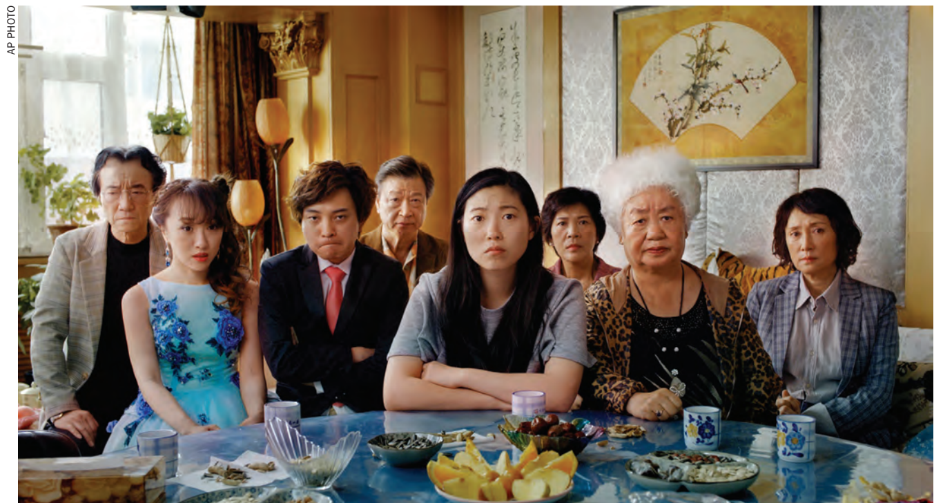
Awkwafina (center) in a scene from "The Farewell"