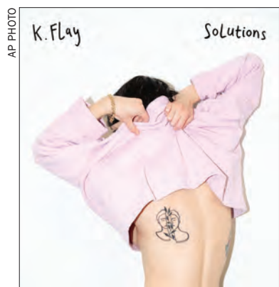
K.Flay, "Solutions" (Night Street Records)

K.Flay, whose biggest hit to date is her 2017 "Blood in the Cut," got a song on the