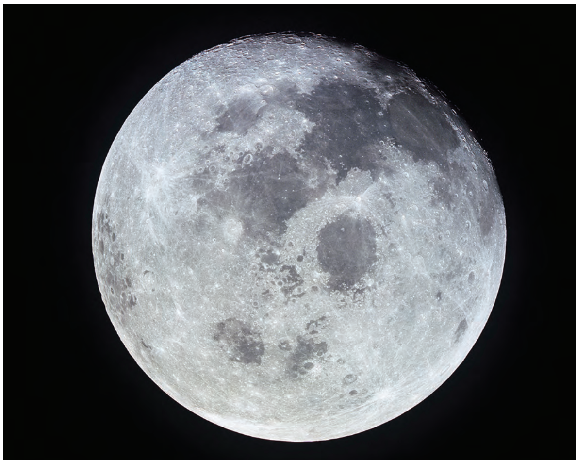
A recent sight of the moon and, above, a close-up view of an astronaut's footprint in the lunar soil, photographed with a 70mm lunar surface camera during the Apollo 11 extravehicular activity (EVA) on the moon

mistake of the old European colonial powers when it came to decide on the legal status of the moon; at least the possibility of a “land grab” in outer space giving rise to another world war was to be avoided. By that token, the moon became something of a “global commons” legally accessible to all countries – two years prior to the first actual manned moon landing.