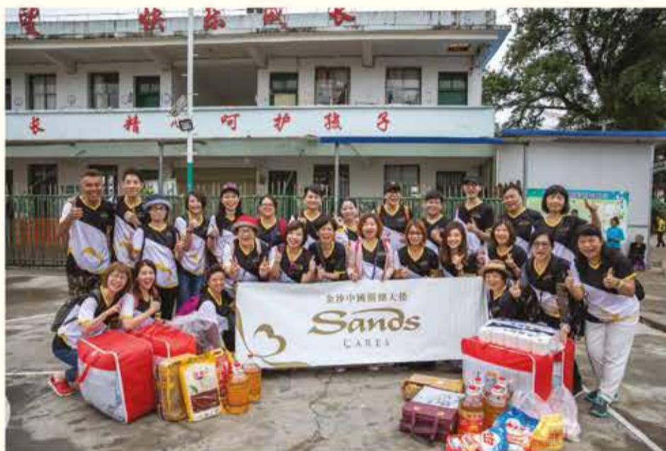
Around 30 Sands Cares Ambassadors prepare the essentials items - contributed by the Ambassadors themselves - before visiting families in Guizhou's Congjiang County.

Sands China's poverty relief efforts with Congjiang County are ongoing, and the company was the first integrated resort operator in Macao to purchase goods from the impoverished county, having received three batches of products to date, including items such as chili sauce, mineral water, and local oranges.