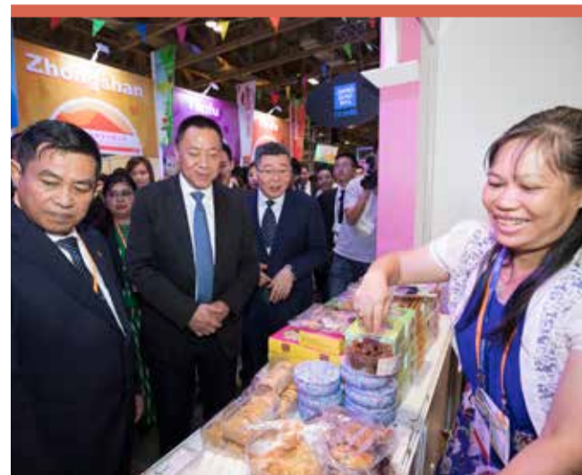
Secretary for Economy and Finance Lionel Leong tours an exhibition hall at the Guangdong & Macao Branded Products Fair

The event continues to be held concurrently with the Guangdong & Macao Branded Products Fair. On the first day, 12 agreements relating to food, the purchasing of healthy beverages, brand agencies and strategic co-operations were signed at the Fair, according to organizers, with signatories hailing from Beijing, Shanghai, Zhuhai, Macau and Taiwan. DB