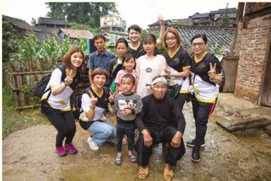
Sands Cares Ambassadors visit families at a village in the mountains of Guizhou's Congjiang County. Together they chatted, the villagers talking about their daily lives with the volunteers.