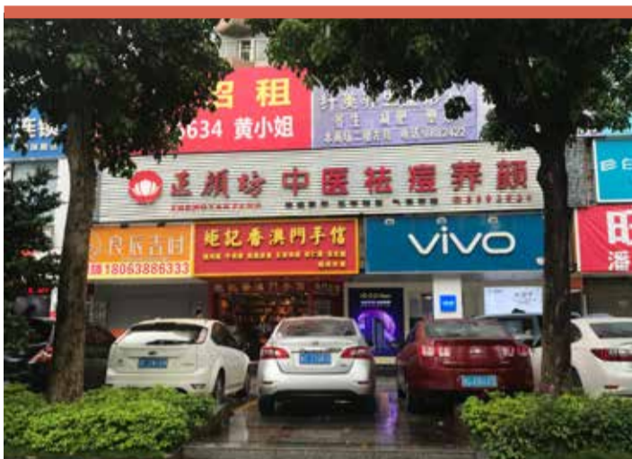
A store with a red-colored sign that reads "Koi Kei Heong" in Gongbei, Zhuhai. Despite this shop advertising itself as a Zhuhai branch, its parent company is not Macau's Koi Kei Bakery

A Koi Kei Bakery type of souvenir store, named "Imported Snacks", is located at the north side of Gongbei underground plaza, where it sells cookies and