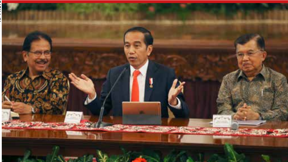
Indonesia President Joko Widodo (center), his deputy Jusuf Kalla (right) and Minister of Agrarian and Spatial Planning Sofyan Djali at a press conference in Jakarta