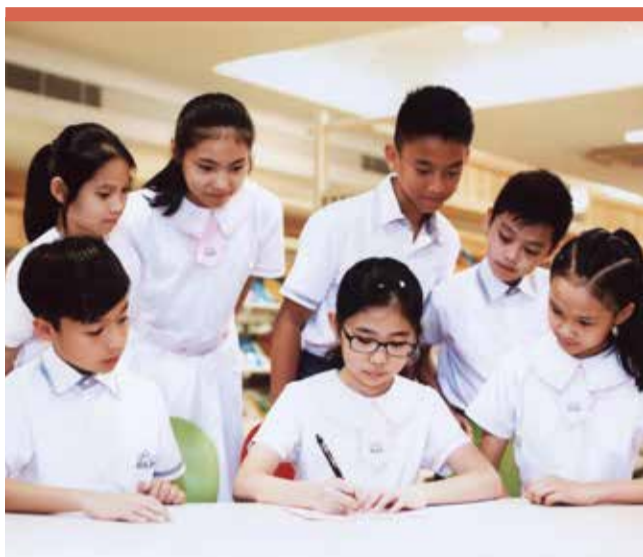
Students at Macau's Hou Kong Middle School write a letter to Chinese President Xi Jinping

A high ranking official of Macau's education authority has remarked that patriotic education cannot be forced, according to a report by public broadcaster TDM.