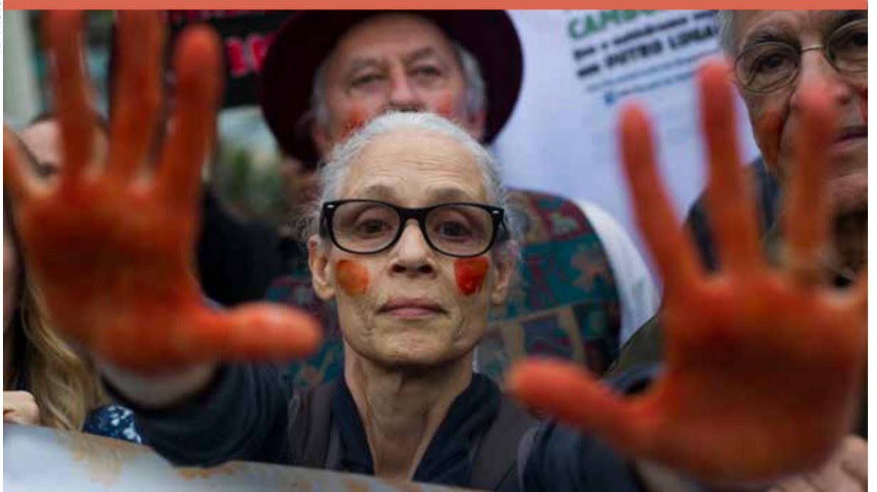
Brazilian actress Sonia Braga shows her hands painted red, representing blood, during a protest in defense of the Amazon

velopment. Critics say the record number of fires this year has been stoked by his encouragement of farmers, loggers and ranchers to speed efforts to strip away forest. Although he has now vowed to protect the area, they say it is only out of fear of a diplomatic crisis and economic losses.