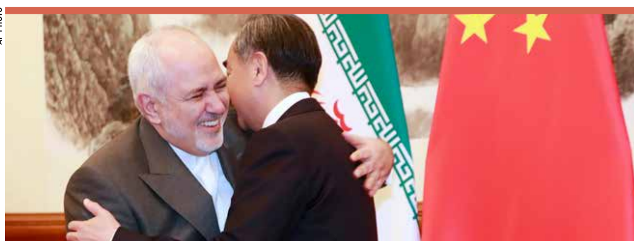
Foreign Minister Wang Yi (right) welcomes his Iranian counterpart Mohammad Javad Zarif at the Diaoyutai State Guesthouse in Beijing

His visit to Beijing comes amid heightened tensions between China and the U.S. over their spiraling trade dispute and unrest in Hong Kong that Beijing accuses Washington of encouraging or even directing. AP