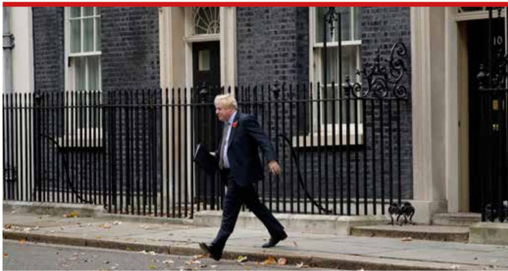
Boris Johnson walking away from 10 Downing Street