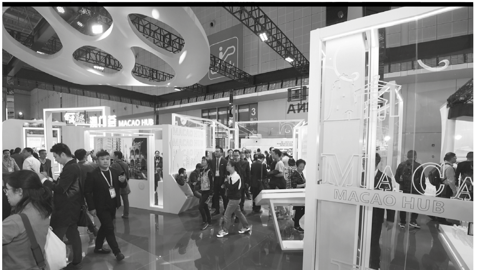
Macao Hub exhibition area, organised by the MSAR, is set up within the China Pavilion at the China International Import Expo in Shanghai

The Municipal Affairs Bureau (IAM) has issued licenses to 207 vegetable, meat and fish retail sites, IAM revealed yesterday. Between 2016 and 2019, the number of licenses issued for fresh meat retail increased 120%, from 15 to 33 licenses; for chilled meat retail, the number of licenses increased by 51%, from 71 to 107 licenses; and for frozen meat retail, the number of licenses increased by 20%, from 123 to 148. By issuing more licenses to retailers, IAM hopes to provide the public with more choices and availability, as well as to safeguard the supply of fresh food and maintain price competitiveness.