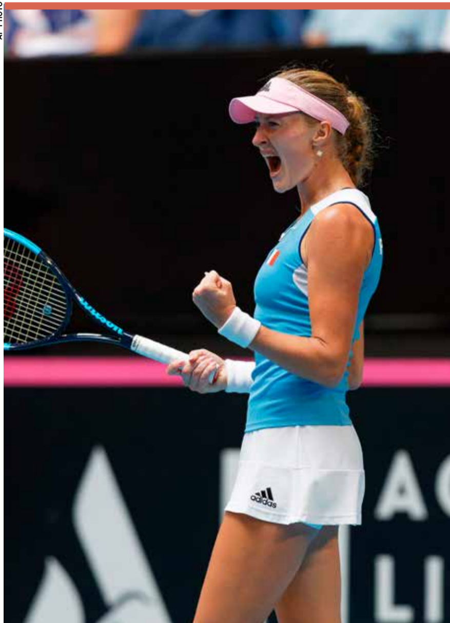
France's Kristina Mladenovic