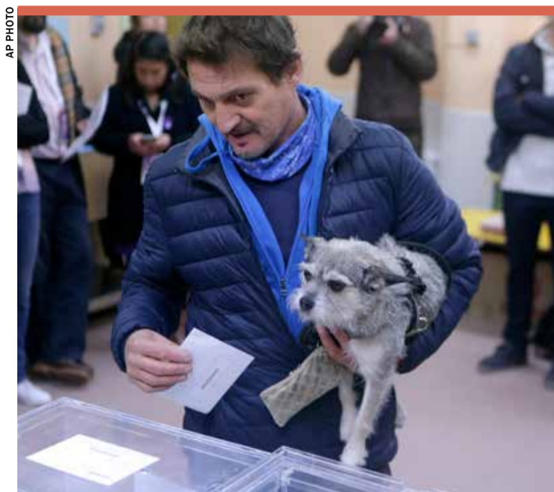
Voting booth in Madrid yesterday

Spain's four main parties have focused their campaigns on how