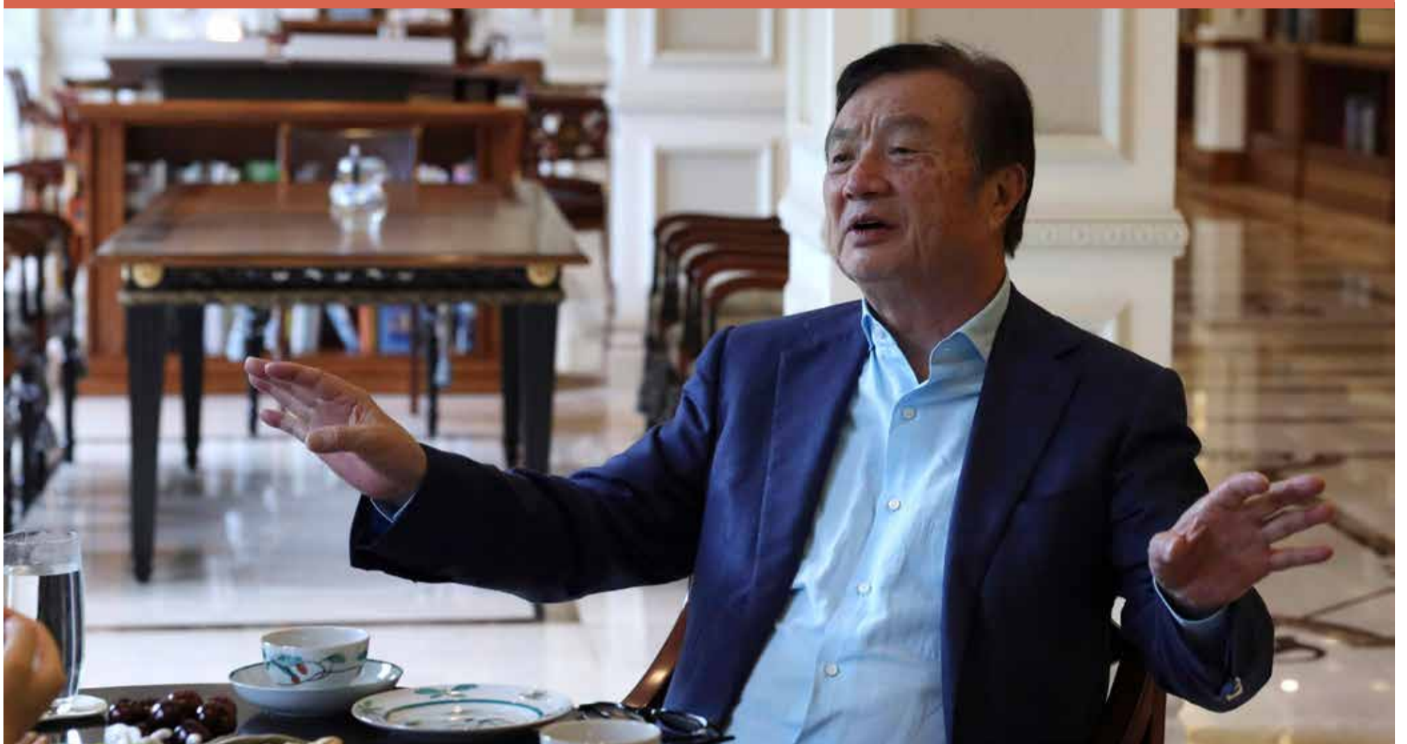
Huawei's founder Ren Zhengfei