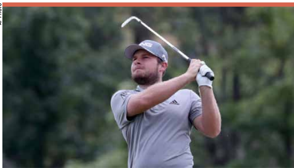
England's Tyrrell Hatton

Schwab had led by three shots going into the final round as the 24-year-old