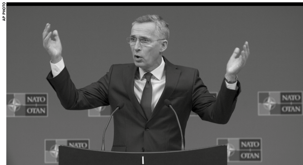
NATO Secretary General, Jens Stoltenberg

In recent months, U.S. President Donald Trump has declared that peace is nigh in Afghanistan — NATO's longest and most