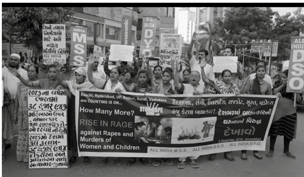
People shout slogans condemning rising cases of rape and violence against women during a protest in Ahmedabad, India, yesterday

The burned body of the 27-year-old woman was found last week by a passer-by in an underpass in the southern city of Hyderabad after she went missing the previous night.