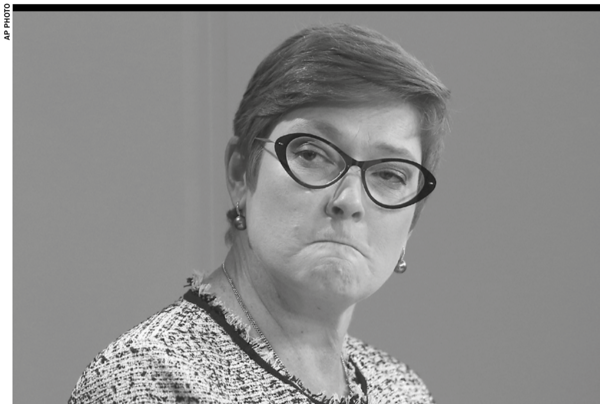
Australia's foreign minister Marise Payne attends a press conference in Sydney yesterday

At a daily briefing in Beijing, Chinese foreign ministry spokeswoman Hua Chunying said an unidentified Chinese national security body would handle Yang's case "in accordance with law and fully guarantee the various rights of the person involved."