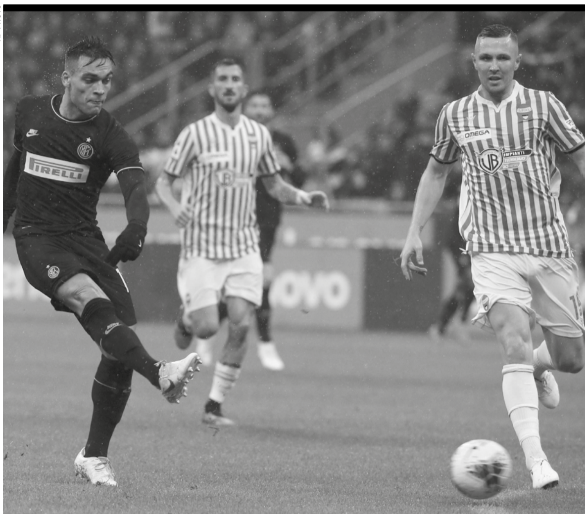
Inter Milan's Lautaro Martinez scores his side's first goal

Caputo's assist and chipped it over Buffon.