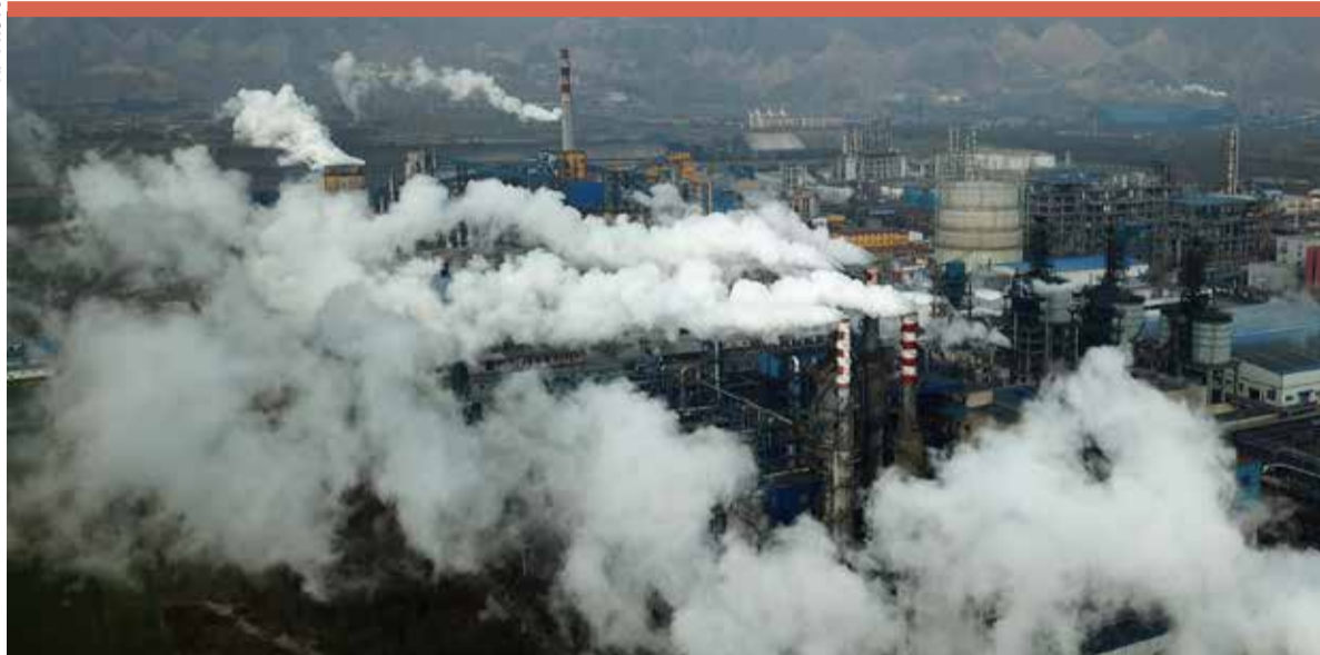
Steel manufacturing in Hejin in Shanxi Province

energy system and economy. At the same time, the country is reducing subsidies for renewable energy.