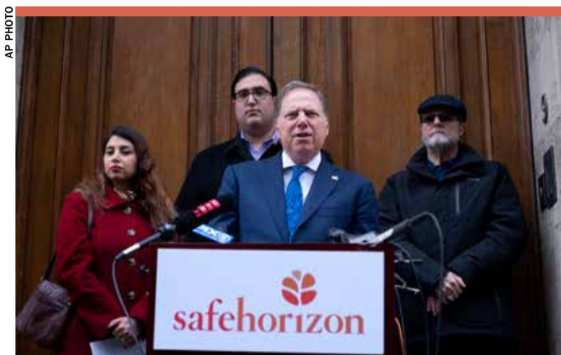
US Attorney Geoffrey Berman

Virginia Roberts Giuffre says that after meeting Epstein in Flo-