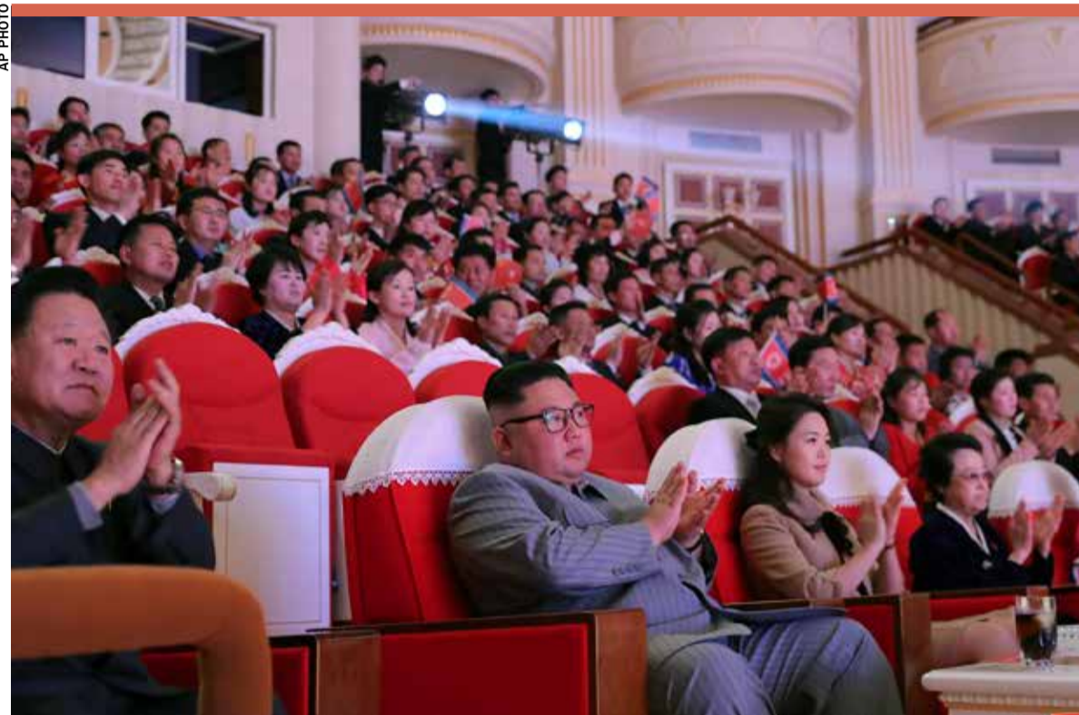
Kim Kyong Hui (right)

While taking up many top posts such as a four-star army gene-