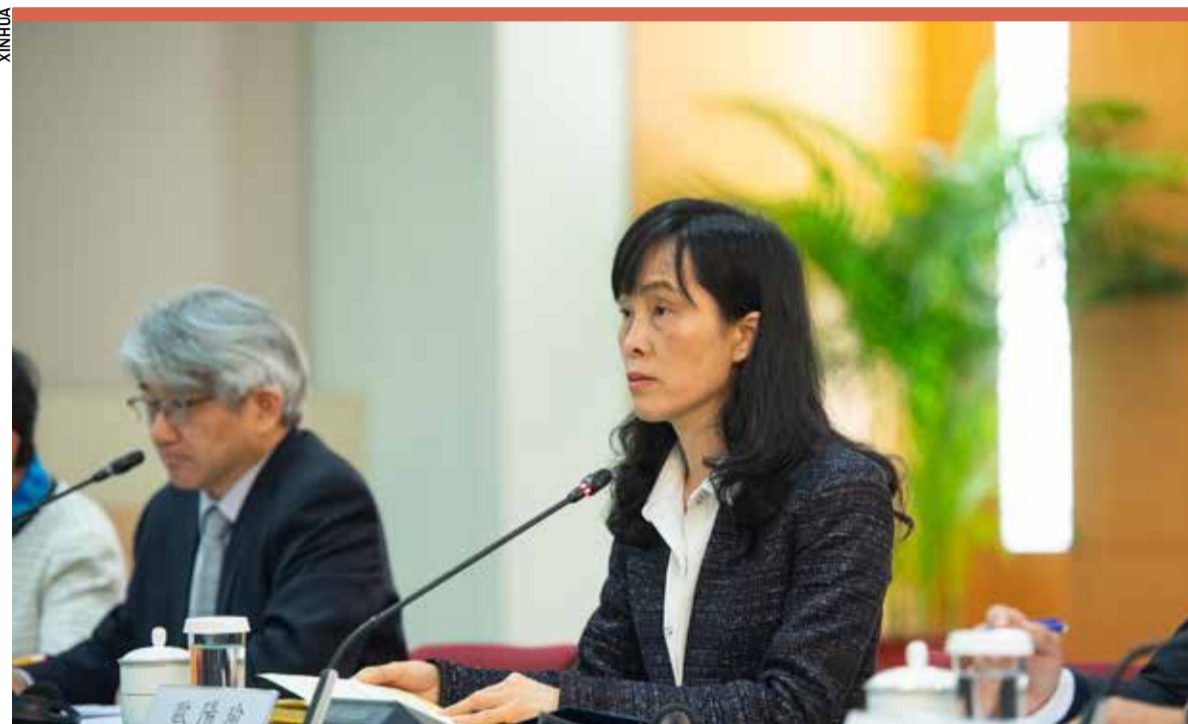
Secretary for Social Affairs and Culture, Ao Ieong U (right)

The Education and Youth Affairs Bureau (DSEJ) issued a statement earlier in the week calling all students and teachers that have spent their Spring Festival holidays in the mainland to return to the region as soon as possible, "no later than February 2." The statement also requested that af-