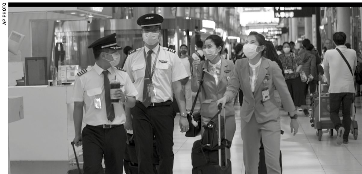
Flight crew wear protective masks as they arrive at the Suvarnabhumi Airport in Bangkok

In the new statement from the TAT, the Thai government says that the country "has now enhanced precaution and prevention measures for Covid-19," explaining that "all travelers are asked to fill in the public health declaration form and those traveling from the People's Republic of China (including Hong Kong and Macau Special Administrative Regions), Republic of Korea, Republic of Italy, and the Islamic Republic of Iran will undergo 14 days [of] quarantine when they enter the kingdom."