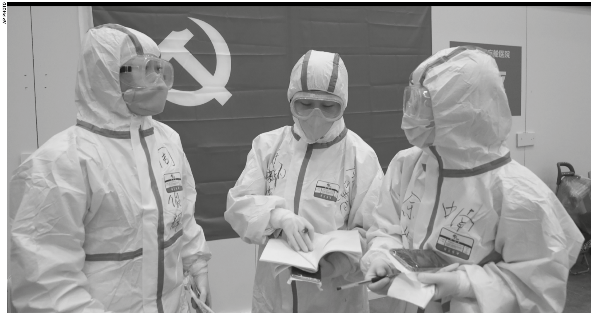
Medical workers discuss patients' treatment near a Communist Party flag at the "Wuhan Living Room", a converted temporary hospital in Wuhan