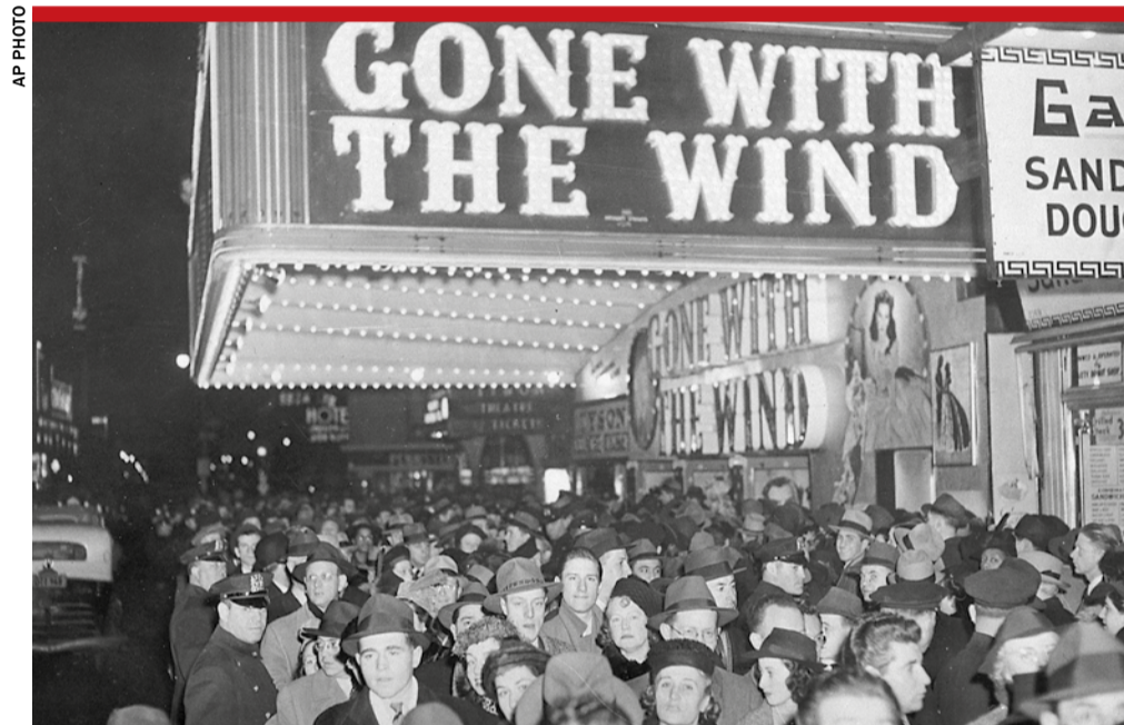
"Gone With the Wind" premieres in NYC in 1939