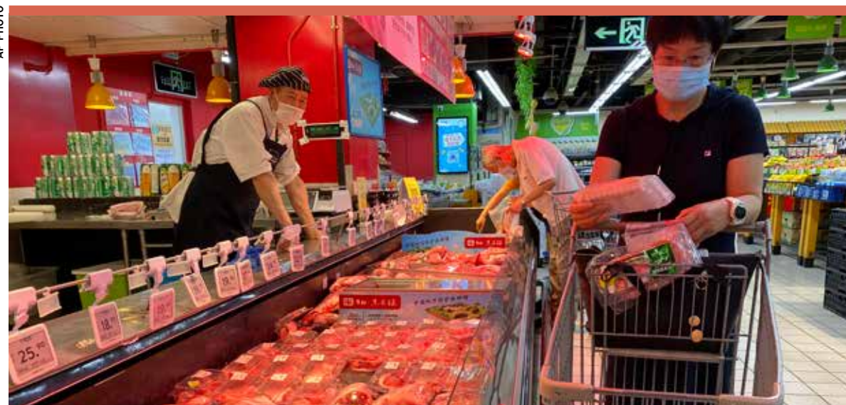
A resident wearing a face mask browses meat products at a supermarket in Beijing yesterday

India's Health Ministry reported a jump of more than 11,000 new infections nationwide for a third consecutive day yesterday.