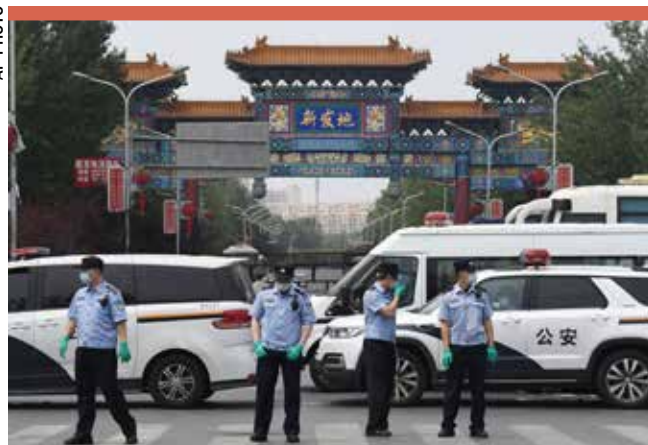
Chinese police guard the entrance to the closed Xinfadi market in Beijing

Wu Zunyou, chief epidemiologist of China's Center for Diseases Prevention and Control said that the virus can survive on the surface of frozen food for up to three months and that the agency "highly suspects" contaminated goods as the source of the latest outbreak.