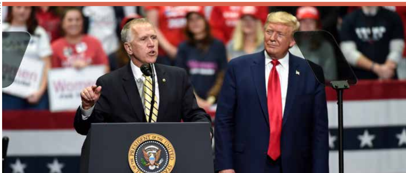
Sen. Thom Tillis, R-N.C., speaks during a campaign rally for President Donald Trump in Charlotte, N.C., in early March