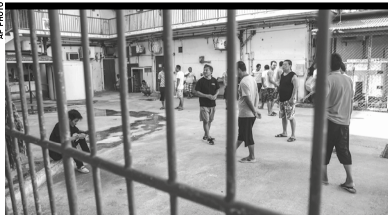
In this 2018 file photo, Chinese laborers are seen gathering in front of their living quarters before a protest about allegedly missing wages, in Saipan

But betting volumes have declined precipitously since then, and Imperial Pacific's market capitalization, which topped $8 billion at its peak in 2015, has plummeted to about $184 million today. The company's stock closed at HK$0.01 a share Friday. BLOOMBERG