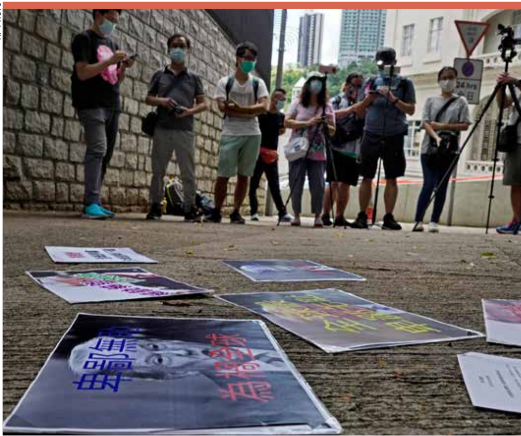
Pro-China supporters display a picture of US President Donald Trump reading "Despicable and shameless" during a protest against the US sanctions in Hong Kong