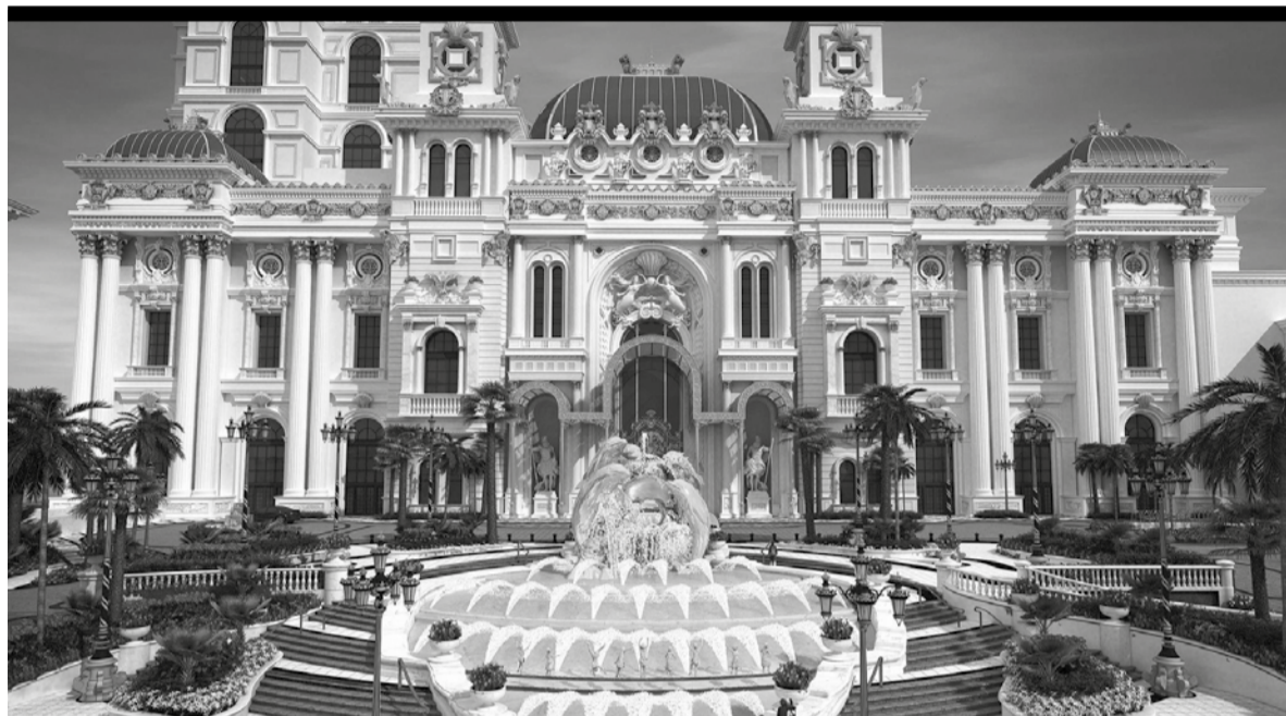
A rendering of Imperial Pacific's Grand Mariana Casino Hotel & Resort

The charges unsealed this week are the latest legal challenge confronting Imperial Pacific's business in Saipan, which was for a time one of the highest-grossing casinos in the world -- despite operating first from a nondescript storefront and then a half-finished construction site. Imperial Pacific and Metallurgical Corp. of China Ltd., which is one of China's biggest state-owned construction businesses and owned the subsidiary unit in Saipan, are not accused of