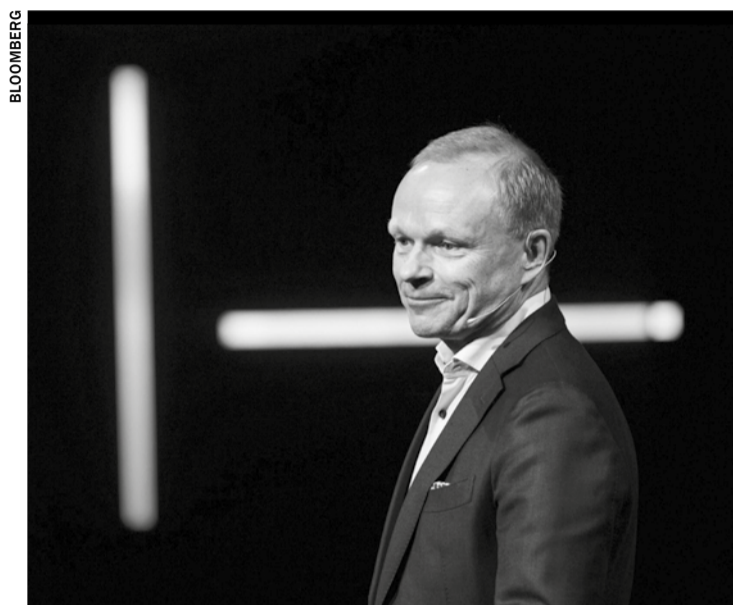
Nokia Oyj Chief Executive Officer Pekka Lundmark

U.S. President Donald Trump's administration has been pressuring allies against using Huawei's equipment, which it argues