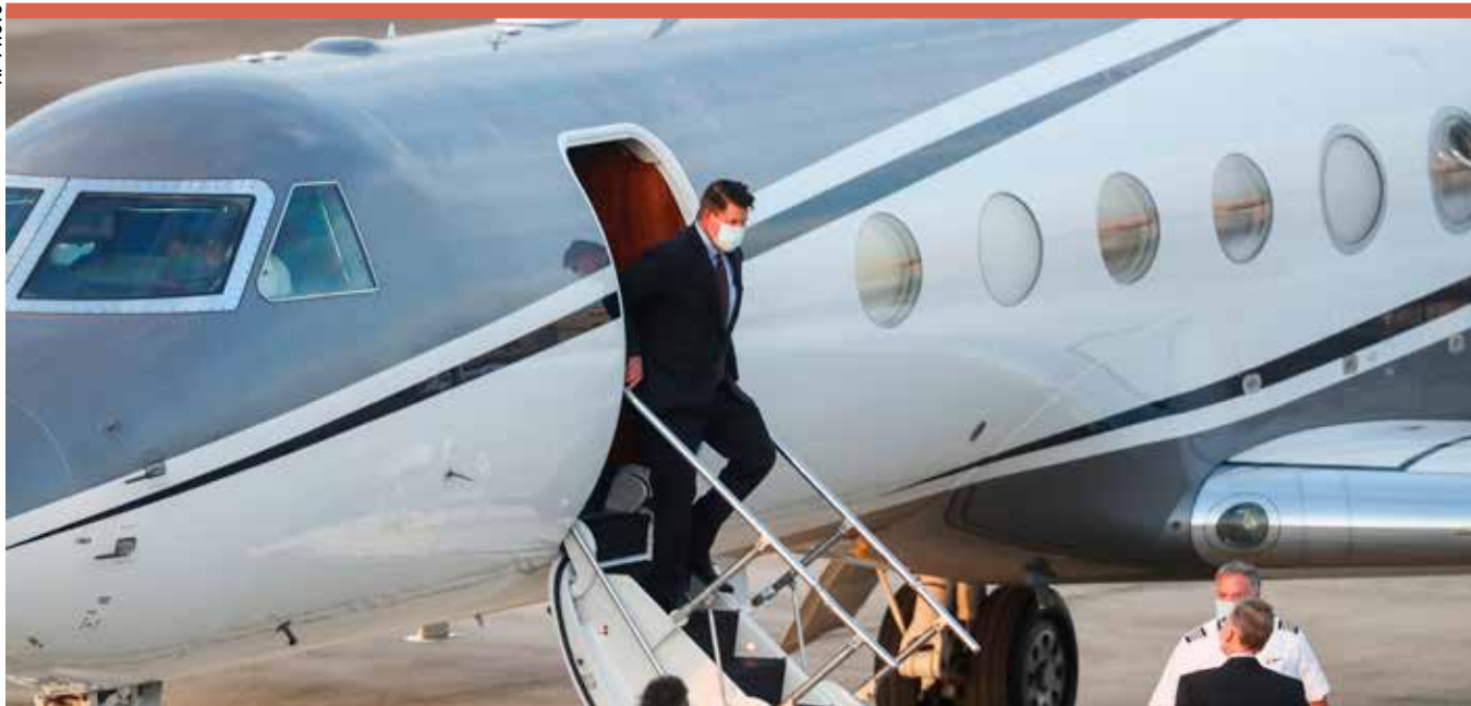
U.S. Under Secretary of State Keith Krach exits a plane upon arrival at the air force base airport in Taipei