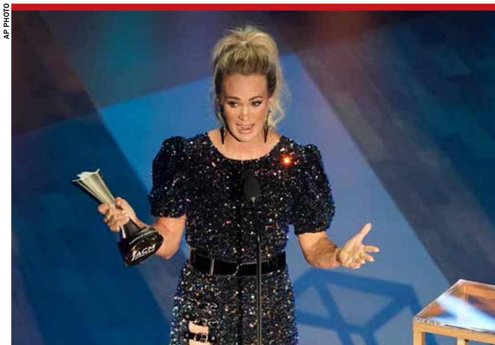
Carrie Underwood accepts the entertainer of the year award in a tie with Thomas Rhett