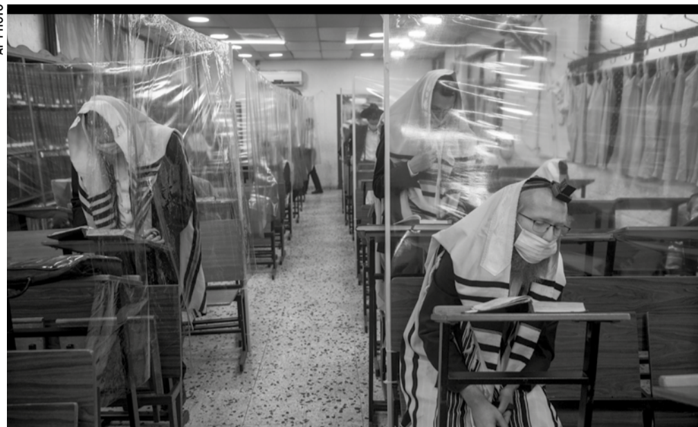
Ultra-Orthodox Jews wear face masks during a morning prayer in a synagogue separated by plastic partitions, in Bnei Brak, Israel

The collection — titled "Havieni Hadarav," Hebrew for "Bring me to his chambers" — is one of many pamphlets, books, radio