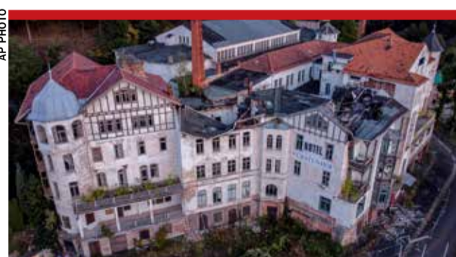
The abandoned and wrecked "Fuerstenhof" hotel is seen in Eisenach, eastern Germany

upmarket — though still spartan by Western standards — Wartburg.