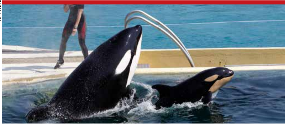
Killer whale "Wikie", jumps with its baby, a female born one month ago at the Marineland aquatic park in Antibes, southeastern France

FRANCE'S environment minister has announced a gradual ban on using wild animals in traveling circuses, on keeping dolphins and killer whales in captivity in marine parks and on raising mink on fur farms.