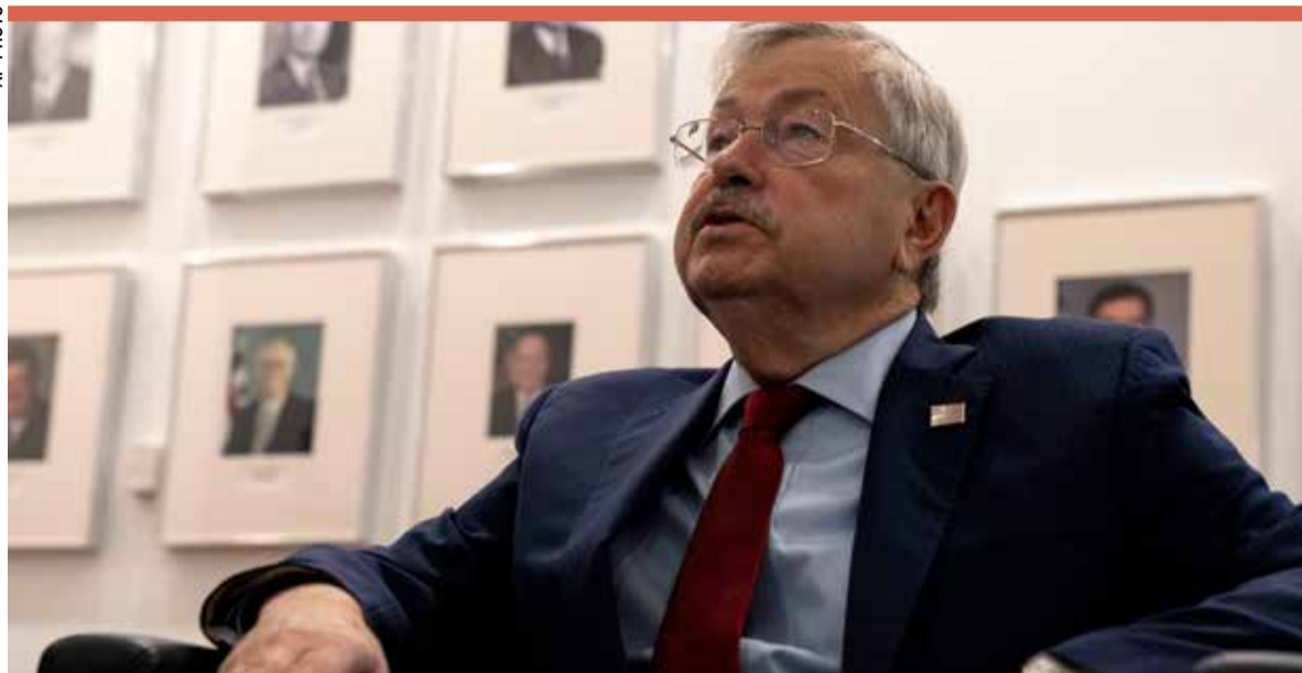
U.S. Ambassador to China Terry Branstad speaks during an interview at the U.S. embassy in Beijing yesterday

ts; closed the Chinese consulate in Houston and repeatedly criticized China on multiple fronts.