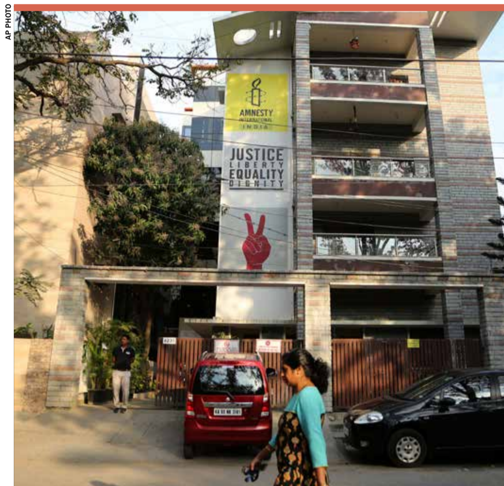
the Amnesty International India headquarters in Bangalore, India

It is not the first time that Amnesty India has said Indian authorities targeted its operations. In 2018, Indian authorities raided its office and froze its bank accounts on similar charges.