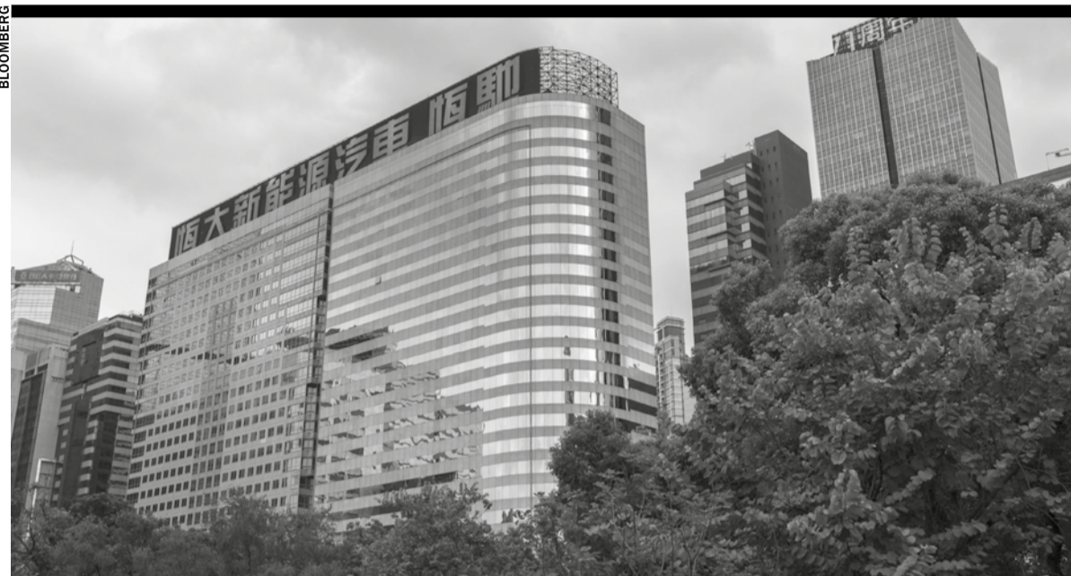
The China Evergrande Centre in Hong Kong

Relief over Evergrande's announcement late yesterday in Hong Kong helped propel one of the company's dollar bonds to its biggest gain since March, though