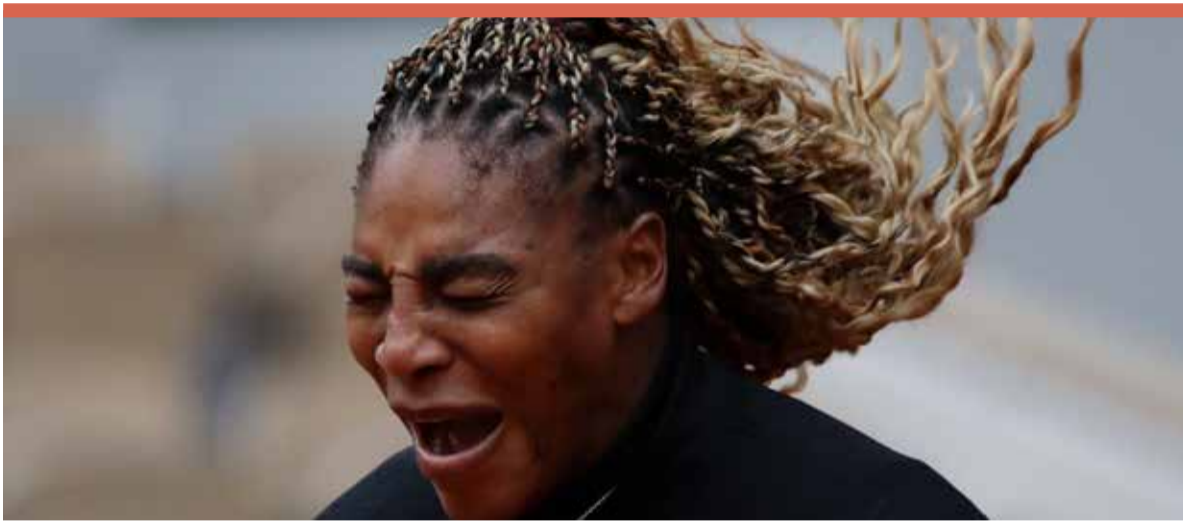
Serena Williams of the U.S. screams in the first round match of the French Open

different," he said, "than any other Roland Garros that we played."