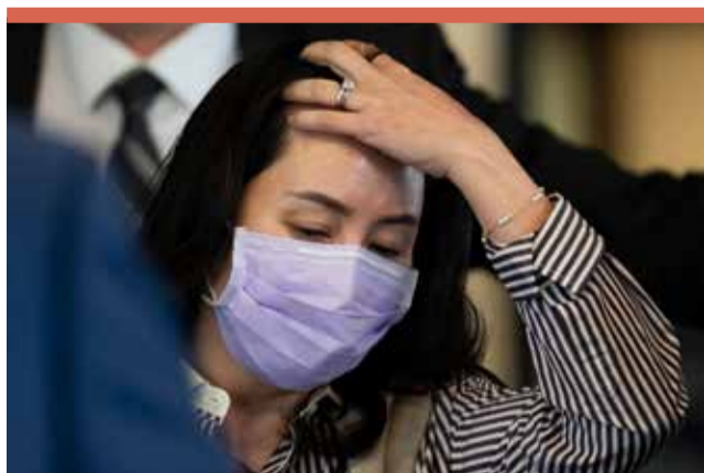
Huawei CFO Meng Wanzhou leaves B.C. Supreme Court in Vancouver, British Columbia

violation of U.S. sanctions. It says Meng, 48, committed fraud by misleading the HSBC bank about the company's business dealings in Iran.