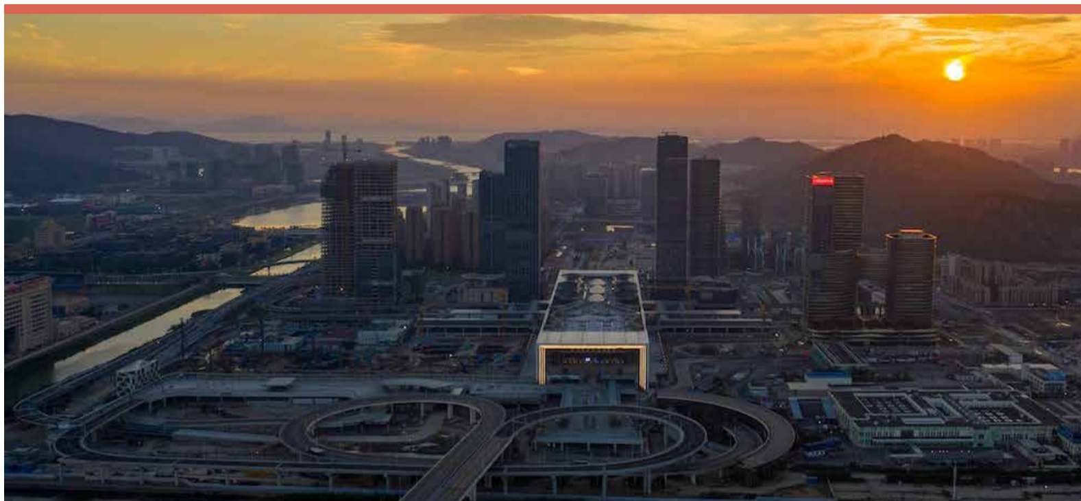
Sunset over neighboring Hengqin

To commemorate the 75th anniversary of the passing of Chinese composer Xian Xinghai, the Cultural Affairs Bureau (IC) will host a series of activities at the Xian Xinghai Memorial Museum. These will include film screenings, ukulele workshops, special offers for relevant publications and additional guided tours, to deepen the public's understanding of the musician's life, artistic achievements and patriotic spirit. The Composer, a film about Xian Xinghai, is the first cinematic collaboration between China and Kazakhstan. The film is adapted from Xian's experience in Almaty during the final years of his life. Screenings will be held on October 26, 30 and 31 between 3 p.m. and 5 p.m.