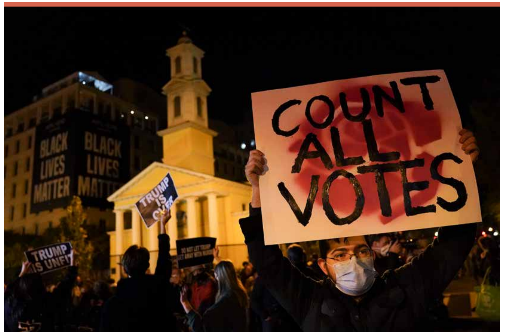
A demonstrator holds up a sign while waiting for election results at Black Lives Matter Plaza in Washington

Democrats typically outperform Republicans in mail voting,