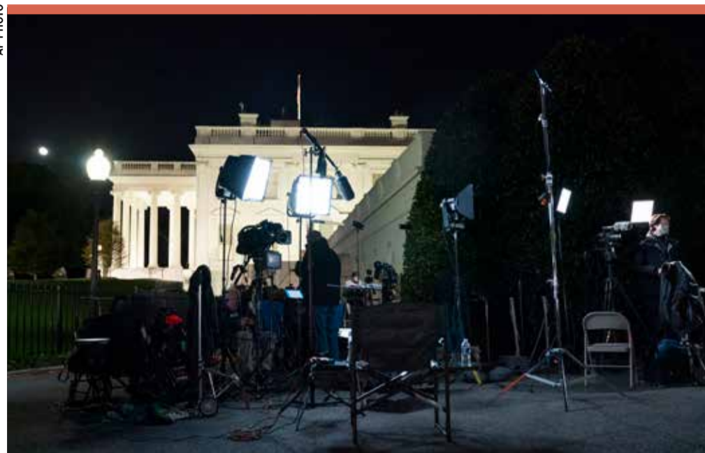
Members of the news media work outside the West Wing of the White House, election night

Biden had spoken to supporters at 12:42 a.m. in Delaware, expressing confidence in his campaign and saying he wanted to see every