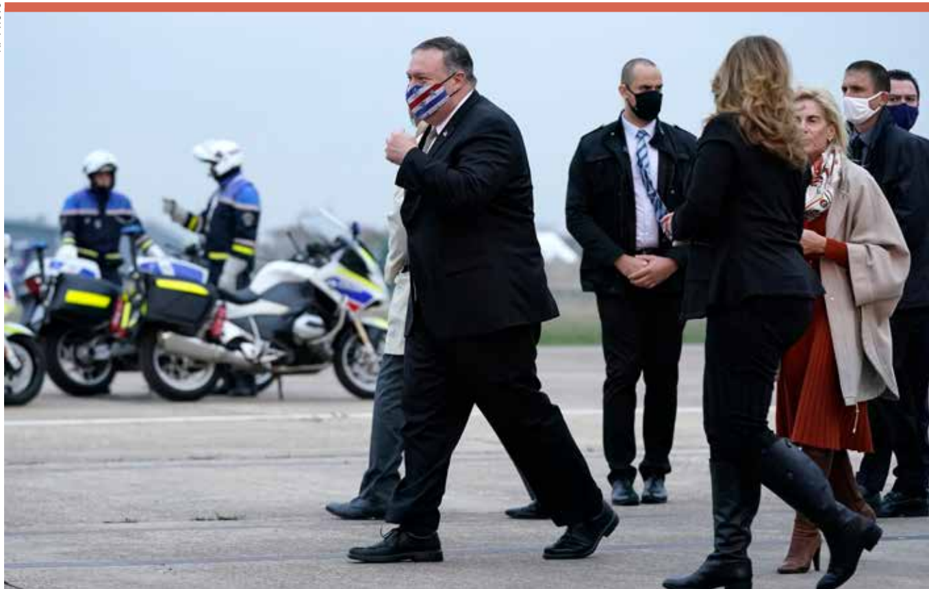
Secretary of State Mike Pompeo (left) walks to a motorcade vehicle after stepping off a plane at Paris Le Bourget Airport