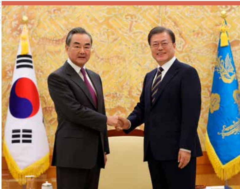
Moon Jae-in (right) and Wang Yi at the presidential Blue House in Seoul yesterday

tions," he said. "They include China and South Korea, which are close neighbors and should visit each other more often, like relatives."