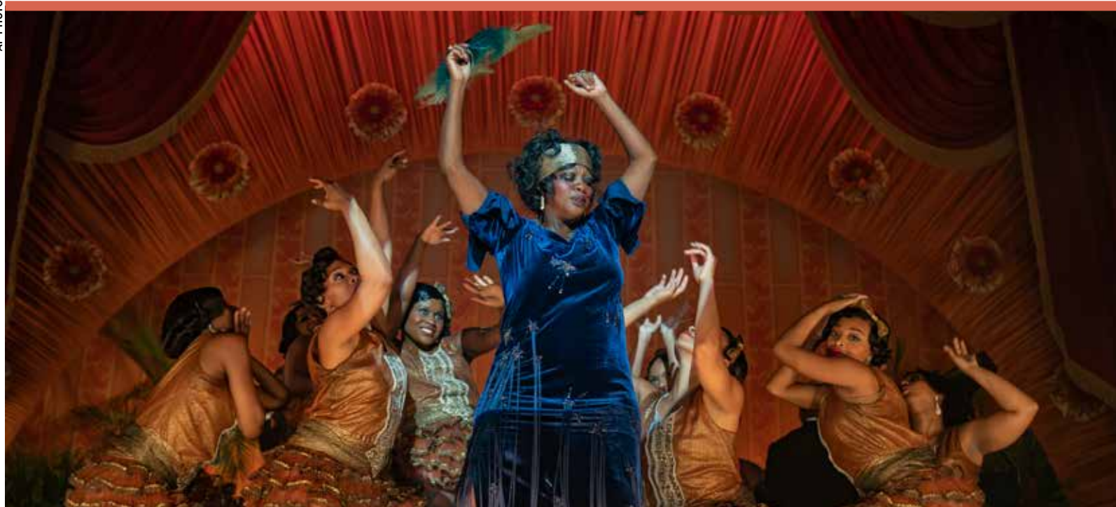
Viola Davis in "Ma Rainey's Black Bottom"