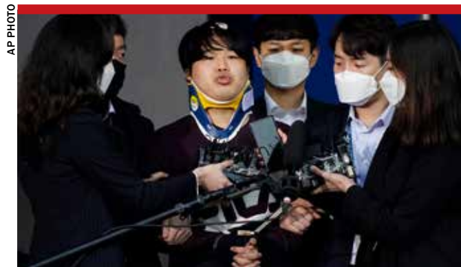
Cho Ju-bin (center) leader of South Korea’s online sexual blackmail ring so called “Nth room”

Both Cho and prosecutors, who had requested a life