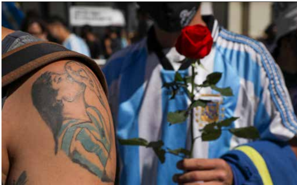
Maradona. A mourner, sporting a tattoo of Diego Maradona on his forearm, waits in line to pay his final respects to the soccer great Diego Maradona lying in state outside the presidential palace in Buenos Aires yesterday.