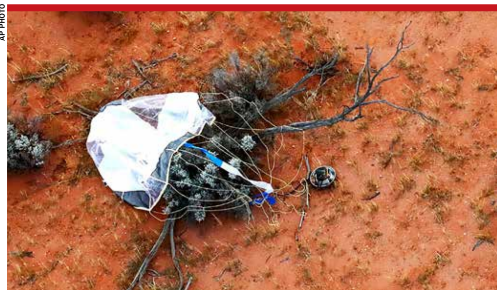
The capsule, dropped by Hayabusa2 is seen before being retrieved in southern Australia

JAPANESE space officials said they are excited about the return of a capsule that landed safely in the Australian Outback on Sunday while carrying soil samples from a distant asteroid, and that they are eager to begin analyzing the "treasure" inside.