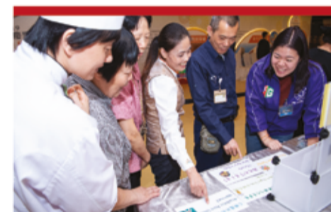
Team members attended a roadshow jointly organized by GEG and the Macau Youth Volunteer Association before the Lunar New Year to learn about all required health and safety guidance during the pandemic.

GEG is a pioneer in promoting responsible gaming as the first gaming operator to establish a dedicated responsible gaming team in Macau since 2008. Over the years, GEG continues to jointly work with relevant government bodies, academic groups, social service institutions and gambling disorder prevention centers to put responsible gaming measures into practice to build a responsible gaming culture in our society. Since the launch of responsible gaming promotion, GEG has organized a host of activities, attracting over 70,000 team members to participate in its trainings, roadshows, visits, seminars and workshops with its employee-oriented responsible gaming Initiatives. GEG also spreads heartfelt messages of support to team members around the festive seasons