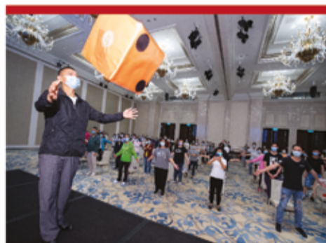
GEG launched over 50 sessions of "Responsible Gaming Program Workshop" from June to August, providing more than 40,000 training hours for over 5,000 team members.

A responsible gaming culture not only contributes to the industry's health, but helps support the health and well-being of employees and their families. Galaxy Entertainment Group (GEG) is committed to promoting responsible gaming, making it a fundamental part of its corporate social responsibility by continuously enhancing team members' understanding and awareness of the topic. This year's theme is "family", a series of activities is successfully held to promote and sustain a responsible gaming culture by cooperating with several social service organizations to organize a wide range of