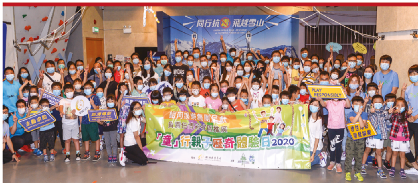
GEG title sponsored BYSS in organizing the "Parent-Child Day Out in Adventures 2020" event, delivering responsible gaming messages to the community through the innovative 'learning together' parent-child teaching approach.

A responsible gaming culture not only contributes to the industry's health, but helps support the health and well-being of employees and their families. Galaxy Entertainment Group (GEG) is committed to promoting responsible gaming, making it a fundamental part of its corporate social responsibility by continuously enhancing team members' understanding and awareness of the topic. This year's theme is "family", a series of activities is successfully held to promote and sustain a responsible gaming culture by cooperating with several social service organizations to organize a wide range of