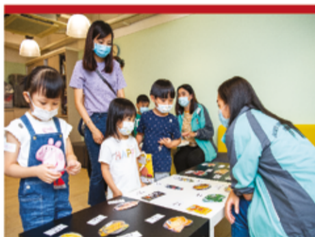
GEG and SKH co-organized a parent-child themed "Family Fun: Money Management Workshop", of which more than 30 team members and their family members attended.

ships" workshops as well as the "Game Fun with Responsible Gaming 2020",