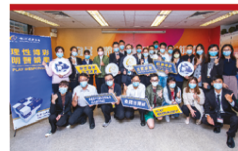
The S.K.H. Macau Social Services Coordination Office was invited to arrange a "Your Ideal Home" seminar at the 8th GEG Responsible Gaming Awareness Week.

GEG is a pioneer in promoting responsible gaming as the first gaming operator to establish a dedicated responsible gaming team in Macau since 2008. Over the years, GEG continues to jointly work with relevant government bodies, academic groups, social service institutions and gambling disorder prevention centers to put responsible gaming measures into practice to build a responsible gaming culture in our society. Since the launch of responsible gaming promotion, GEG has organized a host of activities, attracting over 70,000 team members to participate in its trainings, roadshows, visits, seminars and workshops with its employee-oriented responsible gaming Initiatives. GEG also spreads heartfelt messages of support to team members around the festive seasons