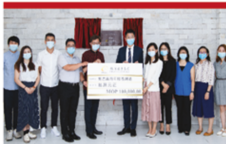
GEG made a donation of MOP100,000 to BYSS in support of its start-up of the "FREEland" gambling addiction prevention services.

In addition to educating team members and helping them to explore how individual choices can impact their families, GEG also strengthened its collaboration with the community to support young people and their families to create a healthy life attitude to resist impulses to gamble. Recently, GEG made a donation to the Bosco Youth Service Network ("BYS") in support of its launch of a new service "FREEland" for the community works to support teens in gambling addiction