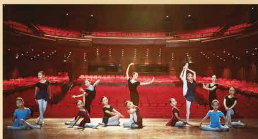
Children's Ballet "The Gift at the Spectacle"

If you are looking for something more of a Christmas tradition, watch the lovely children performing holiday ballet and immerse in the Tchaikovsky vibe, an absolute all-time favorite among audiences of all ages. Don't let the excitement end here! Continue with the immersive Sino Portuguese cultural experience at Grande Praça at MGM MACAU and enjoy a 40-min storytelling puppet show. Be sure to bring your family along!