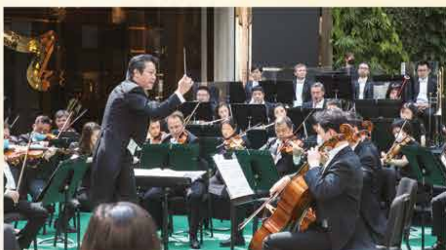
Live Festive Symphony

Kick off this holiday, rejoice and be merry at the Spectacle with Carols, Festive Symphony with the Macao Orchestra, the local school choir and ARI & The Party Animals. From traditional, classics to modern favorites, there will be something for everyone this winter to get in the mood of the holidays!