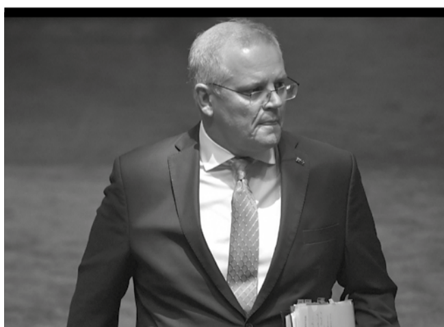
Prime Minister Scott Morrison

As a prerequisite for speaking, leaders had to provide a guidance note se-