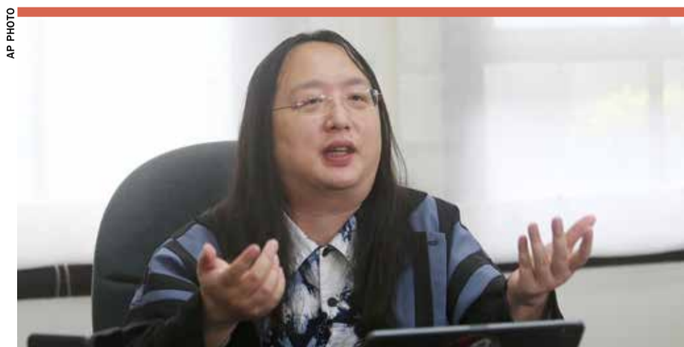
Taiwan's Digital Minister Audrey Tang

President Tsai Ing-wen said creating such a body would be a priority