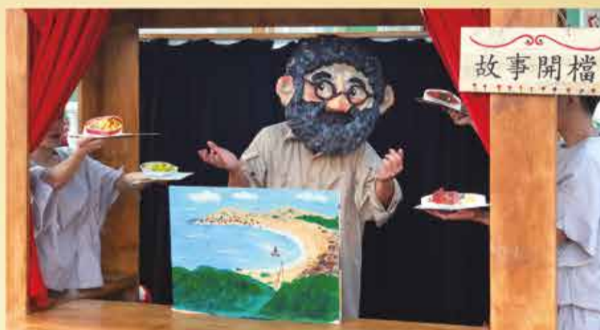
The Story Vendor at Mini Lisbon

After all the WOW performances, it is time we create something sweet and lovely to decorate this winter season. Keep the festive vibe going with Christmassy workshops including pinecone Christmas tree, floral decorations and framed 3D starry night lamp at 'M Art at MGM COTAI. Unleash your creativity and make your own decorations! Happiness never ends, complete your end-of-year holidays with celebratory menus such as themed afternoon tea, special teppanyaki omakase, festive buffet and more at our signature restaurants!