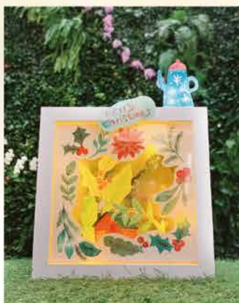
Light up your Winter Wonderland - Yolanda Kog

After all the WOW performances, it is time we create something sweet and lovely to decorate this winter season. Keep the festive vibe going with Christmassy workshops including pinecone Christmas tree, floral decorations and framed 3D starry night lamp at 'M Art at MGM COTAI. Unleash your creativity and make your own decorations! Happiness never ends, complete your end-of-year holidays with celebratory menus such as themed afternoon tea, special teppanyaki omakase, festive buffet and more at our signature restaurants!