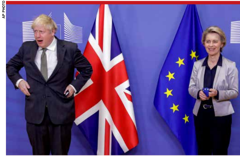
European Commission President Ursula von der Leyen (right) and British Prime Minister Boris Johnson

BRITAIN'S foreign minister said yesterday that negotiations on a trade deal with the European Union will reach a "moment of finality" this weekend, with both sides assessing chances of an agreement as slim.