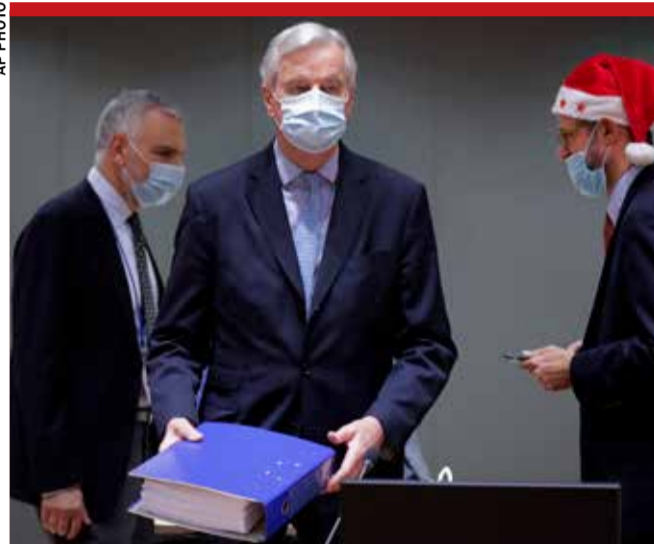
Michel Barnier, center, carries a binder of the Brexit trade deal during a special meeting of Coreper, at the European Council building in Brussels

be raised, as the U.K. loses the kind of access to a huge market that only membership can guarantee. They range from access to fishing waters to energy markets, and include everyday ties so important to citizens like travel arrangements and education exchanges.