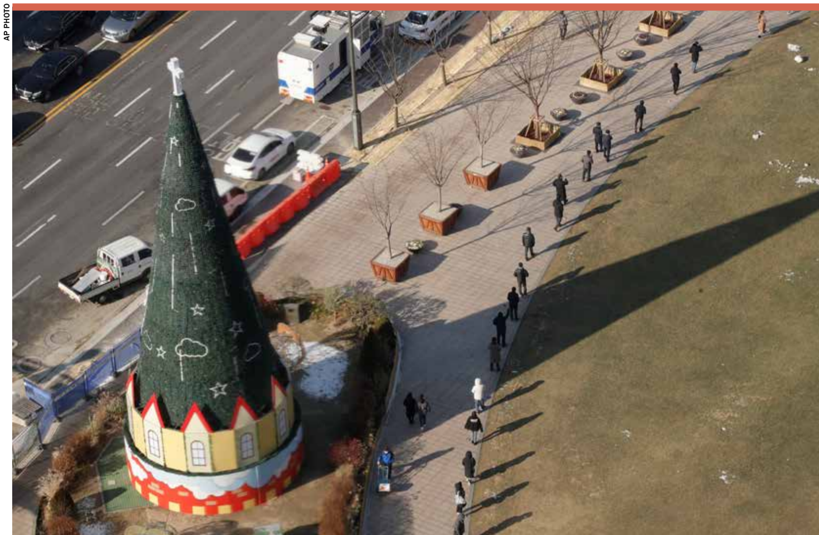
People queue in line to wait for coronavirus testing while maintaining social distancing near a Christmas decoration at Seoul Plaza in Seoul