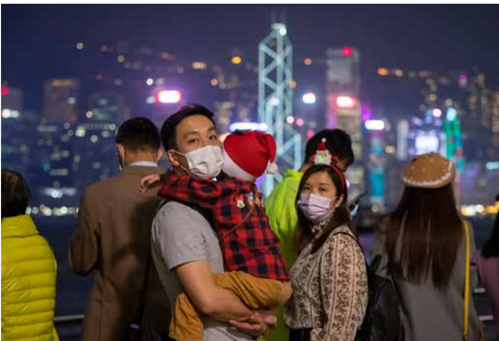
Maskmas. A family wearing protective masks to prevent the spread of coronavirus, celebrate the Christmas season, at the waterfront of Victoria Harbour in Hong Kong on Christmas Eve.