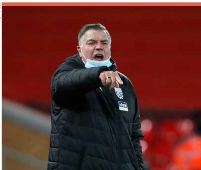
West Bromwich Albion's manager Sam Allardyce