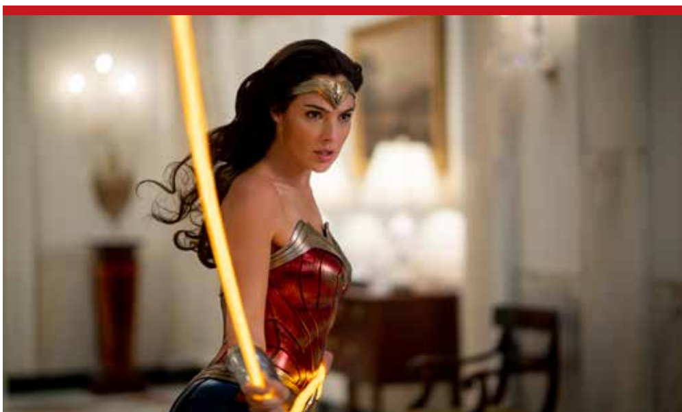
Gal Gadot in a scene from “Wonder Woman 1984”

DESPITE premiering simultaneously by streaming service, “Wonder Woman 1984” managed the best box office debut of the pandemic, opening with $16.7 million over the Christmas weekend, according to studio estimates yesterday [Macau time].