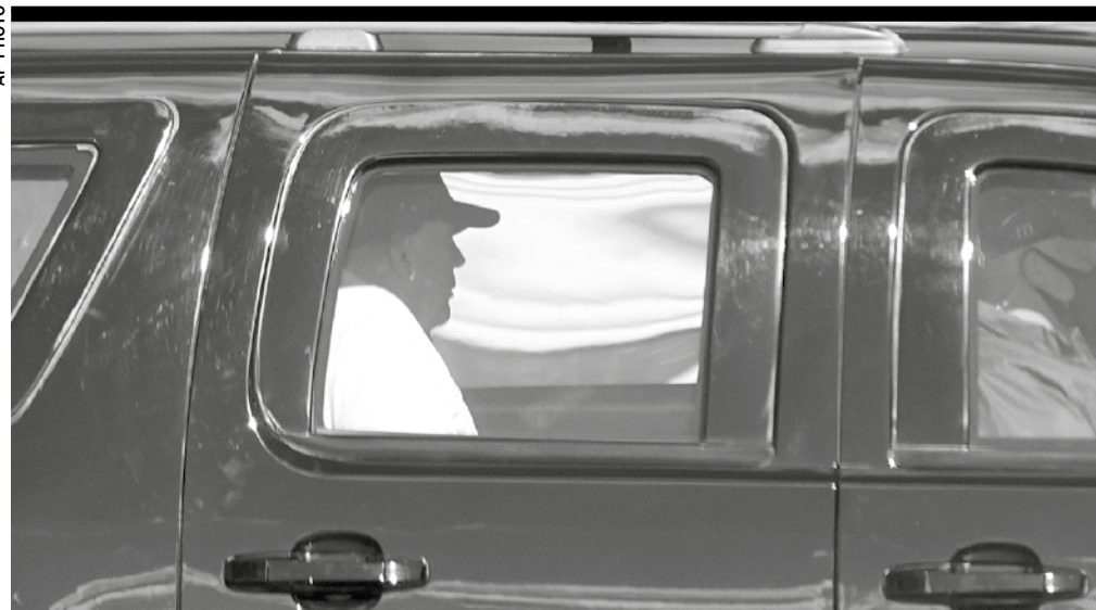
Donald Trump rides in a motorcade vehicle as he departs Trump International Golf Club, Sunday

"I will sign the Omnibus and Covid package with a strong message that makes clear to Congress that wasteful items need to be removed," Trump said in the statement.