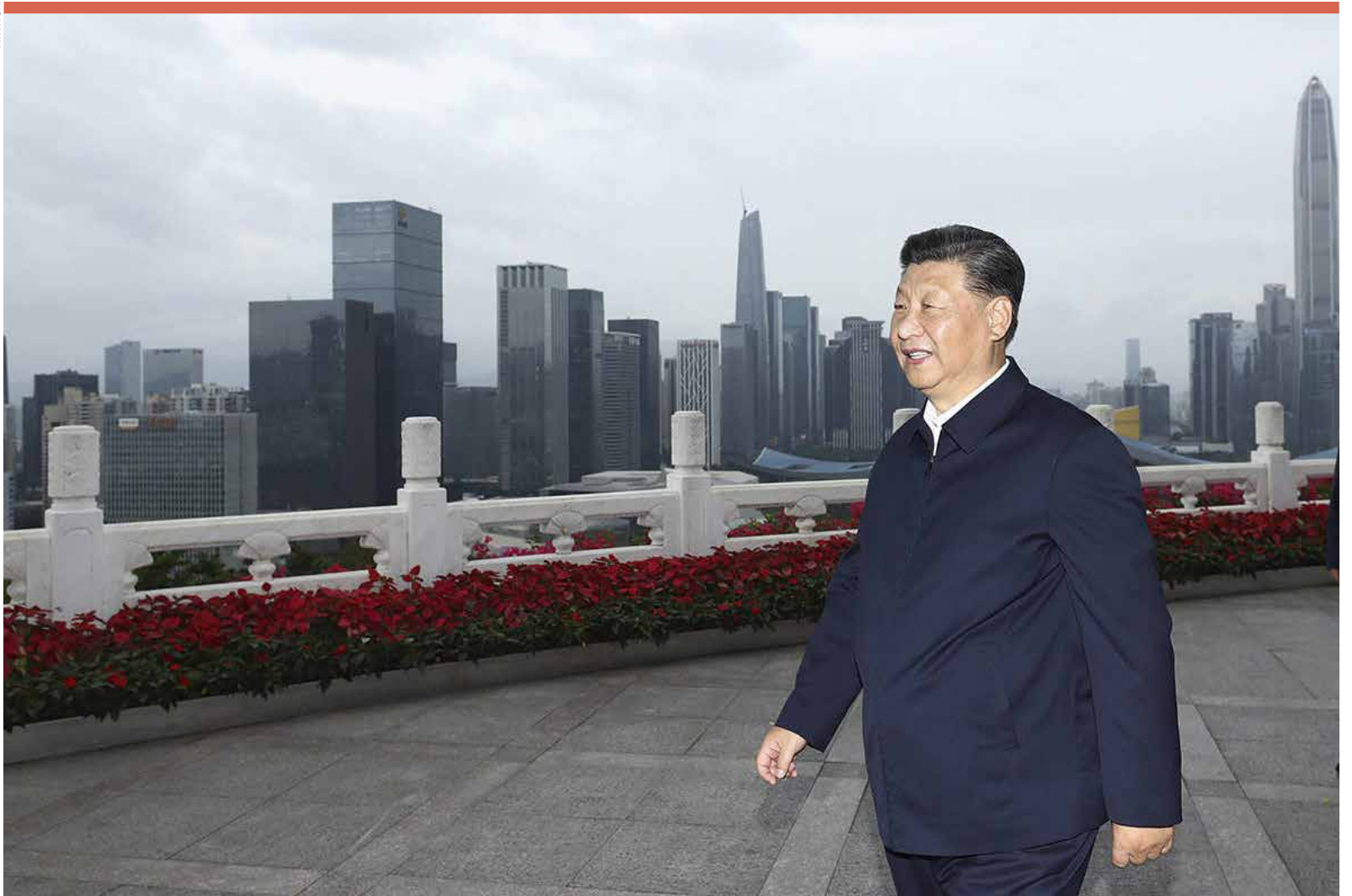
President Xi Jinping visits Shenzhen in October

and Macau residents when they work and live on the mainland. Macau should make good use of these policies and actively integrate into the construction of the Greater Bay Area (GBA) to further consolidate and enhance its competitive advantage.