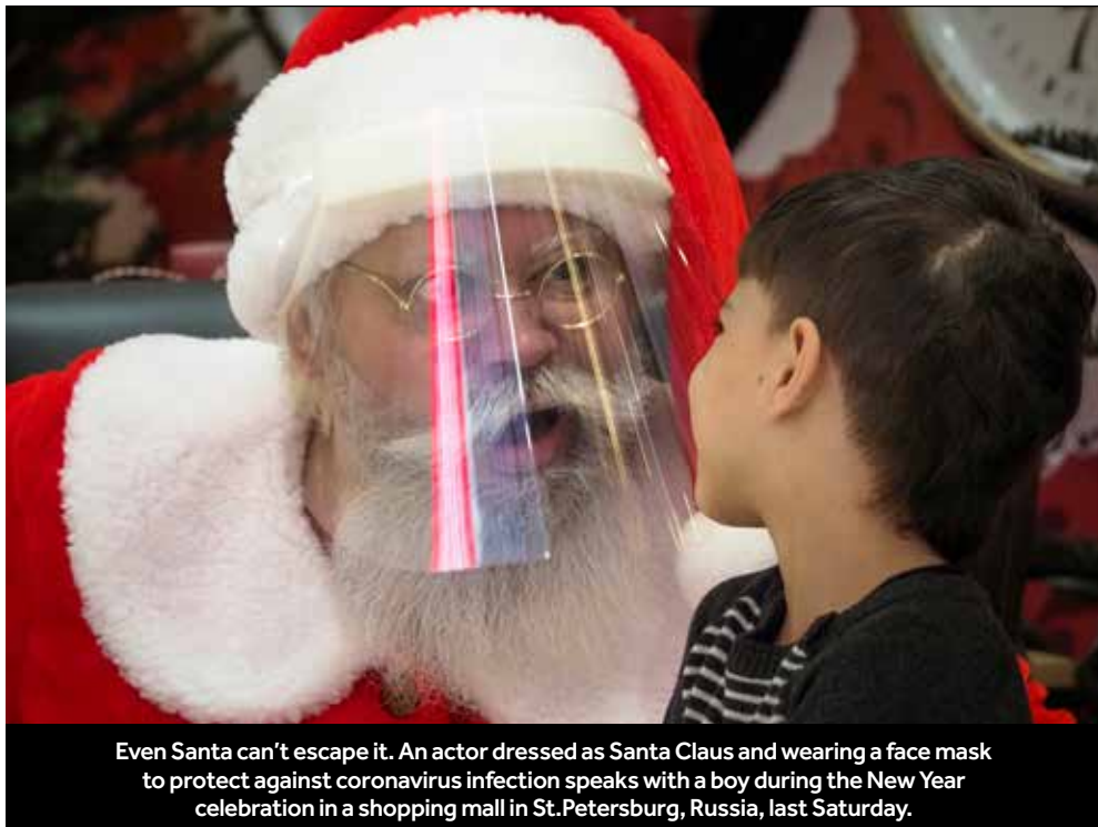
Even Santa can't escape it. An actor dressed as Santa Claus and wearing a face mask to protect against coronavirus infection speaks with a boy during the New Year celebration in a shopping mall in St.Petersburg, Russia, last Saturday.