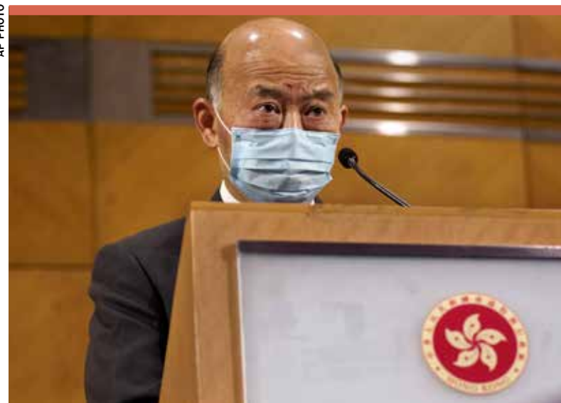
HK Chief Justice Geoffrey Ma

Hong Kong, which was handed back to mainland China by the British in 1997, operates