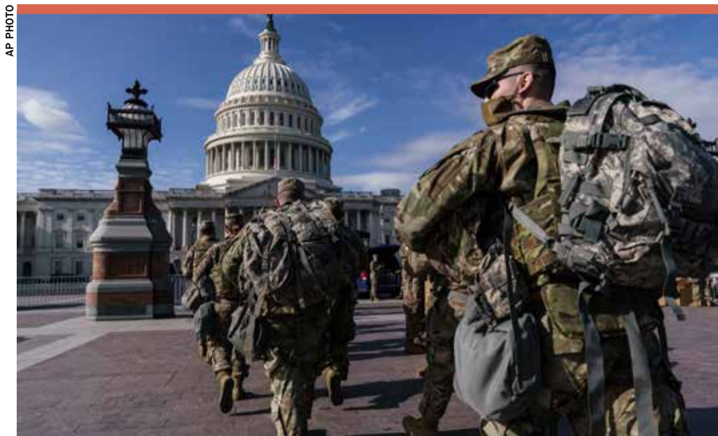
National Guard troops reinforce security around the U.S. Capitol