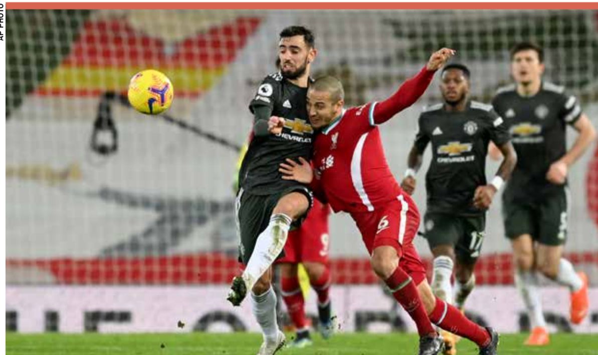
Liverpool's Thiago vies for the ball with Manchester United's Bruno Fernandes (left)

The clash between England's two most-decorated clubs never