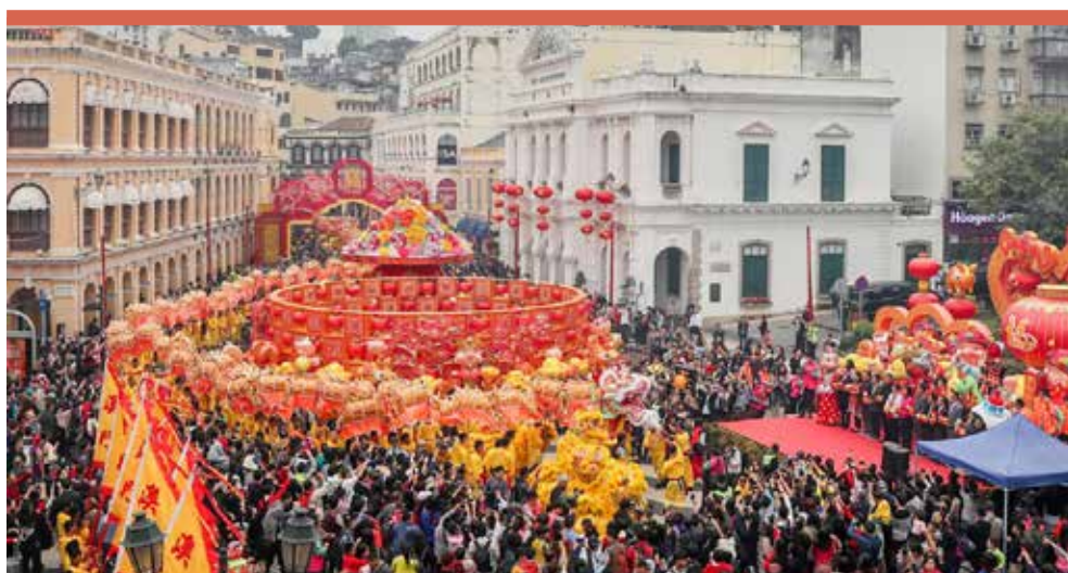
Senado Square during Lunar New Year celebration prior pandemic outbreak

"As of now, we still have not had an estimate of tourist arrivals during the Spring Festival, as we wish to wait and see for a little longer and garner more