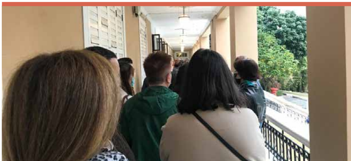
Long queues of voters yesterday at the Portuguese Consulate

tugal, the high number of people who showed up to vote might also be related to Covid-19 and the inability of most people to travel for almost one year.